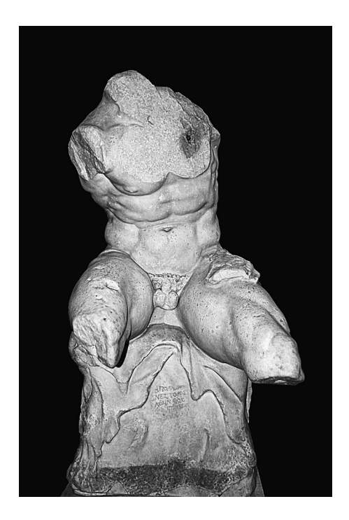
FIG. I.1 — The Belvedere Torso.

sentation as the modes in and through which persons, events, and things are made sensible are overturned. This posits the at once paradoxical and counterintuitive idea that the rise of democracy announces the limits of representation itself. That is to say, democracy emerges when the hylomorphic relation of form and content in representation is no longer viable because the force of efficient causality that sustained the function of representation is dissolved. This centrifuge of relationality is a characteristic of the aesthetic regime of the sensible, which, it's worth repeating, coincides with those incipient democratic moments that disarticulate extant structures of and commitments to representation as the ground of political authority.