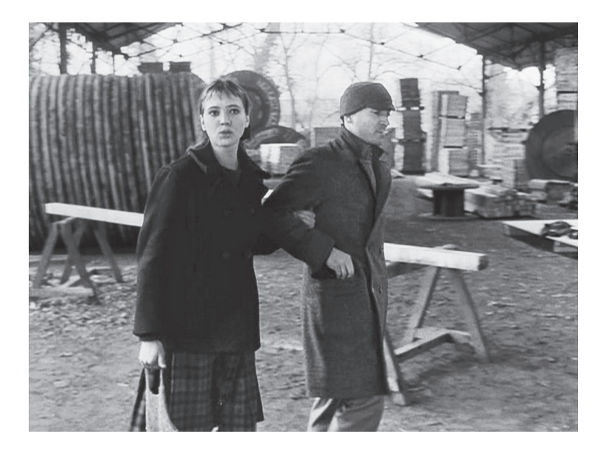
FIG. 4.1 — A scene from Bande à part , directed by Jean-Luc Godard, 1964. Screenshot from Criterion Collection DVD.

"A plan? What for?" This, as if to declare that the film itself has no plan but is simply a series of recorded movements and gestures assembled in a plan-like way. (Plan is the French word for the cinematic shot that, Ronald Bogue notes, "has its origin in the early silent cinema, when filmmakers spoke of establishing continuity between planes of action in succeeding scenes.")16 Such moments of dissociative acknowledgment arrest because they render serpentine the elements of the film, elements that possess no inherent logic of movement and arrangement. The title of the film suggests this: Band à part (noun) refers to the trio that is the thieving collective, but Band à part (verb) also refers to the act of theft which is a loosening of binds (i.e., a banding apart) that displaces things from one place to another. The fact of association is not bound to a necessary logic or justification; participation is unreasonable, if you will. Hence the force of Godard's montage that "decomposes the assembly of gestures and images and returns them to their basic elements. The universality of his art is that it establishes the most basic elements, and assemblies thereof, that make a discourse and a practice intelligible by making them comparable to other