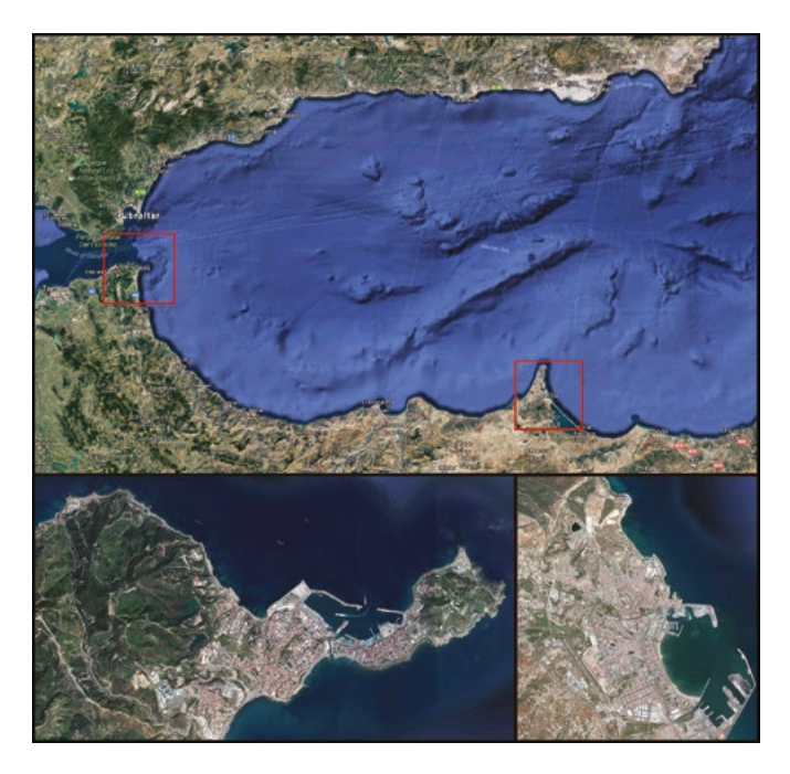
Fig. 3.1 Map of Ceuta and Melilla in Northern Morocco, three screenshots from Google Maps. © 2017 Google, all rights reserved.<sup>4</sup>

It gave £200 million for the construction of the razor-wire border fence around Ceuta, and it assumed 75 percent of the costs of the first project from 1995 to 2000.