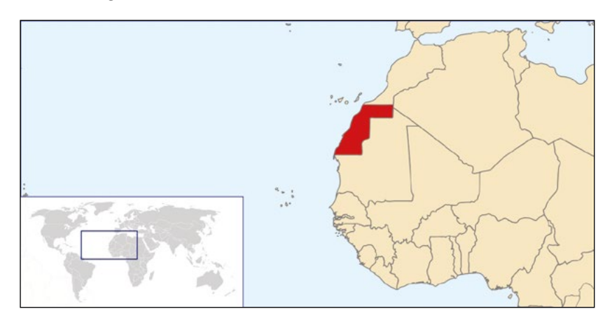
Fig. 5.1 Location of the Western Sahara. Map by Rei-artur, CC BY-SA 3.0.19

an entity different from Morocco in the region, Morocco had been most unwilling to do so again, if for no other reason than the simple fact that the colonial regimes involved were very different and reflected different colonial approaches rather than any inherent differences in the nature of the contiguous territories involved.<sup>18</sup>