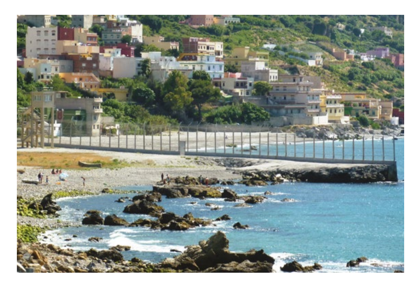
Fig. 3.3. Fence of Ceuta (15 June 2012). Photo by Mario Sánchez Bueno, CC BY-SA 2.0.7 \,