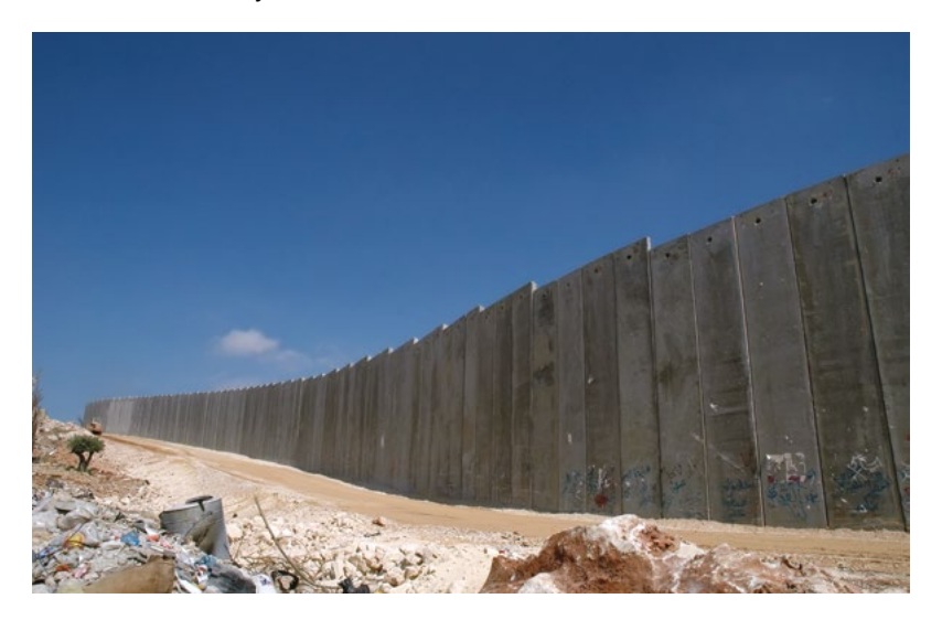
Fig. 1.1 The West Bank separation wall (17 August 2004).<sup>20</sup>

a "seam zone" and declared a "closed zone". According to the Israeli military Declaration of Closing an Area No. S/20/03 made on 2 October 2003, "no person will enter the seam area and no one will remain there". This order, however, does not apply to Israelis or those who have the right to immigrate to Israel according to the country's Law of Return.<sup>18</sup> The Palestinians who live near the area are allowed to remain in their homes and on their lands only if they possess a written permit authorizing permanent residence. It is expected that, when the separation wall is finished as planned, approximately 65,000 Palestinians will require permits to cross the wall into the West Bank where they legally reside, and some 270,000 Palestinians living in these areas will be trapped in closed military areas between the wall and the Green Line or in enclaves encircled by the wall.<sup>19</sup> That these confiscated lands in the "seam area" include the West Bank's most valuable agricultural land and water resources measuring 73,000 dunums, a vital source of income for the Palestinians in the region, is another cause of concern for a failing Palestinian economy.