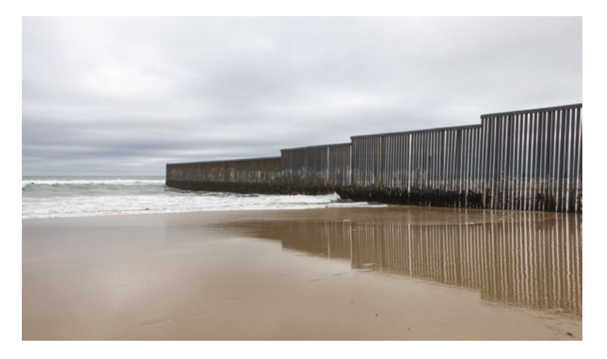
Fig. 4.1 U.S.-Mexico border fence at Tijuana (6 February 2017).<sup>11</sup>

before the 1990s, it started seriously building fences and escalating control measures along its borders with Mexico in 1994 under Clinton's administration, as a comprehensive policy. The border south of San Diego, which has been identified as an area of high human smuggling and drug trafficking, was the first borderland to be fenced. Republican representative Duncan Hunter, the former Chairman of the House Armed Services Committee, played a significant role in the construction of the first security fence (23 kilometers) on the U.S. southern border separating San Diego County and Tijuana (Mexico).