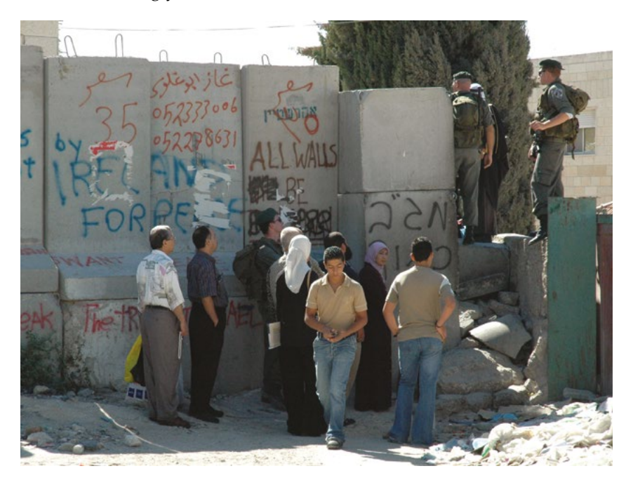
Fig. 1.2 A checkpoint in the West Bank Separation Wall, near Abu Dis (18 August 2004).<sup>30</sup>

• Palestinian Muslims and Christians can no longer freely visit religious sites in Jerusalem. Permits are needed and are increasingly difficult to obtain.