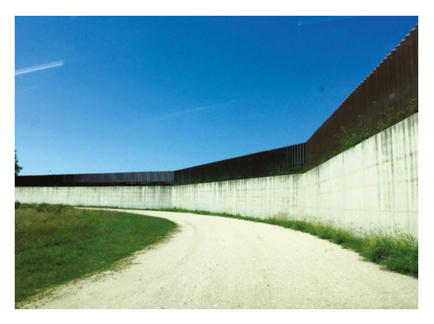
Fig. 4.2 South side of the United States-Mexico border wall in Progreso Lakes, Texas (21 March 2016).<sup>17</sup>

The financial cost of the project has increased year by year. Appropriations for the Homeland Security Department for fiscal year 2007 provided USD 1.2 billion for the installation of fencing, infrastructure and technology along the border; USD 31 million of this total was designated for the completion of the San Diego fence.<sup>15</sup> Appropriations for fencing and other border barriers have increased markedly since the plan entered into force from USD 6 million in fiscal year 2002 to USD 647 million in fiscal year 2007. The fiscal year 2008 appropriation, according to Customs and Border Protection, included USD 196 million for fence construction.<sup>16</sup>