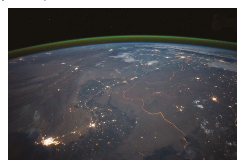
Fig. 2.2 India-Pakistan border at night (23 September 2015).<sup>47</sup>

In addition, landmines are laid along the fence as it runs from flat plains through mountainous forests.<sup>46</sup>