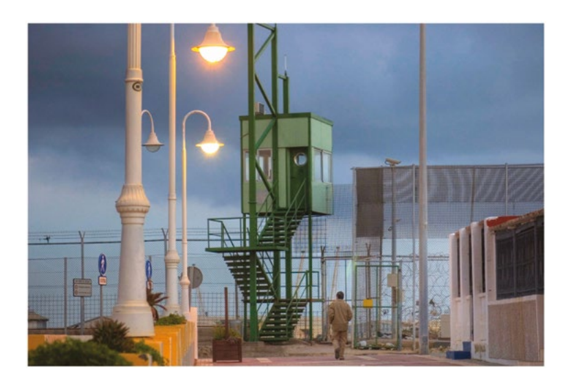
Fig. 3.2 Fence of Melilla (28 February 2009).<sup>6</sup>