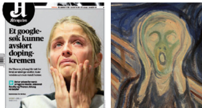
Figure 9.3. The photo of Johaug on the front page, Aftenposten 14.10.16 (see fig. 9.2 above), and the iconic painting by Edvard Munch, “The Scream” (1893). Photo: © Munchmuseet. Reproduced with permission; no reuse without rights holder permission.

Vectors can also express action, often in the shape of imaginary diagonal lines in the image. A vector connects the participants as doing something to or for each other, expressing narrative patterns (Kress & van Leeuwen, 2006). In the photo of Johaug, a vector is derived by the direction of her glance, which is upwards and slightly to the right (to the beholder). This perspective indicates what she may be looking at. It also serves as an expression of how she feels. Johaug is looking at the ceiling, however, the posture may be