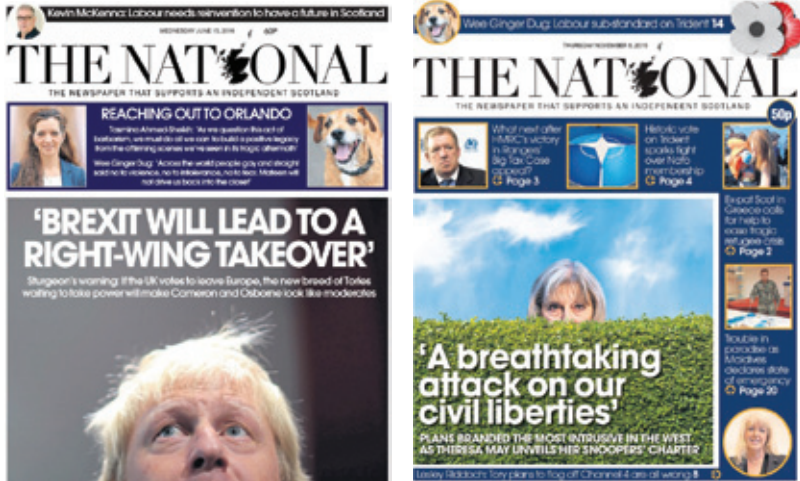
Figures 6.21 & 6.22. Boris Johnson and Theresa May only half there. Facsimiles reproduced in accordance with the Norwegian Copyright Act.

As we slide further down the negative slope only part of the individual in question might be shown. Below we see Boris Johnson almost literally as a “half-wit” while half of a snooping Theresa May disappears behind a hedge: