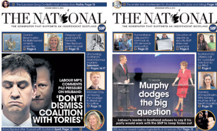
Figures 6.39 & 6.40. Nicola Sturgeon and Jim Murphy miles apart. Facsimiles reproduced in accordance with the Norwegian Copyright Act.

As regards haptics, we might usefully contrast Sturgeon’s rather formal handshake with Cameron with The National ’s presentation of her meeting with EU President Jean-Claude Juncker: