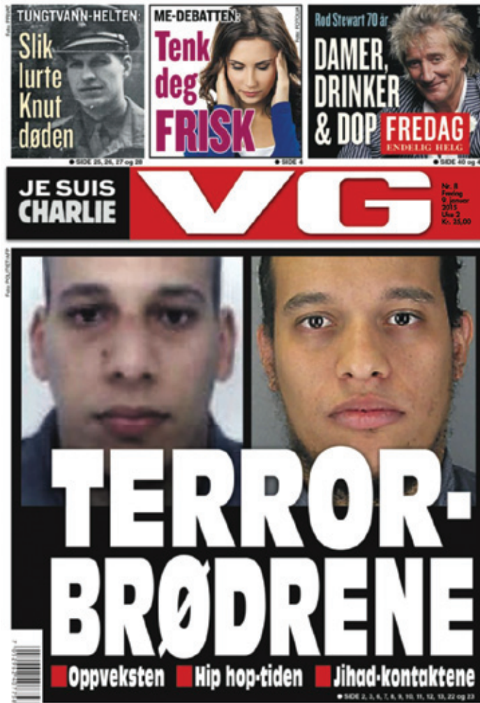
Figure 14.4. Photographs of the Kouachi brothers, highlighted as terrorist mugshots by a thick, black frame. Facsimile of the Norwegian tabloid VG, 9 January 2015. Facsimile reproduced in accordance with the Norwegian Copyright Act.