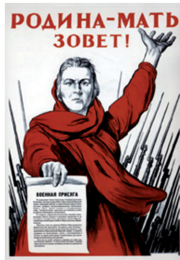
Figures 6.35 & 6.36. Propaganda-style images (copy of the Родина-Мать poster kindly supplied by the Hoover Institution Archive, Poster Collection, Poster RU/SU 2317.23R). Facsimiles reproduced in accordance with the Norwegian Copyright Act.