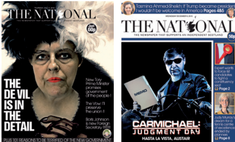
Figures 6.25 & 6.26. Theresa May and Alistair Carmichael in pop-culture alter egos. Facsimiles reproduced in accordance with the Norwegian Copyright Act.

Or perhaps not. The ultimate indignity may be to have your identity hijacked by a character from popular culture, the images below showing Theresa May as Cruella de Vil and Alistair Carmichael as The Terminator: