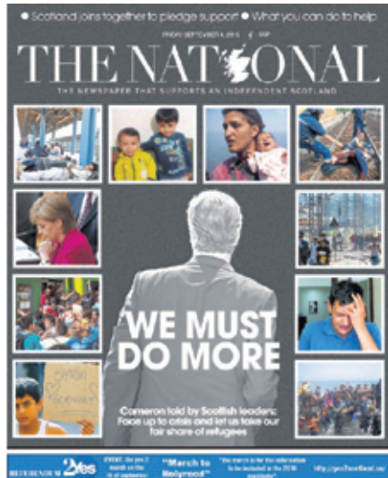
Figures 6.13 & 6.16. David Cameron in various negative guises. Facsimiles reproduced in accordance with the Norwegian Copyright Act.