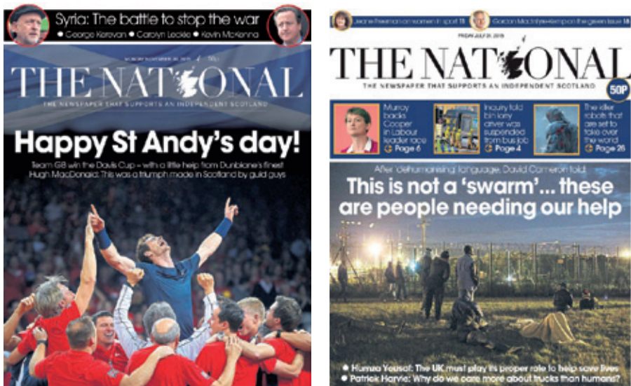
Figures 6.47 & 6.48. The comfort and loneliness of the crowd. Facsimiles reproduced in accordance with the Norwegian Copyright Act.