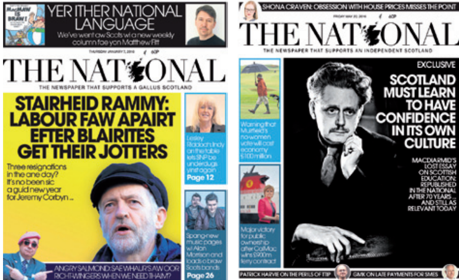
Figures 6.1 & 6.2. A National front page in Scots, and a second featuring Hugh MacDiarmid (1892-1978), Scotland's best known Scots-language poet. Facsimiles reproduced in accordance with the Norwegian Copyright Act.

however small, is not without importance for the range of subject positions now publicly available to those living in the country.