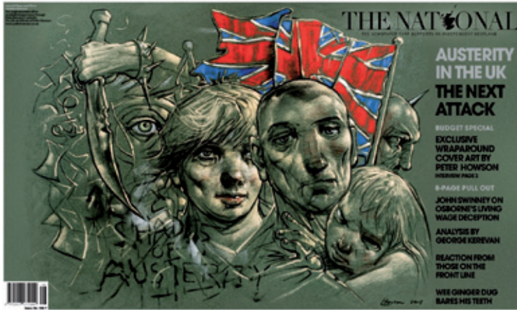
Figures 6.59. Peter Howson’s dramatic depiction of Scotland under UK rule. Facsimile reproduced in accordance with the Norwegian Copyright Act.

The Manichean nature of this universe explains many (perhaps all) of the apparent conundrums in The National’s coverage. For example, it explains why Ruth Davidson, the current leader of Scotland’s second-largest political party, did not appear in her own right on any front cover until 12 September 2016 (issue 508). While the unexpectedly good showing by her party in the snap general election held in the UK in 2017 has to some extent reversed this trend – she has now appeared on 11 front covers – images of her remain invariably negative or trivialising and her tally of front covers continues to appear paltry compared with Nicola Sturgeon’s 59 appearances: