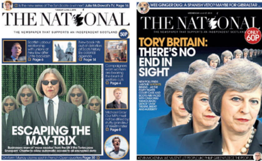
Figures 6.27 & 6.28. Theresa May ad infinitum... Facsimiles reproduced in accordance with the Norwegian Copyright Act.

tends to be on a woman getting on with the job, an emphasis consistently underpinned by her businesslike but generally workaday dress code. Such representations can very exceptionally border on the aggressive, their unorthodox and slightly chaotic composition suggesting that things are about to get “shaken up”: