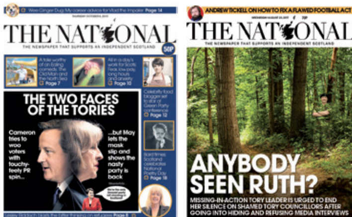
Figures 6.60 & 6.61. Ruth Davidson – irrelevant bit player in Tory in-fighting or disappearing into the background. Facsimiles reproduced in accordance with the Norwegian Copyright Act.

The Manichean nature of this universe explains many (perhaps all) of the apparent conundrums in The National’s coverage. For example, it explains why Ruth Davidson, the current leader of Scotland’s second-largest political party, did not appear in her own right on any front cover until 12 September 2016 (issue 508). While the unexpectedly good showing by her party in the snap general election held in the UK in 2017 has to some extent reversed this trend – she has now appeared on 11 front covers – images of her remain invariably negative or trivialising and her tally of front covers continues to appear paltry compared with Nicola Sturgeon’s 59 appearances: