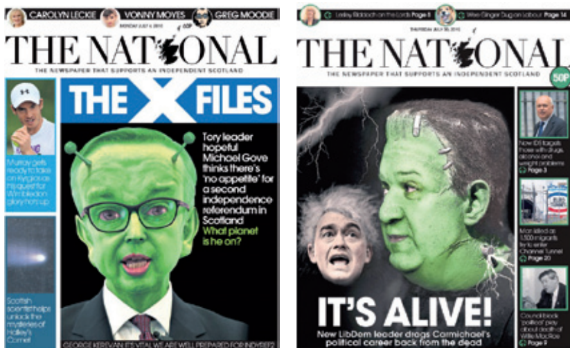
Figures 6.19 & 6.20. Anti-independence politicians Michael Gove and Alistair Carmichael in monster mode. Facsimiles reproduced in accordance with the Norwegian Copyright Act.

Appearing as a Martian or Frankenstein’s monster offer other options – the latter clearly based on Boris Karlov’s monster though totally lacking in its “redemptive” possibilities (Eco, 2011, pp. 271/295):