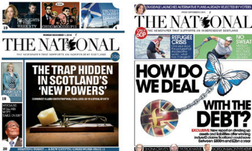
Figures 6.53 & 6.54. I want to break free... Facsimiles reproduced in accordance with the Norwegian Copyright Act.

to express, known as the “target domain” (Charteris-Black, 2004). Thus in Shakespeare’s well-known phrase “If music be the food of love, play on”, “food” and “music” are the tangible/audible vehicles for the abstract concept “love”, which they simultaneously express and bring closer to the reader’s/listener’s experience. Though the number of vehicles used by The National is large, certain patterns and repetitions can be identified. There are numerous flags (mainly saltires and EU flags), eight images deploy submarines or missiles, the target being defence spending, while another ten show maps of Scotland with varying meanings. Some of the numerous metaphors of imprisonment and entrapment (walls, barbed wire, padlocks, shackles, clamps, nooses and so on) are very striking, and range from the grim to the beautiful: