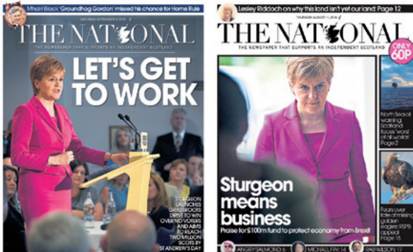
Figures 6.29 & 6.30. Nicola Sturgeon plays good cop/bad cop. Facsimiles reproduced in accordance with the Norwegian Copyright Act.

tends to be on a woman getting on with the job, an emphasis consistently underpinned by her businesslike but generally workaday dress code. Such representations can very exceptionally border on the aggressive, their unorthodox and slightly chaotic composition suggesting that things are about to get “shaken up”: