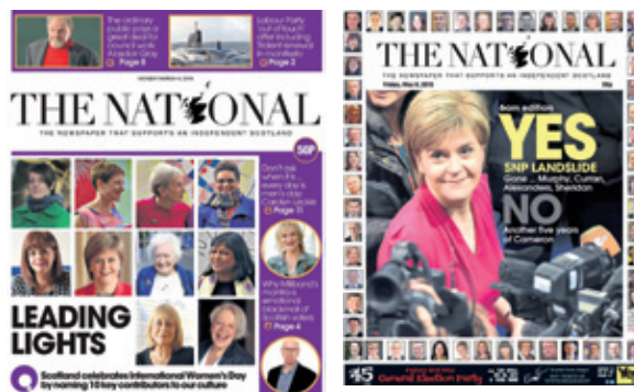
Figures 6.45 & 6.46. Individuals bound by a common purpose. Facsimiles reproduced in accordance with the Norwegian Copyright Act.

Where some level of individual identification is needed for larger groups, the technique of composite presentation is almost invariably used whereby smaller separate images of each of the individuals involved are presented. The numbers can vary from four or five through several dozen to numbers so large they are impossible to count. There are 19 cases of this type: the second image below shows Nicola Sturgeon surrounded by all the SNP Members of (the UK) Parliament elected on 8 May 2015: