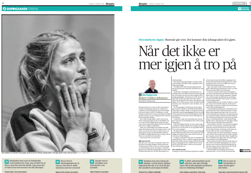
Figure 9.5. Page 4–5, Aftenposten 14.10.16. Facsimile reproduced in accordance with the Norwegian Copyright Act.

This photo establishes a part of the story, which continues in the verbal text on the following pages, labeled “The tears”. This caption introduces a kind of omnipotent narrator, the journalist expressing what it looked like Johaug was thinking and feeling: “She talked for 8-9 minutes. Several times, it looked as if Therese Johaug was thinking, ‘What am I doing here? What is going on?’” The photo is in black and white, which makes it appear less in touch with reality, and less as something happening “here and now”. Black and white photos are often seen as connecting to the past. There may also be another form of symbolism in this; a way of suggesting that this is not necessarily picturing the