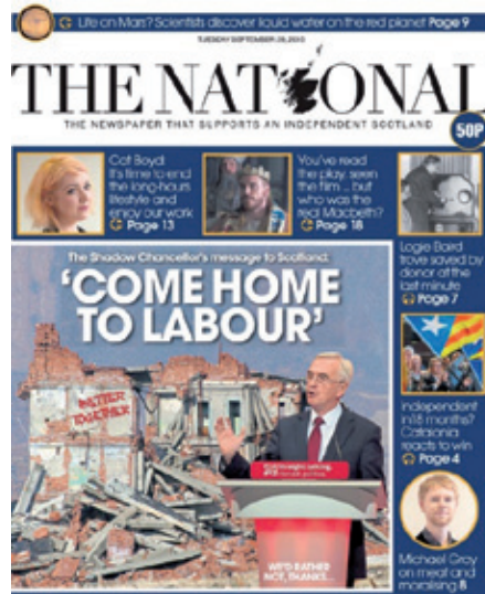
Figures 6.51 & 6.52. The destruction of Syria vs. the collapse of the British Labour Party. Facsimiles reproduced in accordance with the Norwegian Copyright Act.