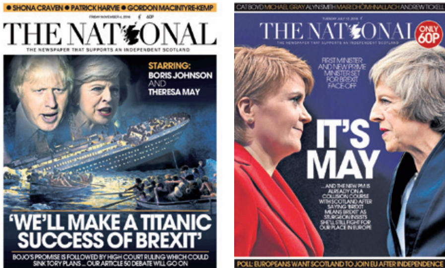
Figures 6.37 & 6.38. Theresa May sinking with Boris Johnson vs. squaring up to Nicola Sturgeon. Facsimiles reproduced in accordance with the Norwegian Copyright Act.

Small Group Exposure. The slightly greater number of actors present in small-group exposure enables additional semiotic resources to be mobilised highlighting, for example, that individuals are somehow “in the same boat” or on opposite sides of an argument: