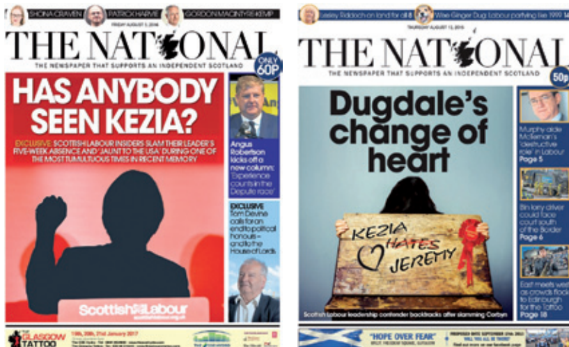
Figures 6.23 & 6.24. Kezia Dugdale as a shadow of her former self. Facsimiles reproduced in accordance with the Norwegian Copyright Act.

Perhaps the ultimate indignity is to appear merely as a silhouette, as in these images of Kezia Dugdale: