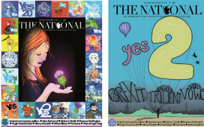
Figures 6.5 & 6.6. Two prize-winning front covers. Facsimiles reproduced in accordance with the Norwegian Copyright Act.

The great importance The National gives to its front covers was clear from issue 1 (shown above). This combined a metaphor of the Fourth Estate “watch-dog” function of the press (“we have our eye on you”) with the social issue of child poverty. On 8 May 2015 it published no fewer than three different covers related to the Scottish parliamentary elections the day before (the third appears as Figure 6.46 below), while on 17 September 2016 it published two different covers, these having been selected from designs sent in by readers (in the first immediately above, the thistle is a long-standing emblem of Scotland, while the “2” in the second refers to “indyref2”, an abbreviation widely used to refer to the possibility of a second independence referendum).