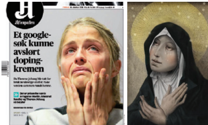
Figure 9.4. The photo of Johaug on the front page, Aftenposten 14.10.16 (see fig. 9.2 above), and a depiction of "The Suffering Madonna". Illustration by Endre Barstad, reproduced with permission; no reuse without rightsholder permission.

interpreted as a glance directed towards the sky. We tend to associate this gaze with deeply religious motives, as an expression of hope or hopelessness, or in images of someone who prays to God. The depiction is thus an indicator of the intensity of feelings that Aftenposten tries to create in this presentation. There are striking similarities between Johaug's expression and postures that prevail in religious motifs and variations of "The Suffering Madonna", an icon that is common in Catholic and Orthodox Church decorations: