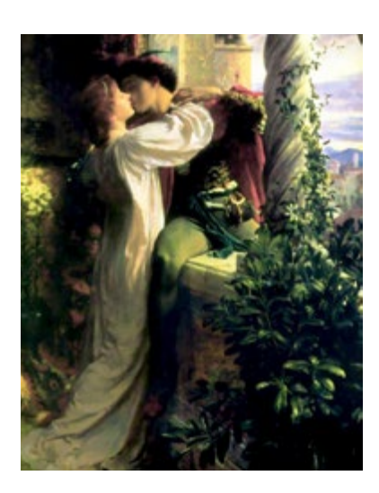
Frank Dicksee, Romeo and Juliet (1884). Southampton City Art Gallery. 142

When her initial willingness to cooperate changes into what seems to him an inexplicable and moody resistance, Capulet makes it clear what Juliet's position is: