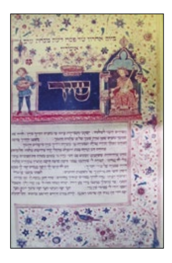
Illumination for the opening verse of Song of Songs, the Rothschild Mahzor, Manuscript on parchment. Florence, Italy, 1492.^2

One of the most powerfully erotic, celebratory, and secular love poems in all the world's literature, the Song of Songs (שִׁירִים, or Shir ha-Shirim ) has endured nearly two thousand years of interpretation that attempts to tame it and explain it away. Traditionally dated to sometime around 950 BCE, the Song has a complicated textual history.