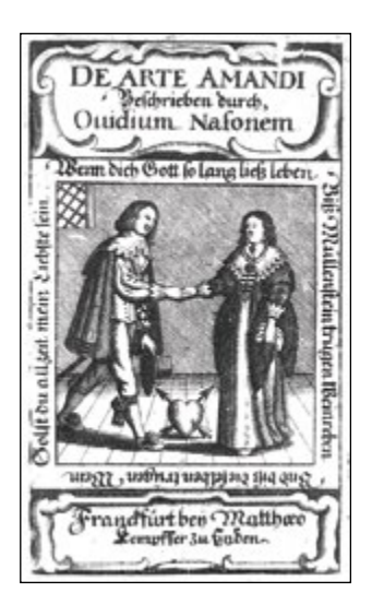
Title page of a 1644 edition of Ovid's Ars Amatoria.<sup>77</sup>

banishment. Rather than passion sublimated into a search for the divine, these poems are perhaps our first clear example, unsullied by the allegorizing and temporizing mood, of what the troubadours will call fin'amor , love as an end in itself.