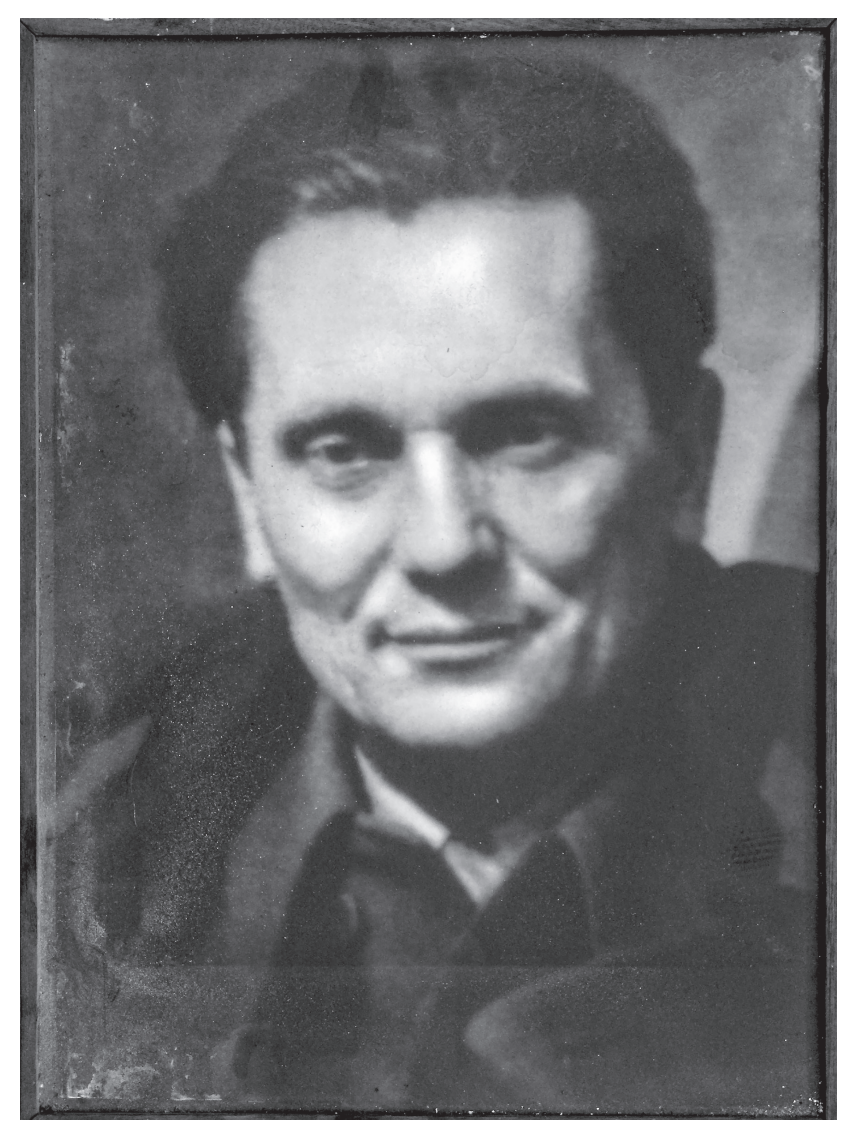
Figure 5.1. The official image that used to be displayed in public buildings. Photo: Željko Livnjak, September 2015. Used with permission.

in his office and then turned, slowly, to face the table laden with drinks. The partygoers followed suit and the picture was ignored. Nobody talked about Tito, or at least if they did it was drowned by the music, and it was a while before people's party spirits were again raised. But after a