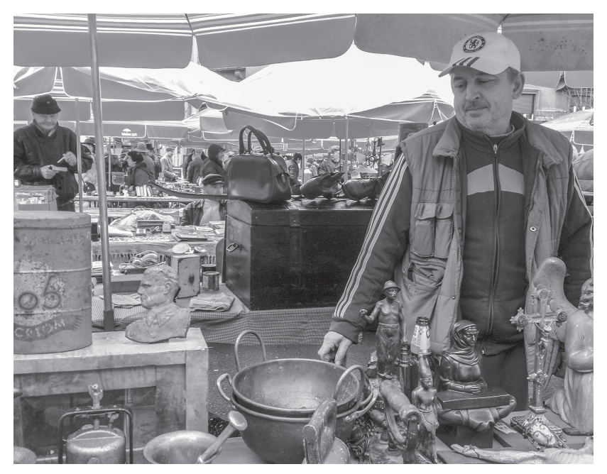
Figure 5.4. Selling Tito at Britanac in Zagreb. Photo: Sanja Potkonjak, February 2014.

knowledge and memories when faced with Tito imagery, as shown in the open-air markets in Zagreb. Uprooted from their thriving historical environment, Tito artefacts are diverted from their previously expected, albeit heterogeneous, meanings and collective support. However, their potential to produce suspense and create an immediate and object-related affective cohesion and interaction around themselves makes every Tito object an extraordinary artefact that provokes people into expressing their feelings of appreciation or utter irritation and disgust.