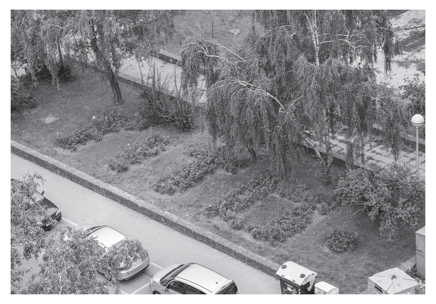
Figure 5.2. Tito's geoglyph in the city park.

that many different nationalities once lived in the building, she warned Sara that some people were still 'under the impression of war' and that 'everything changed in the 90s'. What changed was not just how neighbours looked at one another when they learned the importance of being a Croat, a Serb or a Muslim. More than anything else, the world they knew changed. They were trapped and had to refashion themselves, and be careful about what they said in public. The elderly woman said: 'A few days ago I was standing there facing the lettering – the rose bushes haven't started to bloom yet. I wonder each year whether they will still be there in the spring. Shaped in Tito's name!' She thought that it was 'peculiar' that even during the war (in the 1990s) she never saw the bushes looking unkempt. She had expected someone to come in the night and pull everything out, to 'clean away' the 'annoying memory'.