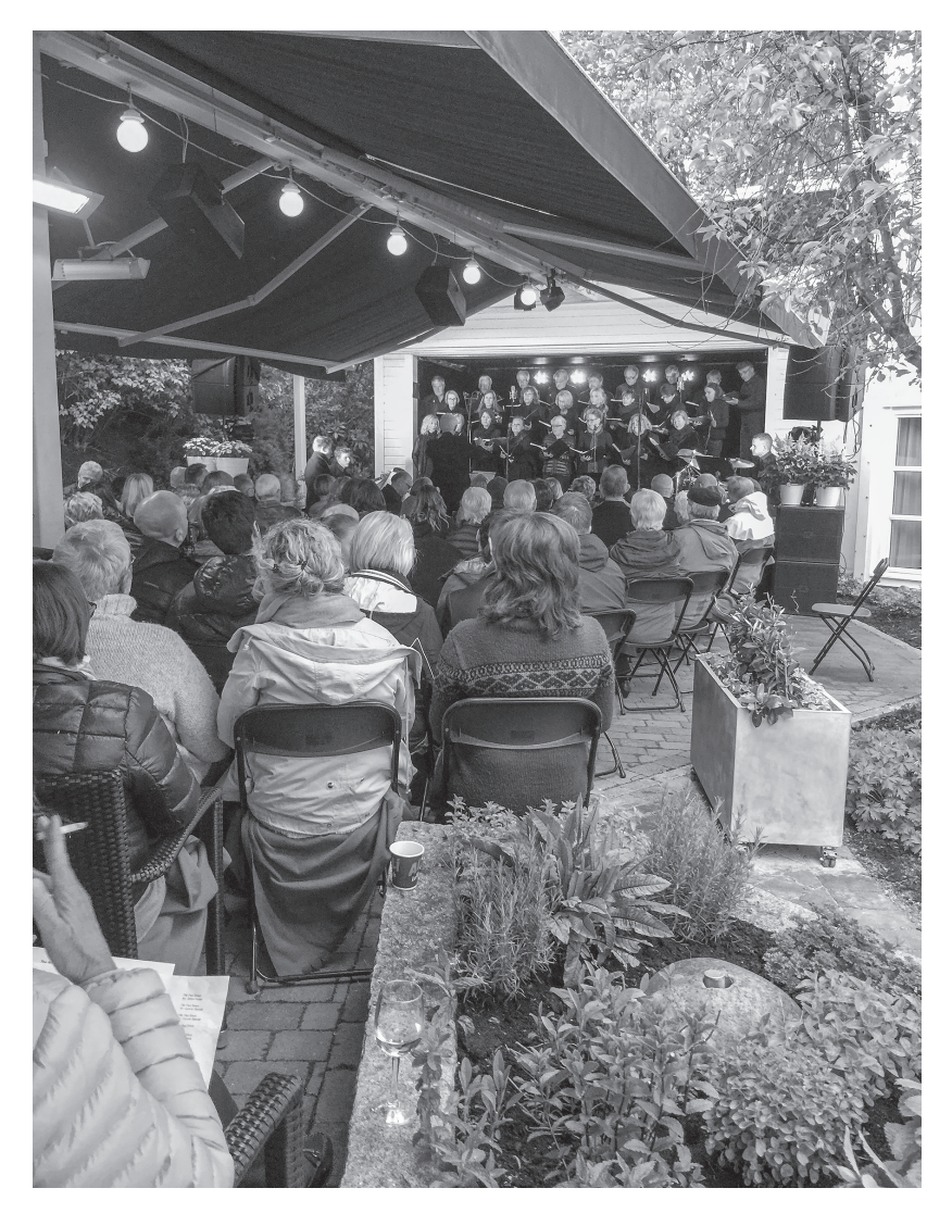
Figure 10.3. The hotel garden with an outdoor stage erected temporarily during the summer of 2012. Beate has big dreams for the stage.

who had already surveyed many different sites in Norway were now on the lookout for a 'real deal' and something unusual. The company had checked Lillesand out a couple of times, liked the location and its beautiful architecture and now wondered how much more there was to