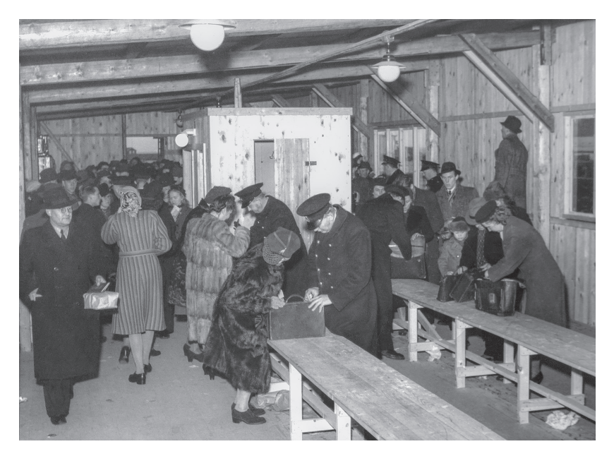
Figure 6.1. All of a sudden your private life is opened up for inspection. Customs officials checking ferry travellers from Copenhagen, Denmark, in Malmö, Sweden, 1948. Copyright IBL.

In the travel handbook from 1951 quoted earlier, the author has a detailed section on customs problems, which begins 'thoughts about