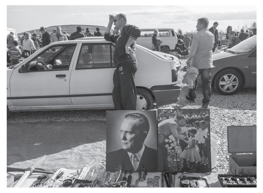
Figure 5.3. Selling Tito at Hrelić flea market in Zagreb.

to pick our way through the neat lines of piled goods on the ground. Our search for Tito had limited success. The traces of him at Hrelić were few and far between. We commented how odd it was that he was gone. 'The thing sells better at Britanac', a vendor explained, commenting that he kept Tito busts and other valuable items at home, in his garage, because they were too pricy for Hrelić. He only took them to the market if they had been ordered in advance. However, from time to time, Tito and the ideological industry that had made him ever-present surfaced in different ways. At the very end of our Hrelić tour we found Tito at his very best. 'I see you are interested...' was the vendor's cheerful response as he turned to us. 'He [Tito] knew how to deal with kids. He was a leader!' He seemed to have to explain this in order to sell the picture. But there was no mystique surrounding Tito's name at Hrelić. One sells things, Tito objects included, because someone wants to buy them. There were no witty comments about Tito and no special sentimentality around him - as we had heard on other occasions. There was just a glimpse of happiness - that faded the moment we declined an offer to 'buy Tito' for 50 kunas.