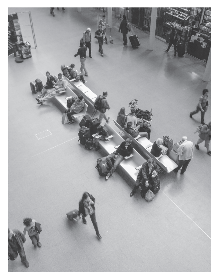
Figure 6.2. To be surrounded by your own luggage can create a private comfort zone while waiting for the train. People arrange and rearrange, open and close their bags and suitcases – a constant interaction. Photo: Orvar Löfgren, St Pancras Station, London, 2009.

As I have shown there are strong emotional attachments between travellers and their suitcases. The case may be charged with nostalgic memories and moods of belonging, it may be surrounded by an aura of