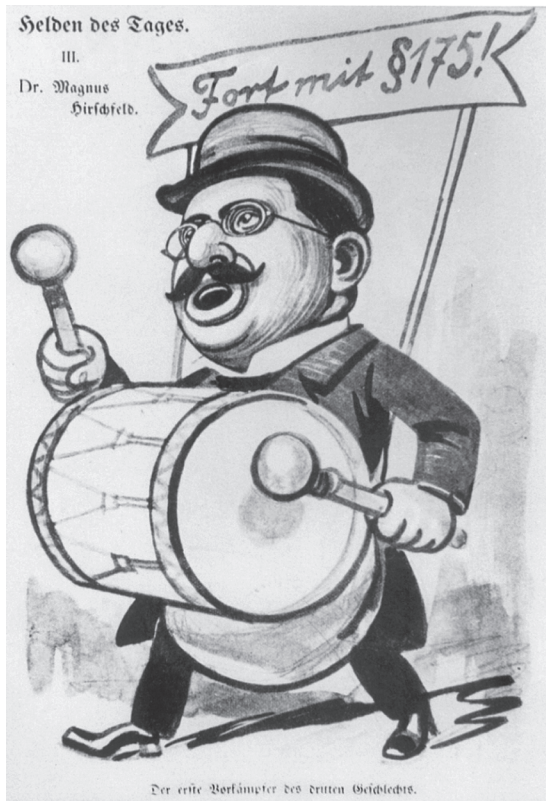
Figure 1.1 A 1907 political cartoon depicting sex-researcher Magnus Hirschfeld, "Hero of the Day," drumming up support for the abolition of Paragraph 175 of the German Penal Code, which criminalized homosexuality. The banner reads, "Away with Paragraph 175!" The caption reads, "The foremost champion of the third sex!"

While Hirschfeld did not address directly the antisemitism, he noted that the attacks against him in the wake of the Harden trial, a scandal that had started out as a response to the perceived weakening of Germany's colonial might, "brought the laborious achievements [of the fledgling homosexual rights movement] once more into question." 89 Hirschfeld noticed the rise of what Eve Kosofsky Sedgwick would later call "homosexual panic," a term she borrowed from the psychiatrist Edward Kempf, which describes "the most private, psychologized form in which many twentieth-century western men experience their vulnerability to the social pressure of homophobic blackmail." 90 According to Hirschfeld "it was after the Moltke-Harden scandal