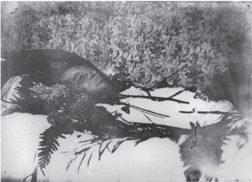
Figure 2.2 Photograph of Oscar Wilde taken the day after his death.