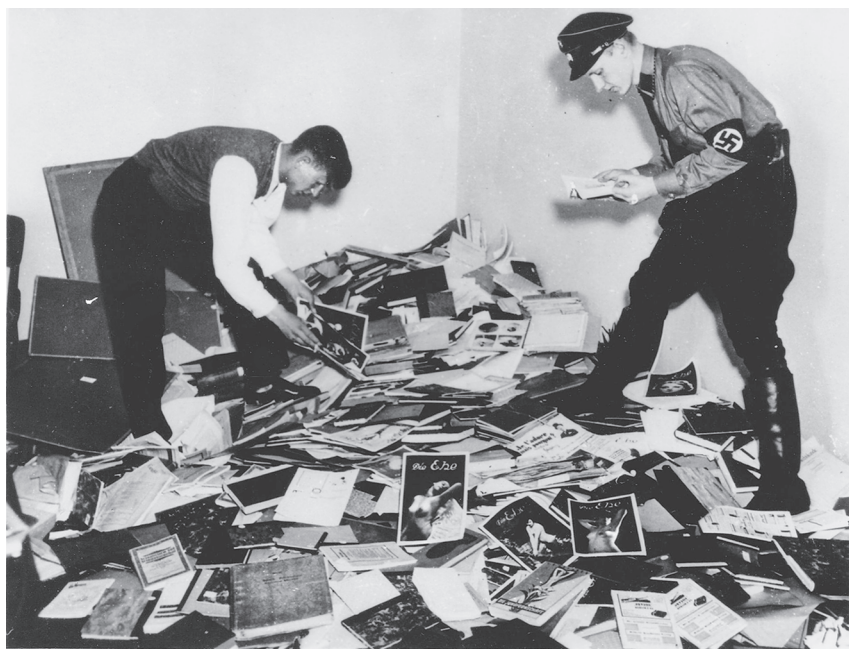
Figure 4.2 Members of the Hitler Youth select material for the book burning, 1933.

at pictures, while the soldier is reading a page in a book. Closer inspection suggests that the photograph was staged in a way that sought to dissociate the Nazi men from the content of the materials in which they are so immersed. The picture is well lit and carefully composed. Strategically placed at the front of the mountain of books and papers are a number of photographs of topless women, apparently taken from the journal Die Ehe , the institute's publication on marriage. The conspicuous inclusion of these images heterosexualizes the materials handled by the Nazi men. Nazi propaganda and policy tended to decry and persecute both pornography and homosexuality. 108 However, here the prominent placing of photographs of topless women suggests that homophobic anxieties shaped the raid on the Institute of Sexual Science. The representation of Nazi hands on naked women manages to maintain the institute's association with sexual immorality even as these images also ensure that the Nazi men sent to cleanse the institute of its holdings are dissociated from homosexuality. Sharon Patricia Holland has argued that "if touch can be interpreted as the action that bars one from entry and also connects one to the sensual life of the other, then . . . racism has its own erotic life." 109 Holland's observation on "the erotic life of racism," by which