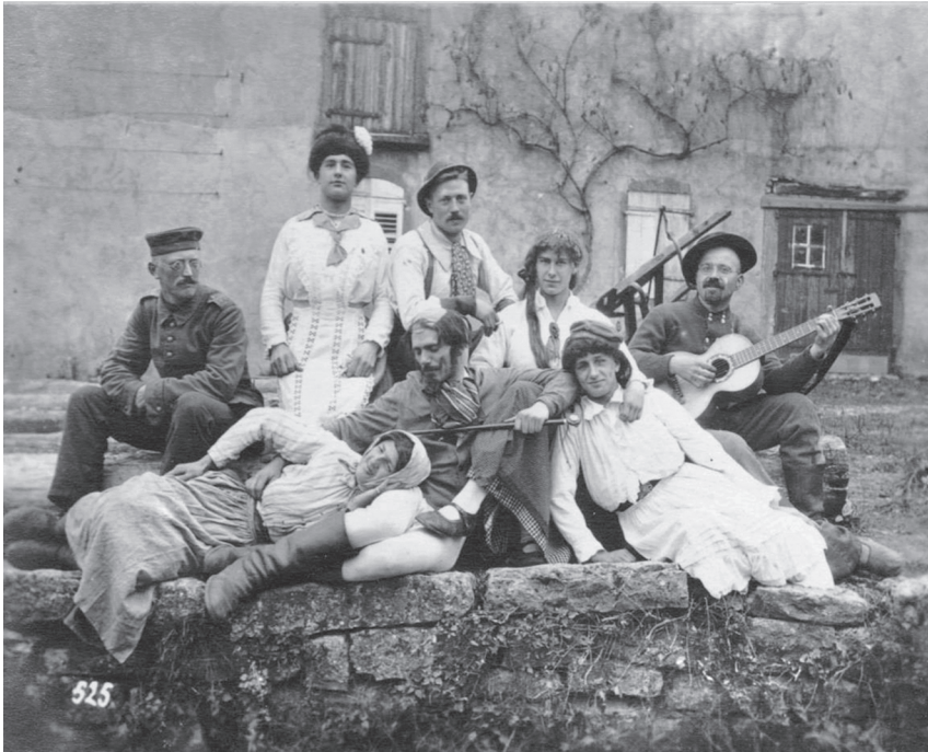
Figure 1.2 World War I card depicting German soldiers.