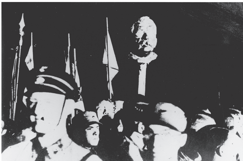
Figure 4.3 The bust of Magnus Hirschfeld, taken from the Institute of Sexual Science, is carried through the streets of Berlin.

and tie gathering piles of books from the ground and hurling them toward the flames. The voiceover explains that German students had “ ingesammelt ” (collected) the books for burning. The camera then moves to Hitler’s propaganda minister, Joseph Goebbels, who addresses the masses, trying to impress on them what he calls the “strong, great and symbolic undertaking” of “entrust[ing] to the flames the intellectual garbage of the past.” 121 According to the historians George Mosse and James Jones, “The tossing of the bust of Hirschfeld into the flames is the sole instance where an image was burnt with the books.” 122 It is not clear, however, whether the bust actually reached the flames—some historians have argued that it would simply have been too heavy to be tossed into the fire. It is likely not only that the bust was present on that night but that it somehow withstood the Nazi attack.