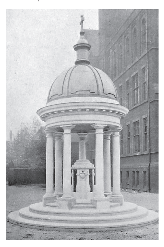
7 St Paul's School memorial, London.

the military prowess of Edward I's England through the construction of an Eleanor Cross.<sup>67</sup>