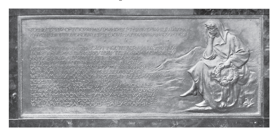
9 War Correspondents' memorial, St Paul's Cathedral.