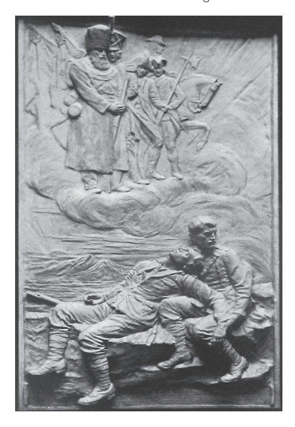
4 Coldstream Guards' memorial, St Paul's Cathedral.

Themes of tradition and continuity frequently underpinned the iconographical symbolism of regimental memorials. For the Coldstream Guards the weight of regimental history was the leitmotif of its memorial tablet. Designed by the celebrated sculptor, William Goscombe John, the engraved tablet imparts a message of tradition, heroism and sacrifice. The foreground of the panel consists of two soldiers on the veldt; one wounded, the other in the act of providing solace. In the middle distance are the famous kopjes of South Africa, while the sky contains the ethereal presence of former Coldstreamers including General Monck, who raised the original force, figures from the Peninsula War, Waterloo and the Crimean campaign. This host, looking down approvingly on their modern counterparts, signals that the honourable traditions of the regiment have been maintained.<sup>72</sup> John employed a similar symbolic artifice for the memorial to the King's Liverpool regiment in St John's Gardens, Liverpool. Flanking the central statue of Britannia are two soldiers standing at ease: one in the uniform of 1685, the year of the regiment's enrolment,