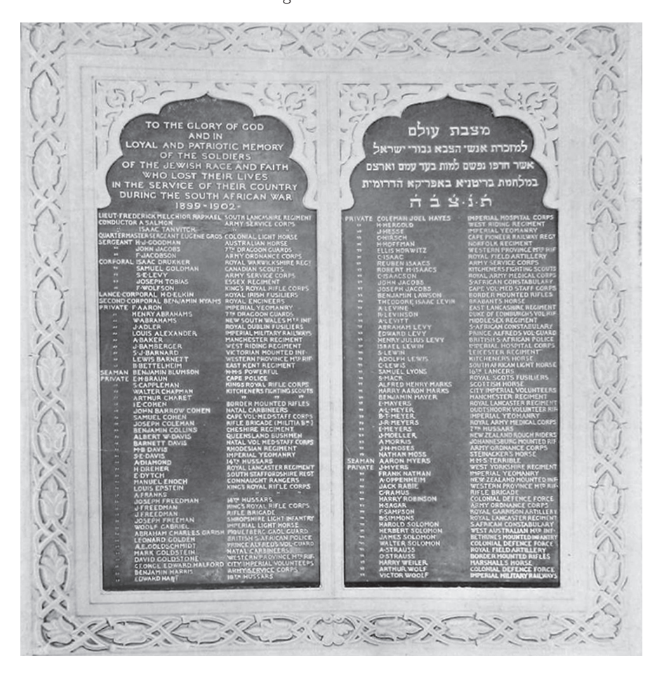
10 Jewish memorial, Central Synagogue, Great Portland Street, London.

were to be caught in precisely the same bind after the Great War when the same arguments were rehearsed in an almost identical fashion.<sup>85</sup>