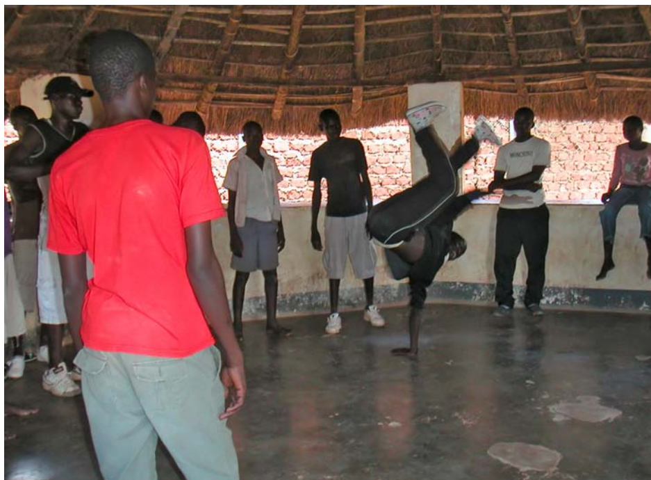
Illustration 2: Breakdance Performance at Gulu Youth Centre

and hip hop events like the one described above, and seem to switch between ‘traditionalist’ and ‘modernist’ “cultural styles” (Ferguson, 1999, see discussion below). On the one hand, the ability to combine the membership in different cultural scenes is heavily dependent on the individual traits of a young person (regarding especially gender, class and social upbringing). On the other hand, the different, at times overlapping cultural scenes in Gulu and the various cultural elements and practices they reflect can only be understood against the backdrop of the particular time and place of their setting, and the generational characteristics of their main protagonists. In order to give the reader a more complete picture, I will briefly portray the generation of urban youth, which I focus on in this chapter, and point out similarities and differences among its members.