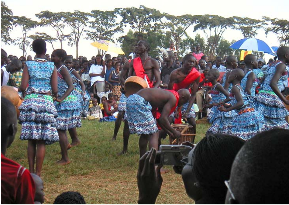
Illustration 1: Radio Rupiny Traditional Dance Competition at Kaunda Grounds, Gulu

offered in big dance competitions, for instance by Senator (a beer-brewing company) or Radio Rupiny (a local radio station). According to my interlocutors, the winner of these competitions could earn between one and six million Ugandan Shilling, i.e. up to 2,000 Euro (personal conversations cf. field notes 26.06.2010; 17.12.2010; 03.01.2011). I sometimes had the impression that the prospect of winning so much money paralleled or even superseded the primary motivation of the cultural groups of being cultural ambassadors. It was also a reason for the fierce competition between different cultural groups (cf. field notes 22.05.2010; 30.05.2010; 26.06.2010; 28.11.2010; 17.12.2010; 03.01.2010). The following is an extract from my field notes, which deals with this issue: