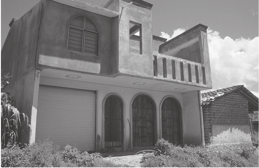
FIGURE 2.1. A migrant's house next to the old house.

village level. This “transnationalism from below” contrasts with the transnational capitalist system precisely in that it is a process in which individuals bring about cultural change in others. I prefer to see these as cultural, rather than social, remittances. One such cultural remittance is Evangelical Protestantism. It is transmitted by individual converts to other individuals, who decide whether or not to accept it. The “systems of practice” of non-Catholics in Mixtec communities are the church services and other activities engaged in by converts, through which they communicate the messages of Evangelicalism. Conversion is rarely the product of missionary activities in the Mixteca. Rather, it is individuals who take the message to their villages. With a few exceptions, the church organizations to which converts belong were established by Mexican migrants to the United States.