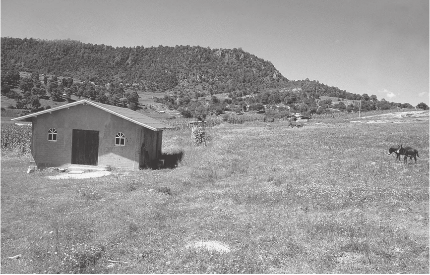
FIGURE 3.2. Iglesia de Jesucristo de las Américas, San Pedro Yososcuá.

It seems clear that there is conflict between the Catholics and the non-Catholics in Yososcuá. However, 2004 was not the same as 1978, when the first Evangelicals returned to the Mixteca only to be expelled from their communities. In 2004 it was unlikely that the Catholics would expel the non-Catholics; at that time, both groups knew that there is a law of religious freedom in Mexico, while in 1978, most did not. The members of the village will have to come to some kind of an agreement at some point.