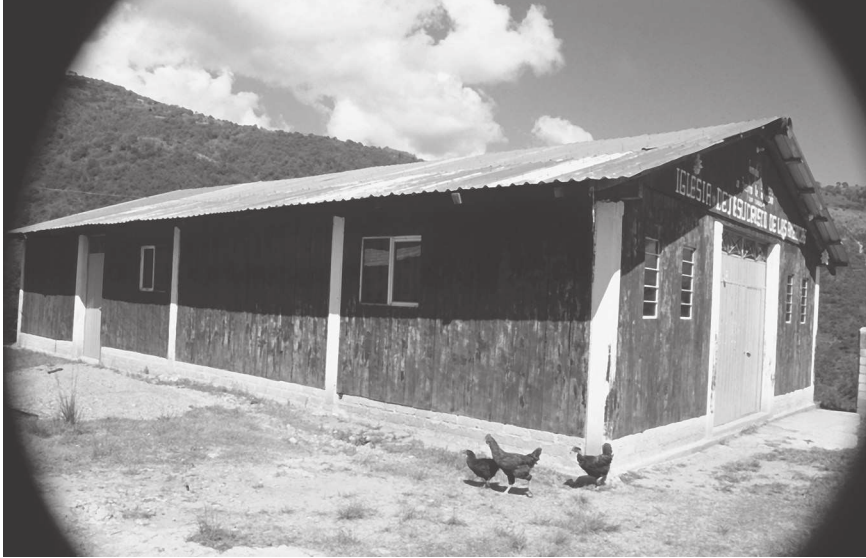
FIGURE 3.1. Iglesia de Jesucristo de las Américas, San Lucas.