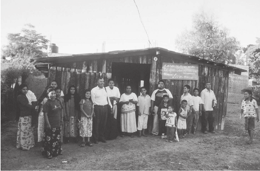
FIGURE 7.2. The Sinaloa congregation of the Iglesia de Jesucristo de las Américas, in front of the church.

Mixtecs in Sinaloa have settled there. While they no longer migrate for work, they continue to participate as nodes in the transnational networks of their communities.