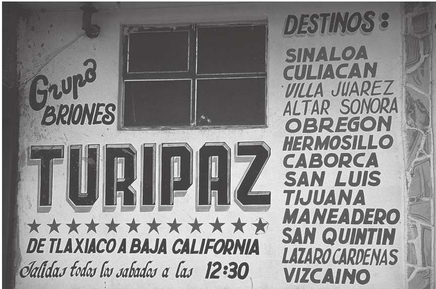
FIGURE 2.2. Buses leave Tlaxiaco every Saturday bound for agricultural communities—migrant destinations—in northern Mexico.

freedom. They are content to participate in the secular communal activities as long as they are not required to support the Catholic fiestas. While some Catholics complain that the non-Catholics do not contribute their fair share, they actually do. Non-Catholics participate in the non-Catholic aspects of usos y costumbres , taking on the nonreligious cargos and contributing tequio . Non-Catholic migrants also send economic remittances for projects planned and carried out by the entire village. I know one non-Catholic minister who lives in California and has only been to his village once since he was an infant. He continues to send money for the upkeep of the public buildings and other community development works in the village. Like the Catholics, the non-Catholics accept, change, and repurpose symbols of modernity like the cell phone. In both cases, the cell phones are used to maintain the traditional community as well as to participate in modern activities such as coordinating the installation of potable water systems in the villages. Whether Catholics or non-Catholics, the villagers are all Mixtec.