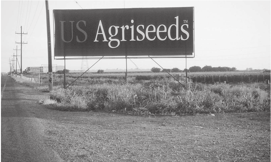
FIGURE 7.1. Advertisement in Sinaloa for seeds for growing products that are exportable to the US.

The World Bank, along with US banks, provided credit to the growers of these crops, and the Mixtecs provided the labor (Astorga Lira and Commander 1989:777; Mares 1991:266–68). Table 7.1 documents the increase in indigenous people in Sinaloa from 1980 to 2000. Interviews with representatives of the government agency Jornaleros Agrícolas in Culiacán established that the vast majority of these were Mixtecs. 2 They migrated to the fields during the production season, and returned to their villages for the rest of the year. This situation was more than satisfactory for the growers, who “are attracted by a low-wage, non-organized labour force, whose reproduction costs are borne to a large extent by the migrants themselves” (Astorga Lira and Commander 1989:777).