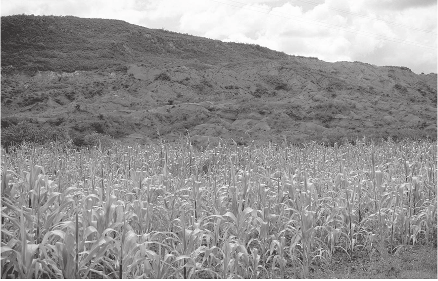
FIGURE 1.2. Eroded hills next to a cornfield.

the area are mostly very poor: Oaxaca, the state where most Mixtecs live, is among the poorest in Mexico, and the Mixteca region is one of the poorest in Oaxaca. It is not a tourist destination, generally speaking.