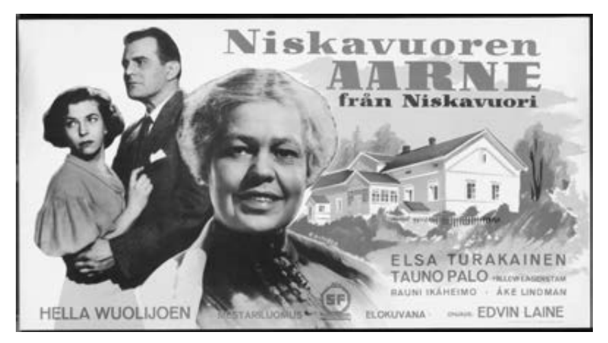
Fig. 8. The Niskavuori estate takes a central position in the poster for Aarne Niskavuori 1954 (FFA).

where Loviisa is set."<sup>164</sup> In publicity-stills, the characters and the stars, of course, were equipped with objects of peasant culture. In Loviisa , Loviisa, Juhani, Kustaava, Malviina, and Martti were portrayed with a pail as the sign of the narrative world. Even the poster of the film featured Juhani with a pail. Publicity-stills framing Heta Niskavuori displayed nets and other fishing equipment, and in a studio portrait of Heta, placing a handle of a hoe in her lap created the peasant-effect. [Fig. 9]