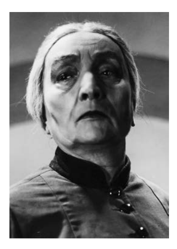
Fig. 12. The matron as a melodramatic monument with "the burn marks left by tears and stifled sighs" in The Women of Niskavuori 1938 (FFA).

cutting hay. A close-up of Loviisa re-emerges, this time a low-angle frame, accompanied, first, by the Bible quote and water rushing in torrents and, second, by a haymaking scene. The landscape scenery fades away and a cut re-introduces the heap of stones, as if on a hill, lit from behind. As the shot with the Bible quote fades away, a superimposition identifies Loviisa with the heap of stones. In the final frame, the heap of stones is framed intact. In this manner, the final montage sequence performed yet another "hardening" of Loviisa from a downward gaze to a monumental framing and identification with the stones. This ending suggested the same duality of hardness (stone-likeness) and softness, the sense of duty and "suffocated sighs" highlighted in the public reception of the film. In addition, a publicity-still widely circulated in promotional publicity and review journalism framed Loviisa in a medium close-up, in low-key lighting, gazing downwards – appearing not as a "solemn" character enjoying her "victory", but more like a sad, disheartened old woman.<sup>52</sup>