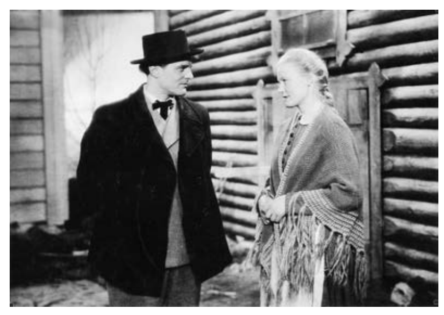
Fig. 15. Not yet a matron, demure, and full of expectation. Loviisa 1946 (FFA).

to which monumentality and matronhood as a gender position resulted from necessity, out of an "unavoidable" encounter with "the realities of life":