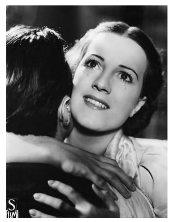
Fig. 60. In the 1930s, Finnish film critics employed Balázsian ideas of film, emphasizing the facial close-up as the locus of the cinematic. Even those critical of Wuolijoki admired Sirkka Sari's "soulful" eyes in The Women of Niskavuori 1938 (FFA).

welcomed the censorship's moral condemnation of Ilona's character, then published promotion articles applauding the beauty of Sirkka Sari and using the star-effect to motivate and legitimate the controversial intrigue: