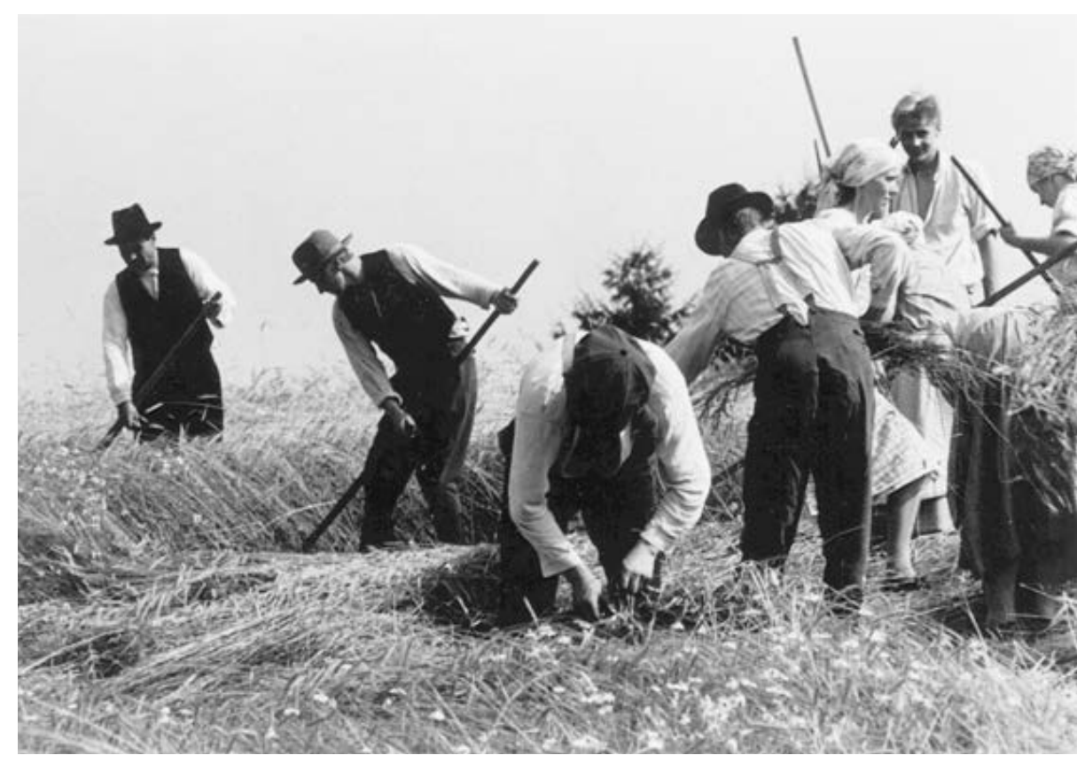
Fig. 3. Simulating old Finnish cinema in Niskavuori 1984.

and called forth the famous scene in Loviisa where Juhani (Tauno Palo) and Malviina (Kirsti Hurme) encounter each other walking across a rye field. The opening sequence of Niskavuori functioned, then, like a thematic and stylistic prologue suggesting a citational reading. After the prologue, a tableau-like scene, the narrative continued with Loviisa's name-day party, a scene familiar from many other Niskavuori films: the two versions of The Women of Niskavuori (1938, 1958), Aarne Niskavuori (1954), and Niskavuori Fights (1957).<sup>82</sup> [Fig. 4]