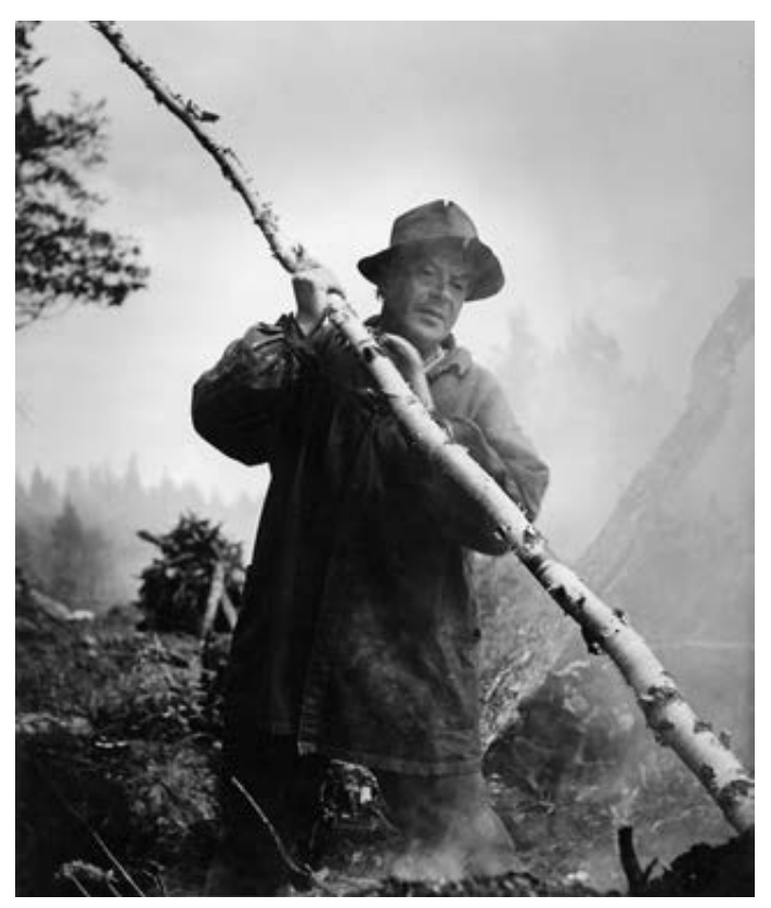
Fig. 37. Akusti as the exemplary Finnish peasant in Heta Niskavuori 1952 (FFA).