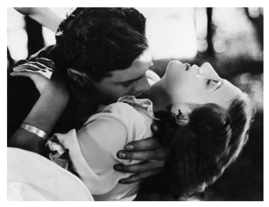
Fig. 56. This publicity-still, quoted even in advertisements for The Women of Niskavuori 1938 (FFA), echoed a rhetoric of passion familiar from, for instance, many Greta Garbo films.

scene.<sup>143</sup> [Fig. 59] In the advertising, the foregrounding of romance linked The Women of Niskavuori to a whole range of 1930s romantic comedies and melodramas. Within the context of cinema culture, as opposed to that of theatre, the image of Ilona was not only discussed in terms of moral principles or symbolic-political resonances, but also "consumed" in relation to the lures and promises of stardom and its connections to heterosexual romance. As Raymond Bellour (2000, 14) argues, the image of the heterosexual couple is "absolutely central" to what he terms "the fiction of a cinema". According to Bellour, cinema is "powerfully obsessed by the ideology of the family and of marriage, which constitutes its imaginary and symbolic base". (Cf. Haralovich 1982, esp. 54.)