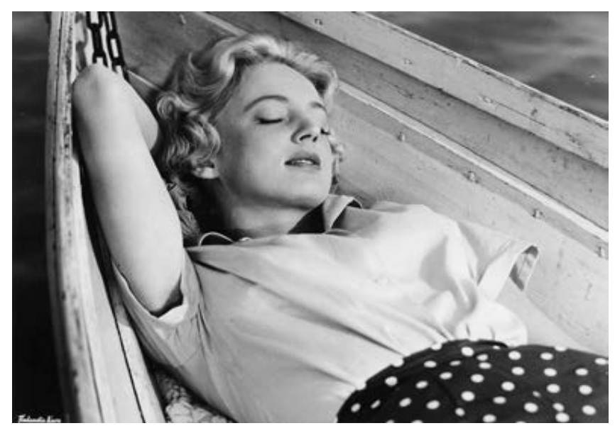
Fig. 61. The Women of Niskavuori 1958 ( FFA ) reiterated the visual rhetoric of the 1938 version, portraying the female star both as desirable and desiring.

Niskavuori was introduced not only within frameworks of ideological battles and social problems, but also those of the intertwined discourses on sexuality and cinema. [Fig. 56, 61–62.]