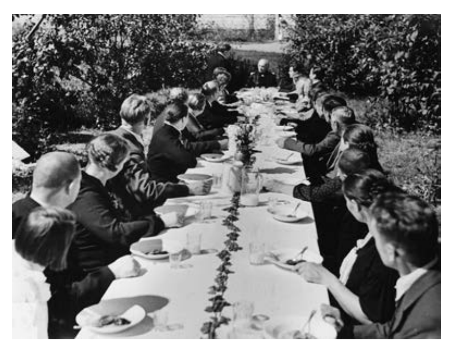
Fig. 11. Monumentalizing the matron in The Women of Niskavuori 1938.

and we will remain pillars in our own manner." The notion of monumentality has been, ever since, an especially persistent reading in the context of theatre.<sup>17</sup> In this section, I look at the 1930s interpretive framings to examine how the character of the old matron was seen as monumental (what was monumental about her?) and in what sense (what was she a monument to?).