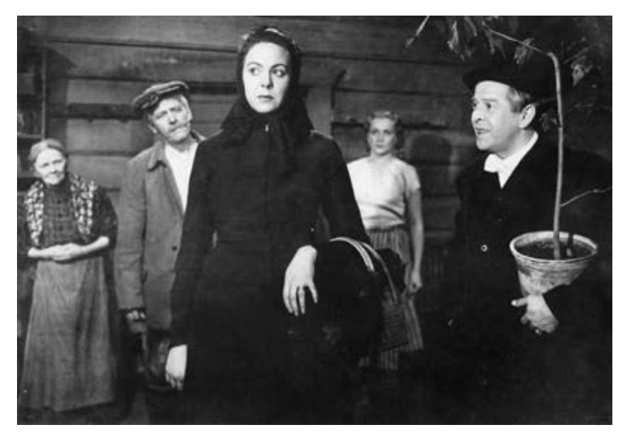
Fig. 36. Akusti as Heta's lackey in Heta Niskavuori 1952 (FFA).