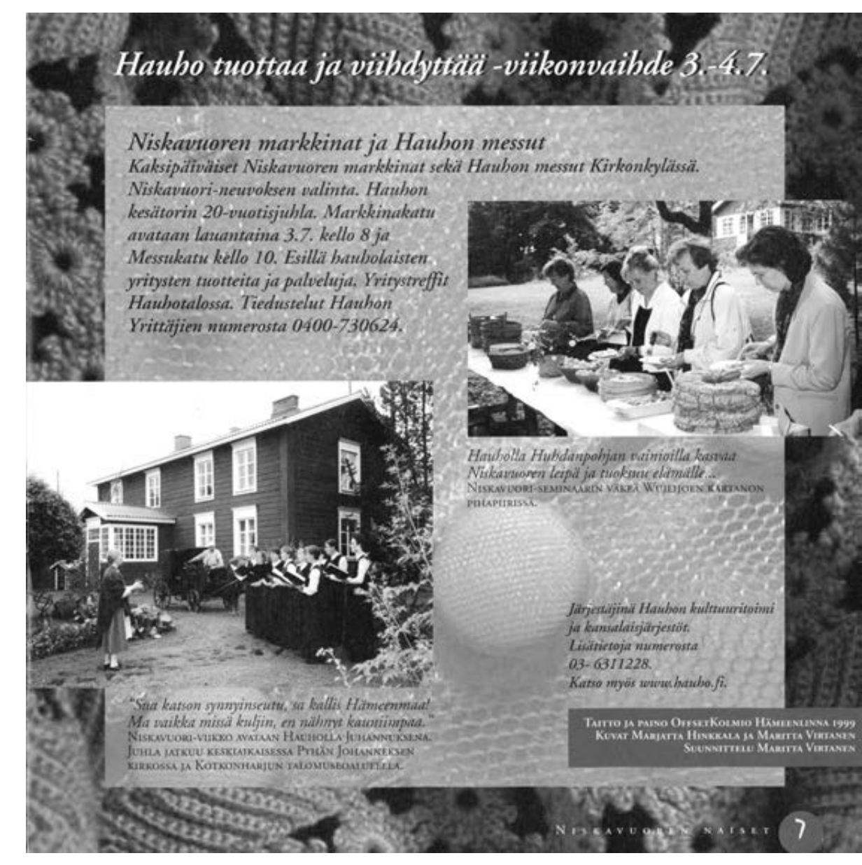
Fig. 10. Come visit the virtual Niskavuori! Heritage tourism in Hauho.

Hauho. Not only Niskavuori plays, but also Hulda Juurakko (1937) and Herr Puntila und sein Knecht Matti (co-authored with Bertolt Brecht) have been linked to the Hauho landscape. While the Vuolijoki mansion has not been available for tourist purposes, the courtyard of the near Miekka farm, ten kilometres away, has been staged as an "authentic" milieu for the summer theatre performances.<sup>182</sup> The newspaper article reported that, the different forms of tourist business and the fictitious world coincided successfully: