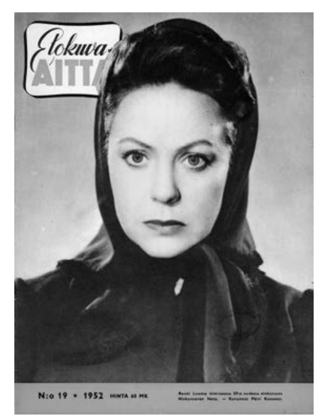
Fig. 22. The cover of Elokuva-aitta (19/1952) represented Heta as a dauntless peasant woman without a smile on her face.

material and the earthly", and thus, completely lacking "the wise ability to adjust herself, which is what makes the old female characters of Tervapää so pleasant and so grand".<sup>219</sup> In this manner, then, Heta was framed as the negative of Loviisa, as her definitional other (cf. Sedgwick 1992, 241).