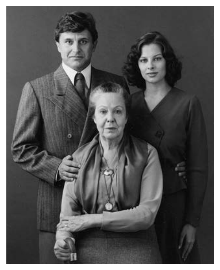
Fig 2. The aesthetic of family album in Niskavuori 1984 (FFA).