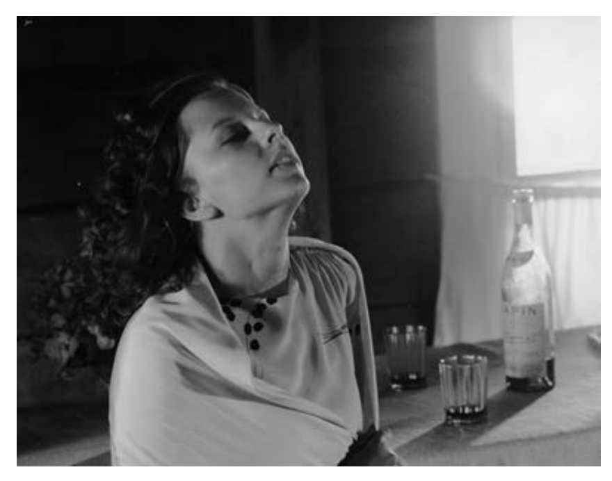
Fig. 62. Sexuality is a key site for historical imagination in heritage films such as Niskavuori 1984 (FFA).

Passion without politics? Readings of Niskavuori as soap opera