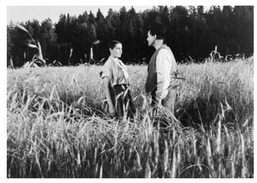
Fig. 42. For 1980s and 1990s critics, this scene in Loviisa 1946 (FFA) epitomized sexual politics as a nature-like force.

"Life on the Niskavuori family estate is represented beautifully. The wind blows; summer clouds roll in the Häme sky and in the burning sunshine, even the passions of the patron Juhani (Tauno Palo) and the voluptuous maid Malviina (Kirsti Hurme) burn."<sup>40</sup>