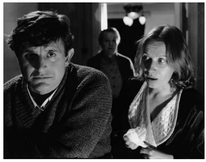
Fig. 38. Publicity-stills positioned Aarne as the protagonist of Niskavuori (1984).

"The central theme of the film is change, Aarne moving away from and returning to the countryside. Aarne is a poor man who is under the thumb [talutusnuorassa kulkeva] of his mother and other strong women. This film investigates what happens to Aarne in town where he cannot see the sunrise the way he could back home at Niskavuori. We explore how it helps him to move back to Niskavuori."<sup>153</sup>