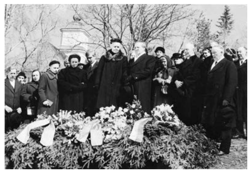
Fig. 6. The soldiers' funeral scene evoked both powerful memories and a sense of history in Niskavuori Fights 1957 (FFA).

framed both as a communist and a people's democrat, both a conscientious objector and a deserter [käpykaartilainen], or else disavowed as a mysterious figure, leaving the character unmentioned and the history he implicated uninterpreted.<sup>113</sup> In 1957, review journalism reiterated these readings and the conjoining articulations of history. Some framings called attention to a "political tinge", which interfered with "the atmosphere" and promoted a history of the war efforts that excluded the "deserters" and their motifs. Some readings in left-wing newspapers as well as others stated that "political dilution" had taken place, leaving history either unclear ("insinuating but not clarifying") or defective.<sup>114</sup> Some framings rejected what in 1953 had been called "the political bug" as they sought to marginalize a reading of Niskavuori Fights as a representation of political history. Others called for "clearer" interpretations and more "substance" attempting to highlight the missing or suggested political history as the key framework for the narrative. These different framings, nevertheless, both located the point of contest in the political history Juhani Mattila's character and the newsreel aesthetic suggested.115