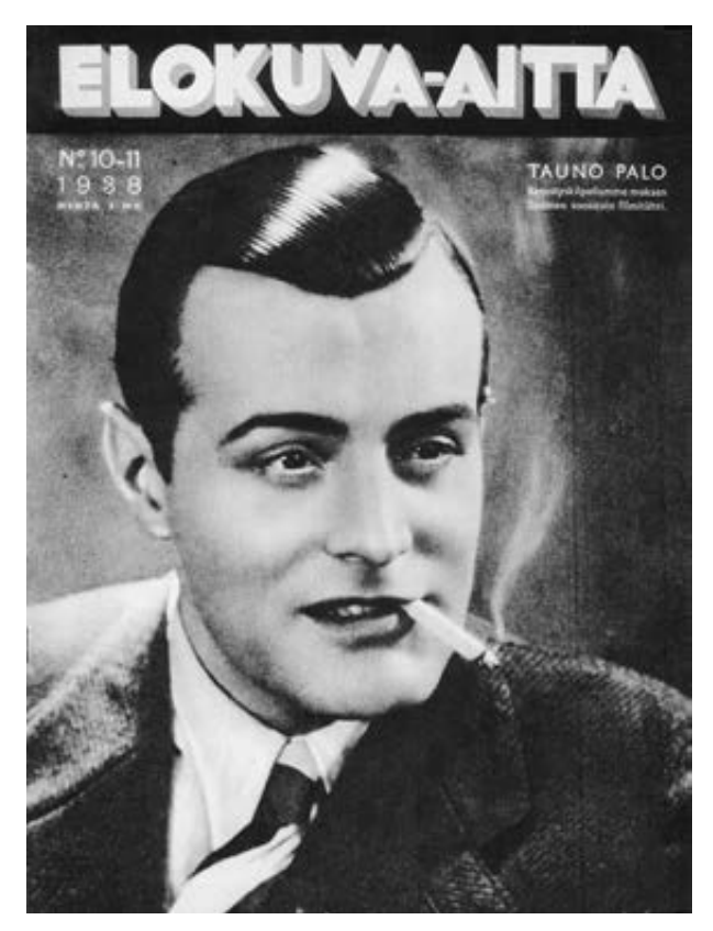
Fig. 31. On the cover of Elokuva-aitta (10–11/1938), Tauno Palo appeared as a romantic hero, his appearance resembling Clark Gable, a popular on-screen lover even in Finland.

"He has a slim body, shiny dark hair, and those dark moist eyes of a deer. The gaze is first slightly timid and wondering, but if the milieu does not seem dangerous, they soon will smile trustingly. Tauno Palo would certainly have the potential to become a very romantic hero if he had more of a gallant personality. Now he seems very polite and kind."<sup>105</sup>