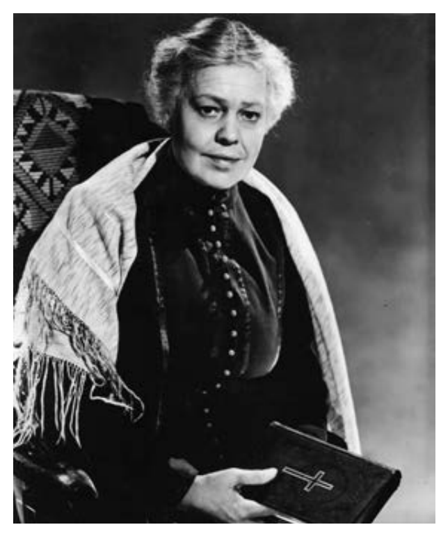
Fig. 24. The visual attributes of the old matron include a rocking chair, a knitted shawl, and a stick, as portrayed in a publicity-still for Aarne Niskavuori 1954.

flaunting the notion of a never-ending story. In addition, her command of her children, emphasized in earlier framings, expanded to gain nothing less than an international and global dimension: