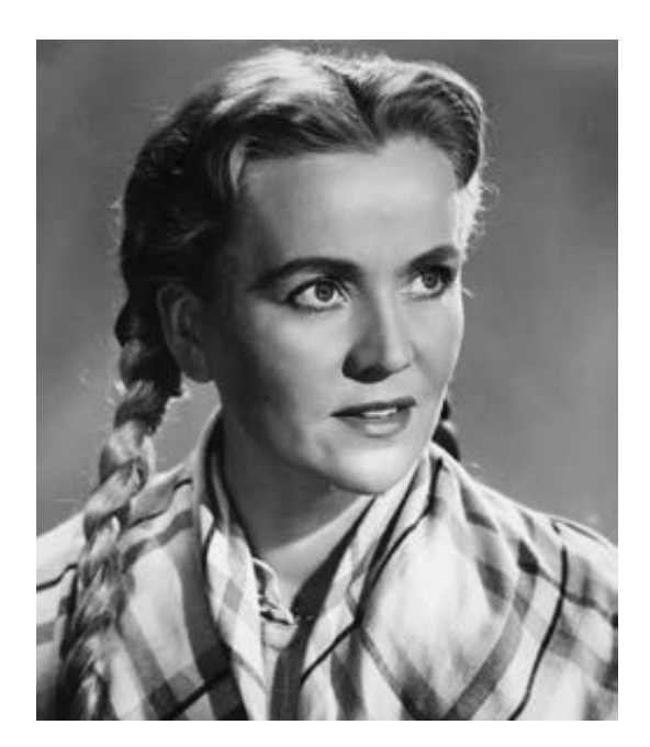
Fig. 47. An image of victimized femininity, Siipirikko was portrayed as an idealized character in Heta Niskavuori 1952 (FFA).

licity photo in which Akusti carries Siipirikko in his arms connotes illness and weakness more than anything else. In these framings, then, Siipirikko not only functioned as a negative of Heta, but also as a projection of Akusti's goodness, serving as a visible sign of his choice and good nature.