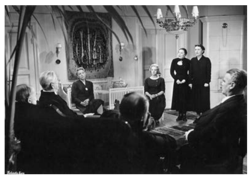
Fig. 59. With publicity-stills referring to the climactic trial scene, the visual framings of The Women of Niskavuori underlined a discourse of repression even in 1958.

between the role and the actor in the case of Aarne, Ilona was idealized in spite of the values with which she was identified: