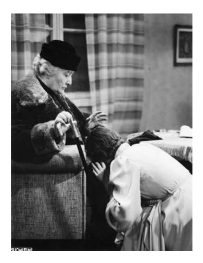
Fig. 13. Underlining the tension between interior feelings and exterior signs in The Women of Niskavuori 1938 (FFA).