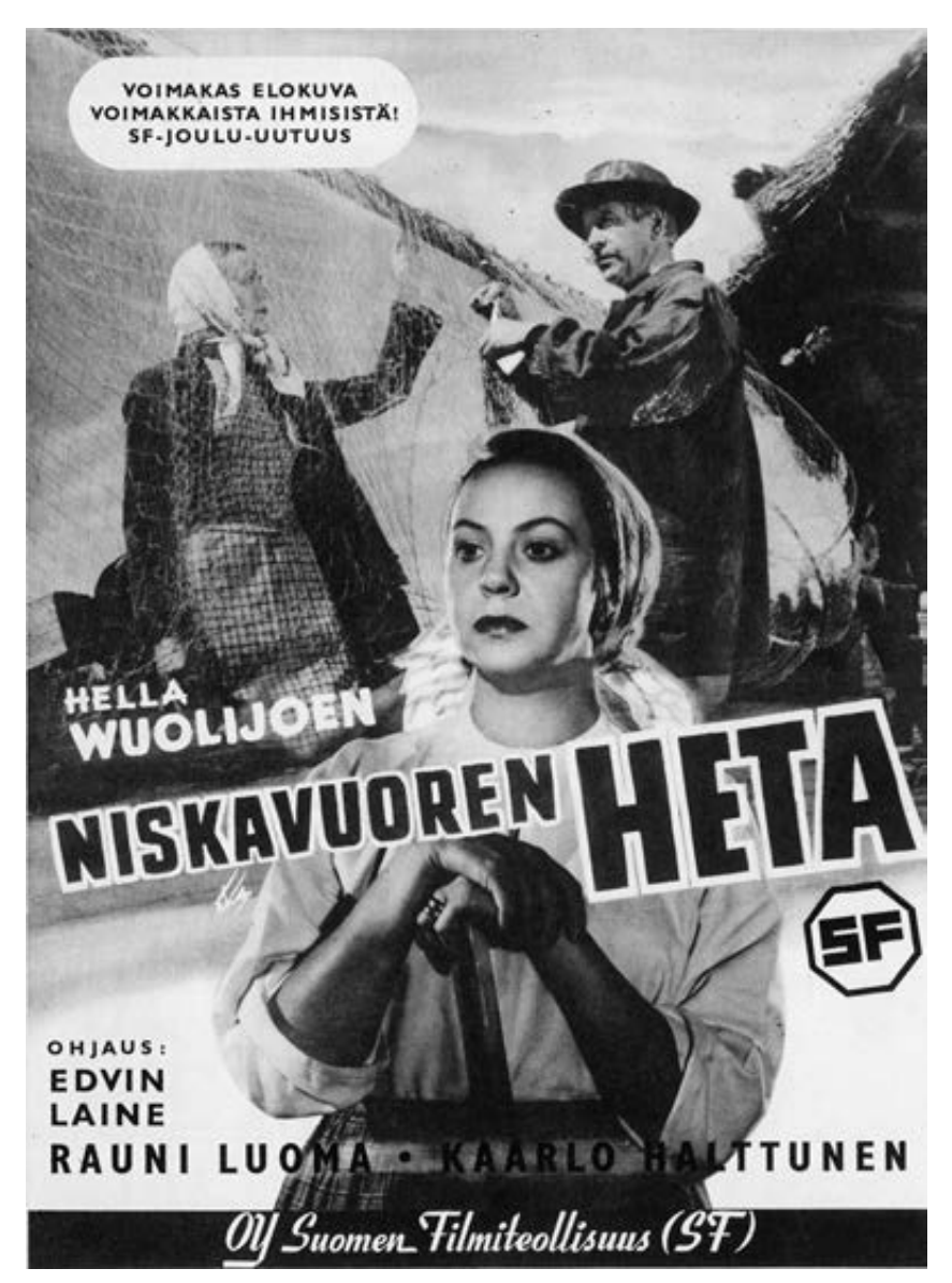
Fig. 9. Advertisement for Heta Niskavuori (EA 24/1952) with a peasant-effect.