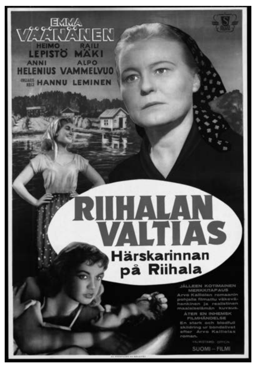
Fig. 20. Pathologizing matronhood in The Ruler of Riihala 1956 (FFA).

A Suomi-Filmi brochure marketed The Ruler of Riihala to an English-speaking audience as The Farmer's Wife :