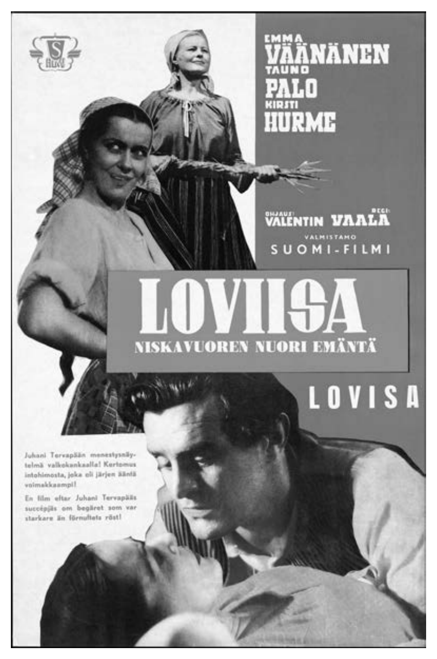
Fig. 44. The poster framed Loviisa 1946 (FFA) as a love triangle, emphasizing conflicts and illegitimate passions.