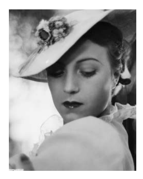
Fig. 57. A Finnish film star? Sirkka Sari as the new "cinematic face" in The Women of Niskavuori 1938.

Interestingly, the judgmental discourse of censorship hardly seemed to affect the cinematic institution of stardom. Instead, censorship highlighted the reading route outlined in promotional publicity because all reviewers, both in right- and left-wing press, praised the beauty of Sirkka Sari, the "new cinematic face". In the first coverage of the film in Elokuva-aitta , for instance, there was a full-page photograph of Sirkka Sari's "beautiful and expressive face". Her face played a central role in the entire promotional advertising campaign. Indeed, the production company Suomi-Filmi built the advertising of the film around "the newly found film star" and, in doing so, satisfied to some extent the much debated need of an indigenous "Finnish film star".<sup>152</sup>