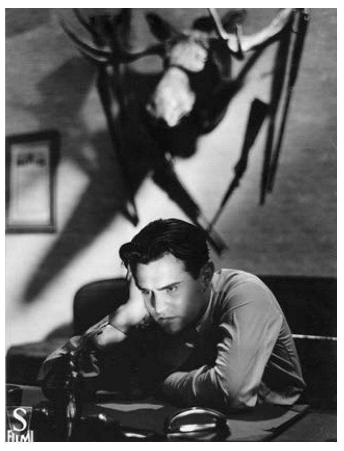
Fig. 27. Aarne as the man-in-crisis in The Women of Niskavuori 1938 (FFA).

The right-wing newspaper Ajan Suunta described Aarne through analogy to the "obscure and meaningless" male character in F. E. Sillanpää's "lousy piece of work", the novel Miehen tie (The Man's Path 1932). According to the reviewer, Aarne Niskavuori and Paavo Ahrola were "similar good-for-no-things".<sup>59</sup> This intertextual framework indicates a reading of The Women of Niskavuori in terms of the "vitalistic" discourses on gender and sexuality.<sup>60</sup> In Lasse Koskela's (1988, 150) reading of Sillanpää, "a man does not control his own path" and "the man does not understand it".<sup>61</sup> Instead, his own unconscious mental images and women are the two forces which determine his path. The title of the novel, which refers to the Old Testament, indeed offers manliness as a question of self and identity: Who or what determines "the