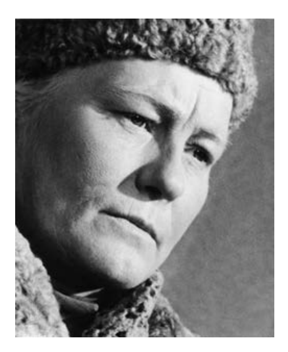
Fig. 19. The matron as a matriarchal monster in The Women of Niskavuori 1958 (FFA).

magazines – as the main reason for the "effeminization" of men.<sup>184</sup> In 1936, Eeva , the "magazine for the modern woman" launched that year, discussed the question of working mothers under a rubric that underlined the instability of gender: "Society becomes more feminine, women become more masculine".<sup>185</sup> In the inter-war era, the "masculinization of women" was perceived as a major threat to the institution of marriage (Ahlman 1934, 306; Hapuli 1995, 160–167). The legacy of the monument-woman as a masculine woman accentuates the ambivalence of the figuration. While the figure of the Niskavuori matron was, in the 1930s, often read as an embodiment of stability and tradition, it associated with a legacy that, instead, connoted instability and subversion in terms of gender discourse. Both before and after the Second World War, the qualities Mikko Lehtonen (1995) identifies as "masculine" in the matron served as the raison d'être for her significance and power. Simultaneously, the very same qualities propelled discussions of the matron as a "smother". [Fig. 19]