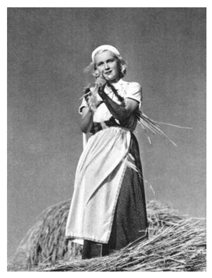
Fig. 18. Post-war Niskavuori films echoed the contemporary imagery of books representing Finland through photographs such as Suomi kuvina – Finland i ord och bild (Finland in Pictures).

and Eino Mäkinen's Isien työ ( The Work of Fathers , 1953), providing the image of Loviisa with yet another intertextual framework.