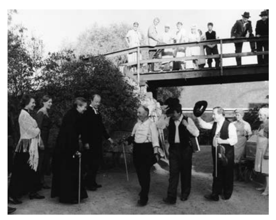
Fig. 4. The heritage aesthetic in Niskavuori 1984 (FFA).

to the past", "boundless tradition-optimism" and "yearning for tradition".85 Furthermore, its release coincided with two other family sagas The Clan-the Tale of the Frogs (1984) and Dirty Story (1984), both set in the recent past.<sup>86</sup> In some readings, Niskavuori was seen as symptomatic of an "artistic crisis" in Finnish cinema; it was interpreted as vying for an established position as national culture by supporting literary, not cinematic, values.<sup>87</sup> This reading has been reiterated, for example, in a 1995 textbook (Honka-Hallila, Laine & Pantti 1995, 204) where "lack of renewal" and "gazing backwards" were named as the leading characteristics of the 1980s domestic film. A cycle of biopics (Runoilija ja muusa/ The Poet and the Muse 1978, Tulipää/ Flame-Top 1980, Da Capo 1985), literary adaptations such as Suuri illusioni (A Grand Illusion 1985) and historical films such as Vartioitu kylä 1944 (The Guarded Village 1944 1979), Pedon merkki (The Sign of the Beast 1980), Angelas krig (Angela's War 1984) and Tuntematon Sotilas (The Unknown Soldier 1985) were lumped into one category and called the "backwardlooking" "nostalgic front" (ibid., 204–208).