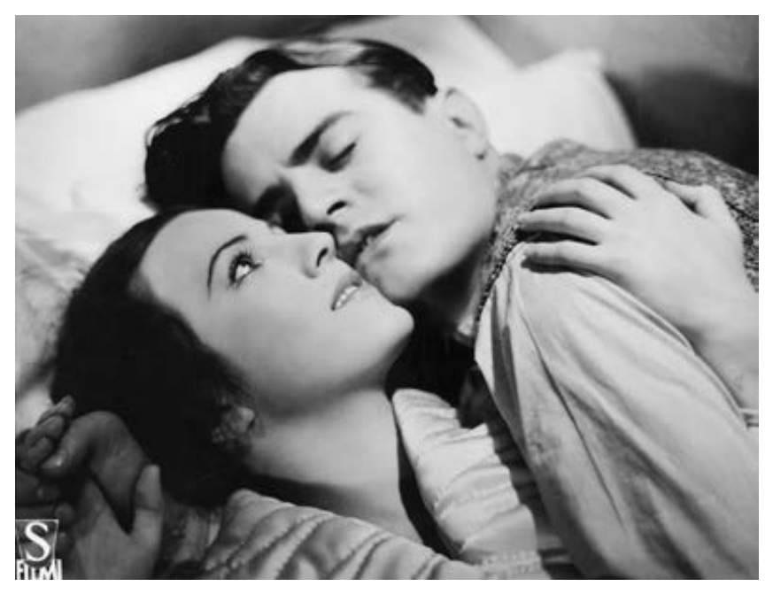
Fig. 54. The censored close-up from The Women of Niskavuori 1938 (FFA).

advocating moral relativism and objecting to censorship as a moralistic practice pursuing political agendas, <sup>114</sup> most commentators accepted censorship in principle and quite a few newspapers framed The Women of Niskavuori as to some extent "immoral" or ethically suspicious. Interestingly enough, there was a lot of press coverage concerning the censorship decision before the première, whilst many of the actual reviewers refrained from commenting upon the incident at all.<sup>115</sup> As for the public debate, four different yet overlapping approaches to censorship can be discerned: