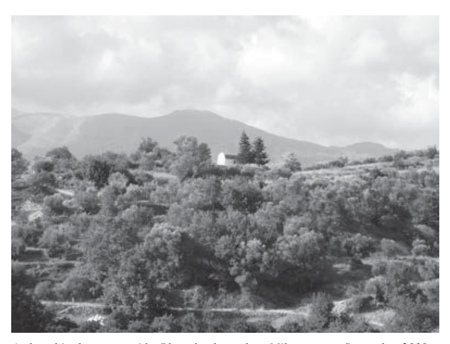
A chapel in the countryside. Milopotamos, September 2010.

She continued by saying: "As it is, it tells you...It has a lot of meaning!" Here, Agapi was referring to the typical, small Greek chapels that are located a short distance from the village and have been built even in very remote places in the countryside. These chapels were built to honor a particular saint, and often they hold a modest liturgy only on that saint's day; this is in striking contrast to the central churches that conduct regular liturgies weekly and which, except during these liturgies, are often frequented on a daily basis by locals and visitors, lighting candles in memory of their loved ones. By referring to the random entrance of a shepherd to keep rain in the building, using it for some other purpose than what it was built for, the poem enhances the metaphor of isolation and uselessness. Later on, we learned that this was indeed how this lively old woman herself felt her own life to be: her husband and some close relatives had died early, and although she had children and grandchildren, she regretted that her full life had passed too soon. Such an utterance gives voice to personal experience. While corresponding to a poetic picture of one's emotions and thoughts, this brings the satisfaction of self-expression, but it also brings a psychological release: others have felt the same.