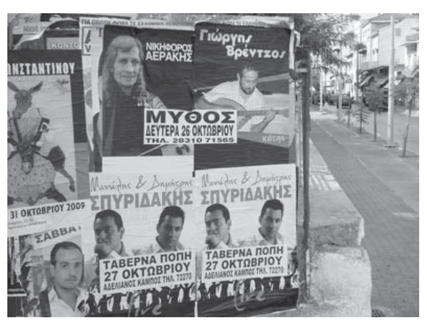
Posters advertizing musical performances in kéndra, similar to those informing of the paniyíria during the summer season. Rethimno, September 2009.