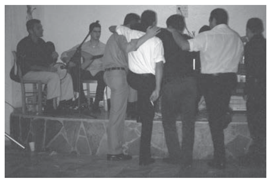
Towards the end of the gléndi, when the dance is over, the close relatives and friends gather to perform mandinádes in front of the musicians.