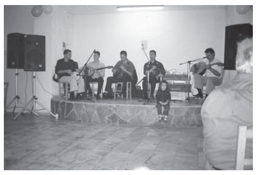
Performance taking place in a baptismal celebration in the local village association's hall. The group consists of two laoúta, a mandolin, a lira, and in this occasion (due to the presence of my husband) percussions, which are sometimes added to the group today, although they do not make part of the traditional combinations in central Crete. Milopotamos, 2004.