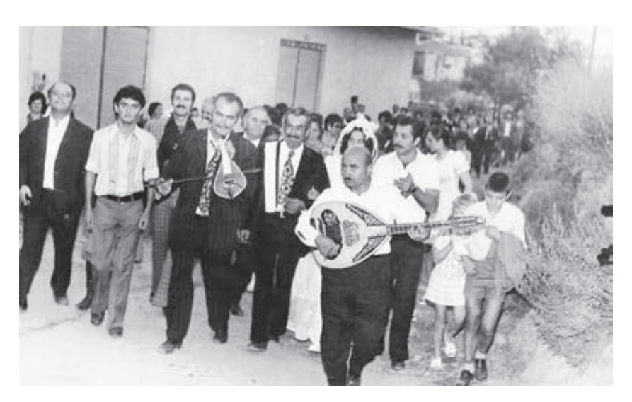
A traditional Cretan marriage in central Crete: a procession leading the bride to the church.

danced only at weddings as the bride's dance, horós tis nífis ; this is the first dance after the wedding ceremony when mandinádes are traditionally sung to her. As mentioned above, the main importance of this musical form is to serve as a vehicle for improvisatory singing.