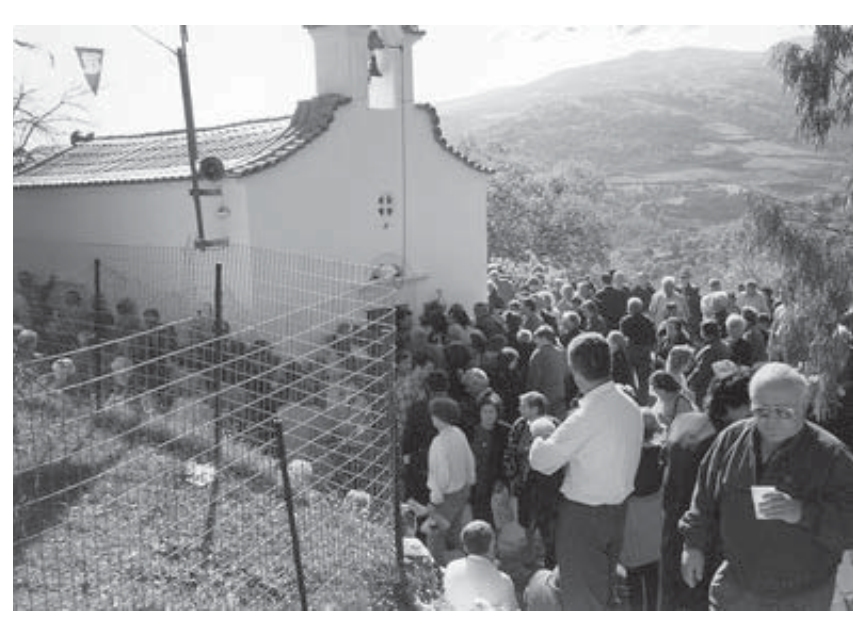
The morning service of the paniyíri of Saint George (April 23rd) in Asi Gonia, 1997.