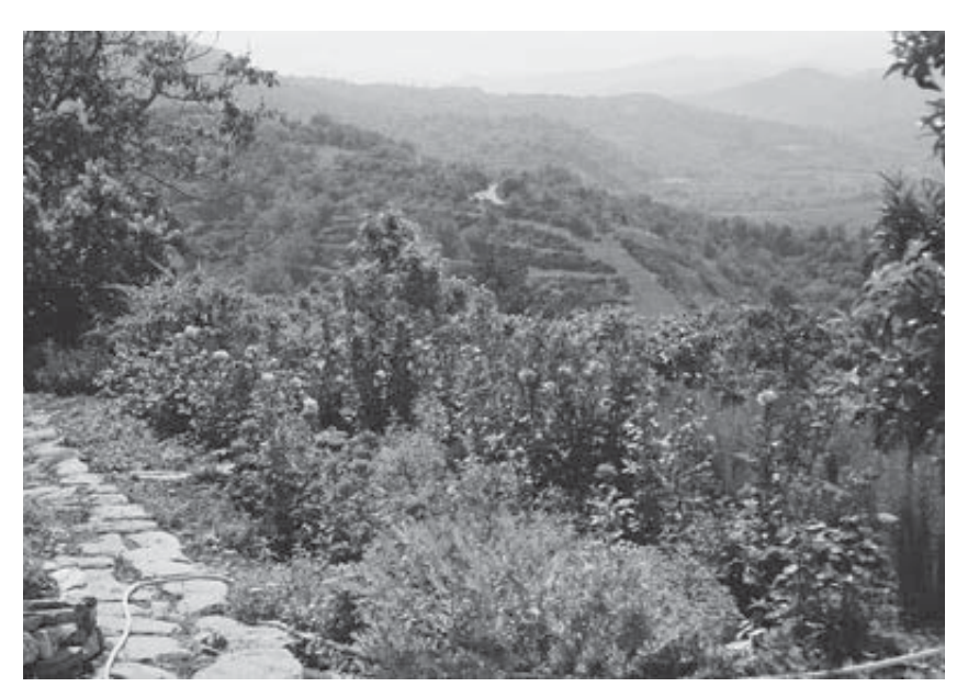
A view from the garden, Milopotamos, spring 2006. My daily solitary tending of my landlord's small garden balanced the extroversion of the fieldwork and also created extended emotional ties to the Village. In the beginning, the villagers were astonished at my sense of duty for a garden not my own – something which in the long run certainly contributed to their approving attitude towards me.

opportunity of having an opponent whose vast experience in the field and whose insightful writings about the specific social and cultural environment of my subject matter have initiated and served as points of reference for so many ideas taken under examination in this study.