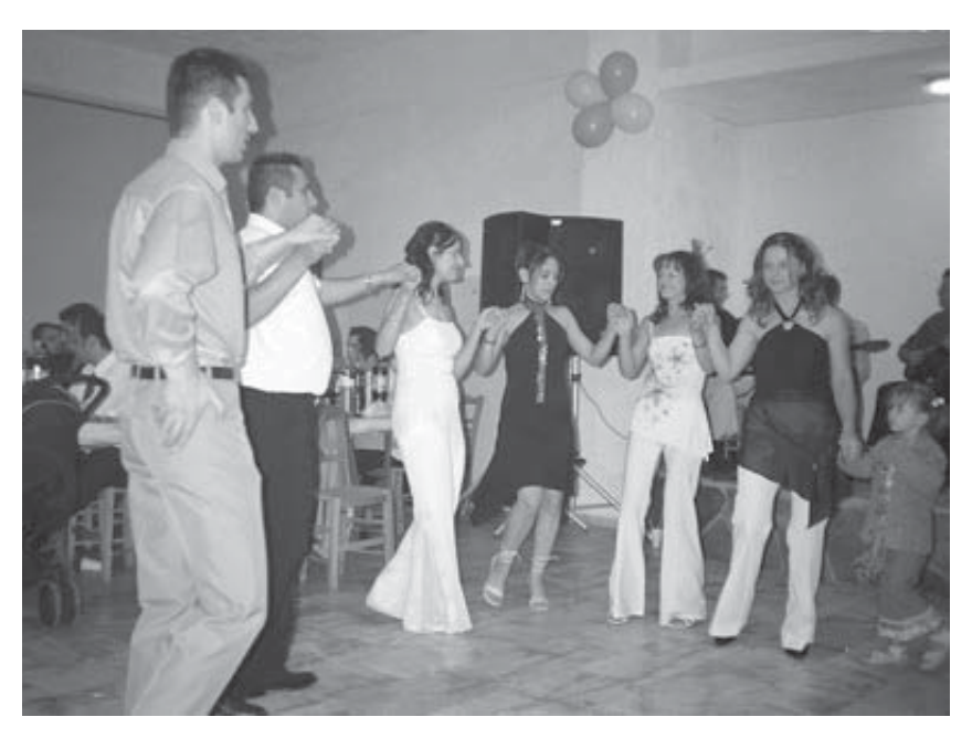
The father of the baptized son leads the close relatives to the first sirtós dance.