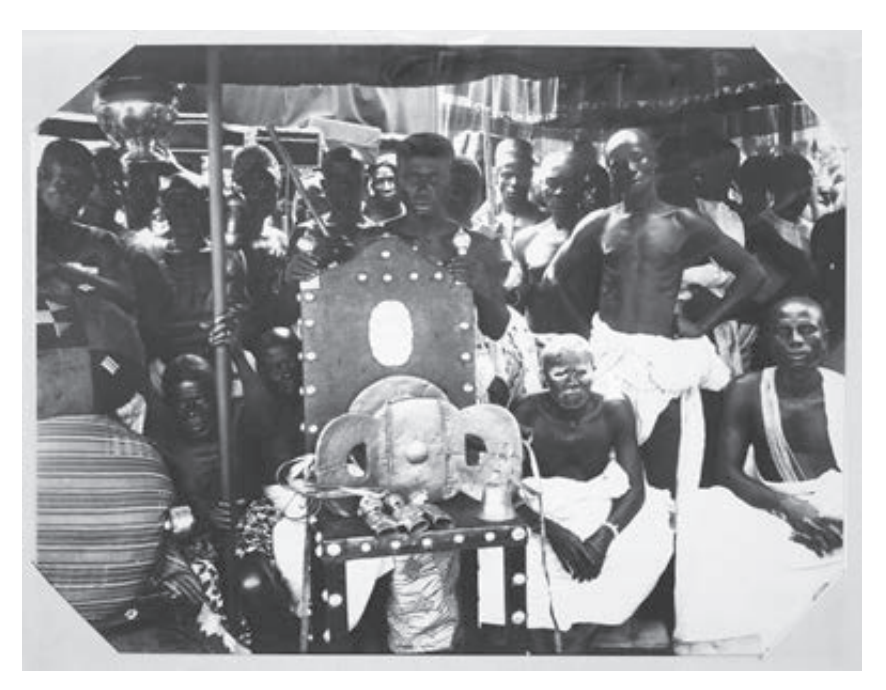
"The Golden Stool with its immediate caretaker" (TNA CO 1069/44). The wooden structure and golden decorations of the stool suffered severely while it was kept hidden from the British occupation authorities 1896–1926 (see Rattray 1935; McCaskie 2000b). In the photo, taken in 1935, the repaired stool is on display.

144–146). The ritual highpoint of the festival took place on 'Apafram Sunday', when the Asantehene made sacrifices to the Apafram charm in front of the skulls of the dead enemy chiefs, and made a plea to it that if there is "[a]ny king who does not like to serve me, let me get the chance of killing him and put his head into you" (Wilks 1993, 116). On the following day the chiefs "returned each to their own country, there to continue and complete" the Odwira by ritually "purifying" their own ancestral stools, the shrines of the local deities, and the regalia of their offices (Rattray 1959 [1927], 137). In 1933 one paramount chief described the origins and later developments of Odwira in a following manner: