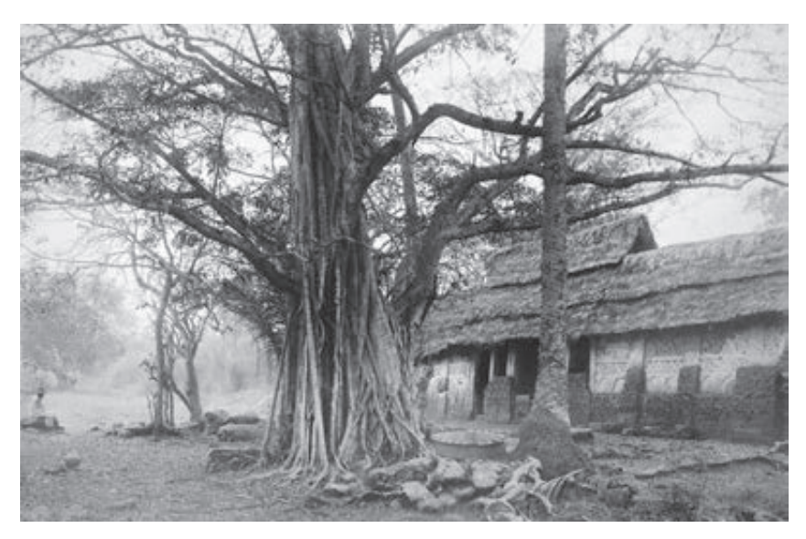
"Bantamah Kings Cemetery" (TNA CO 1069/31). The skeletons of the dead Asante kings were stored in a mausoleum where they were attended by female custodians knowns as "the wives of the ghosts" (Rattray 1959 [1927], 188–119). The Asantehene also performed yearly sacrifices at the mausoleum (McCaskie 1995, 159–160). The building was eventually destroyed by British troops in 1896 (Wilks 1993, 242).