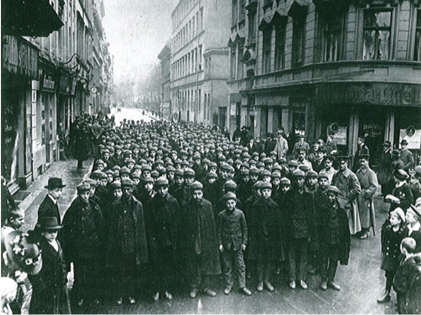
FIGURE 6.2 Photograph of Ottoman craft apprentices in Berlin, May 1917.