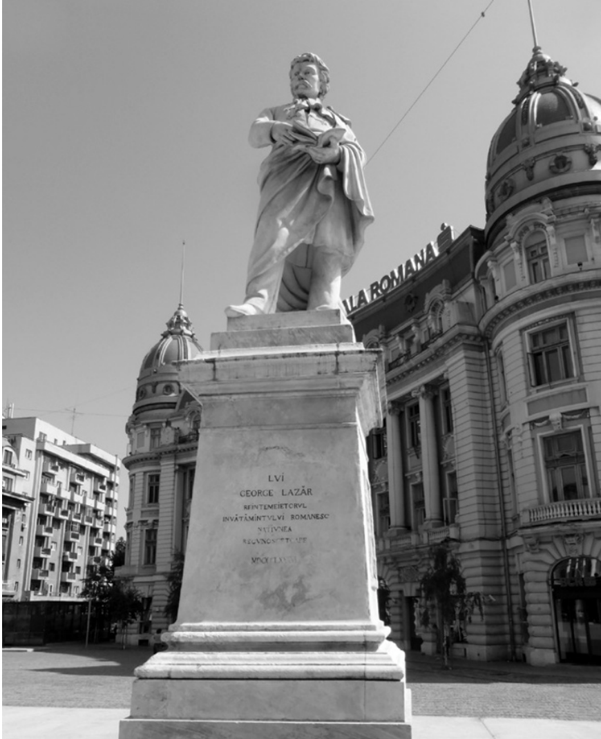
FIGURE 8.5 Statue of George Lazar, Bucharest, erected 1886. Author's photograph.

a peasant village, not in the city; and a generation after Ghica. He had little interest in science, and neither reached high office nor travelled either to the West or the East. His main education was in schools and seminaries in or near his village, located in Neamț county, near the Carpathian Mountains bordering on Transylvania; and subsequently in Iași, where he arrived just as