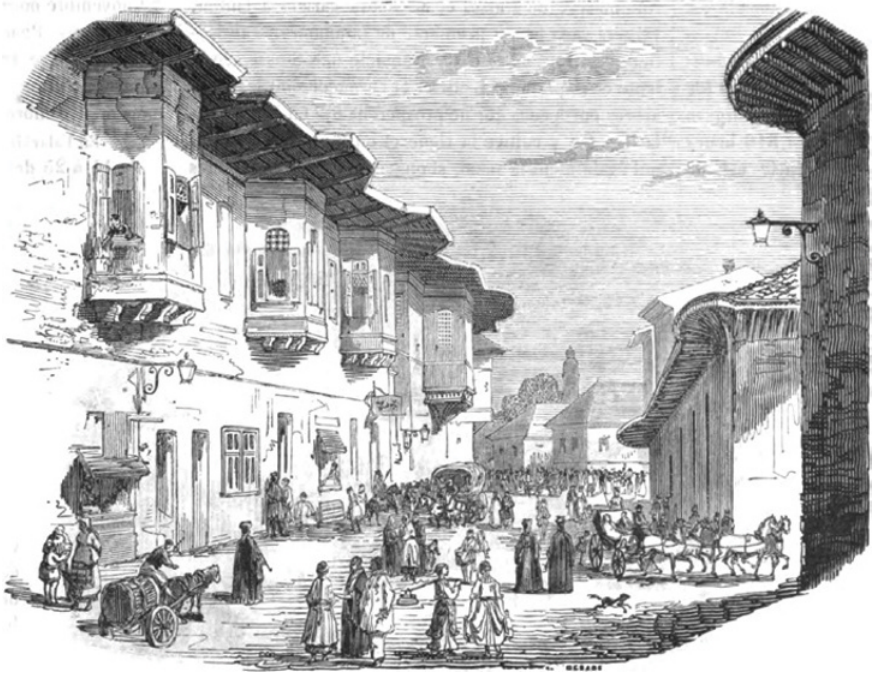
FIGURE 8.4 Charles Doussault, Bucharest Street Scene, 1841

Romanians (“Petrescu”). And at yet another, these narrow streets with closed-in vistas, metonymic of the past, are placed in implicit opposition to the urban landscape of the modern 1880s, with its statue of “Lazăr,” (Figure 8.5) the teacher from Transylvania who had pioneered Romanian-language schooling in the 1810s, now commemorated in the modern way, in marble, at the corner of modern, perpendicular boulevards, in a city with an Academy. 36