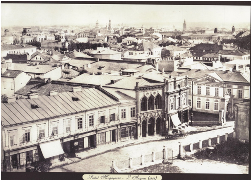
FIGURE 8.3 Rooftop view of Bucharest, 1856.

Bucharest (Figure 8.3) is somehow both enormous and unworthy; immeasurably ancient, but also behind the times. And while it may one day become “a great and world renowned capital,” any chance of it “assuming a more regular direction” will clearly “take much time.” Specifically, the trick of perspective afforded by the trope of the foreign traveller provides a characteristic view of Romanian society between old and new, between disorder and order.