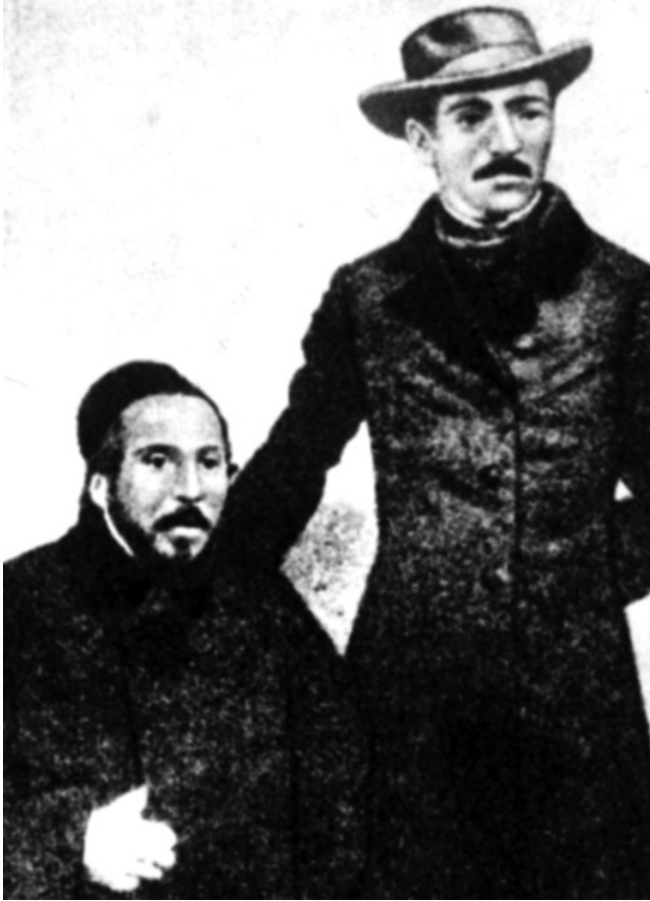
FIGURE 8.2 Ion Ghica and Vasile Alecsandri in Istanbul, 1855.

In the first phase of his career, Ghica produced a number of informative works, including brochures on economic matters such as the customs union between Moldavia and Wallachia, the adoption of modern weights and measures, political projects and survey reports on the situation of the Principalities. 18 But he also experimented with literary genres, including theatre and fiction. 19