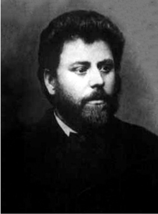
FIGURE 8.7 Creangă in a more modern portrait, as ‘writer.’

club where lesser scholars and functionaries could mix with the city’s political and administrative elite. 38 One of these, the university professor and critic Titu Maiorescu (1840–1917), found Creangă teaching posts and commissioned him to write school manuals for use in the new primary education system (Figure 8.7).