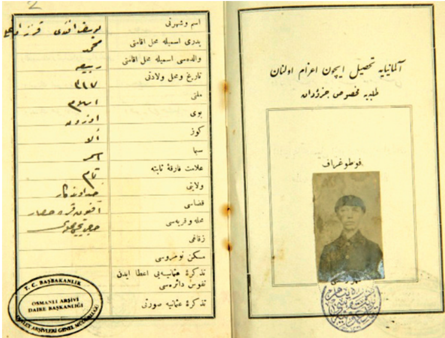
FIGURE 6.1 Passport photo of an orphan sent to Germany in 1917.

barefoot. This partially explains why so many of them were sent back after a few months: they had lung diseases.