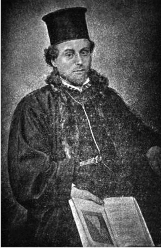
FIGURE 8.6 Ion Creangă in deacon's robes (from Șezătoarea: Revistă pentru literatură și tradițiuni populare , 6–7, 1901, 120).

the city was losing its status as capital of Moldavia on account of the Union of the Principalities at the end of the 1850s. A man of uneven temperament, he served as deacon to various churches in Iași (Figure 8.6), and subsequently as schoolteacher; but in both these capacities he attracted the opprobrium of the authorities for his unorthodox behaviour. His marriage to a priest's daughter was unhappy, and he divorced in 1867—a further badge of dishonour for a would-be candidate for holy orders. Soon afterwards he was divested of his clerical duties and resigned himself to running a tobacco warehouse, while cohabiting with an older woman and an extensive menagerie of cats.