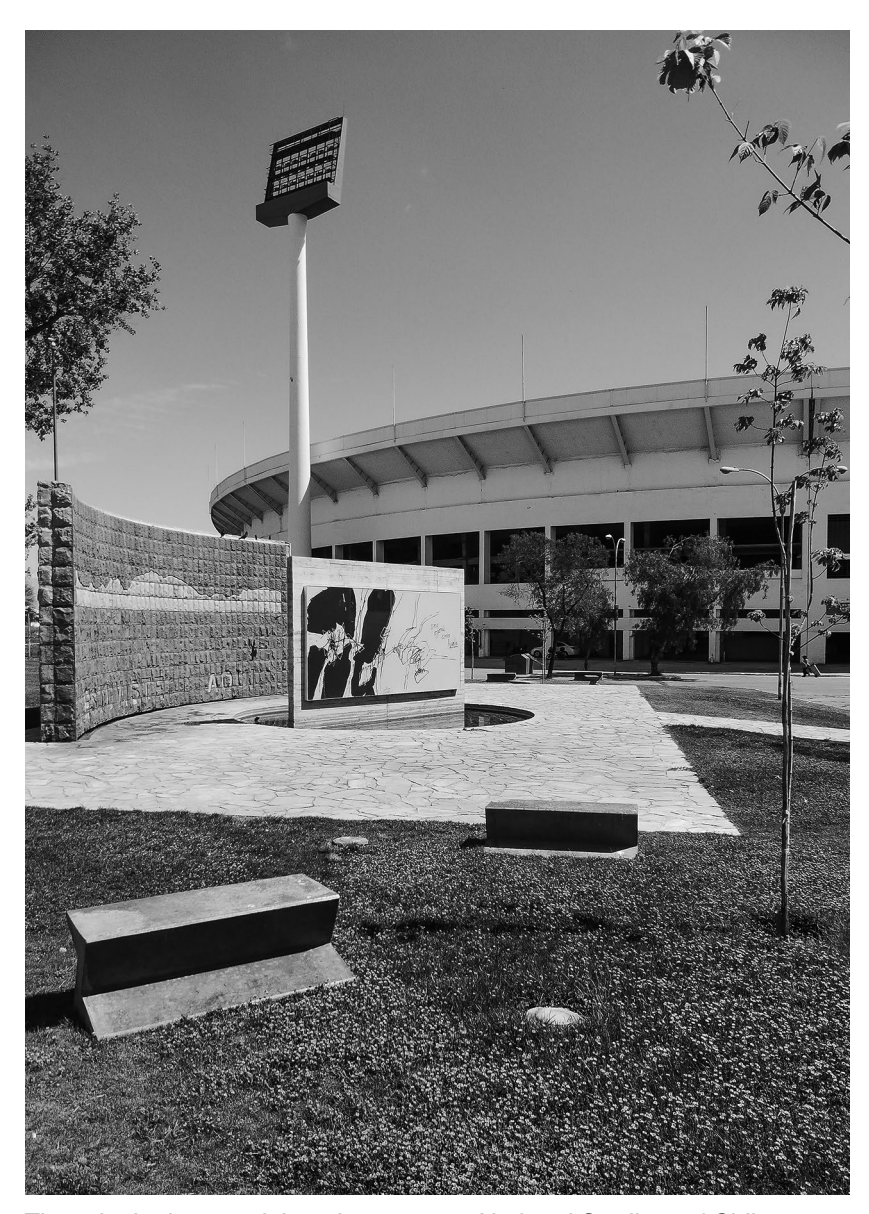
The principal memorial, main entrance, National Stadium of Chile.