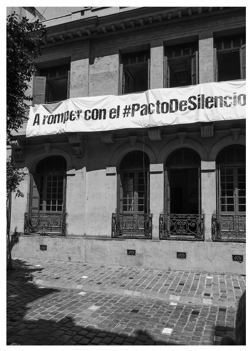
Londres 38 with its message of November 2015, 'Break the pact of silence'. On the darker flagstones are inscribed the names of the detained-disappeared believed held here, and their political affiliation.