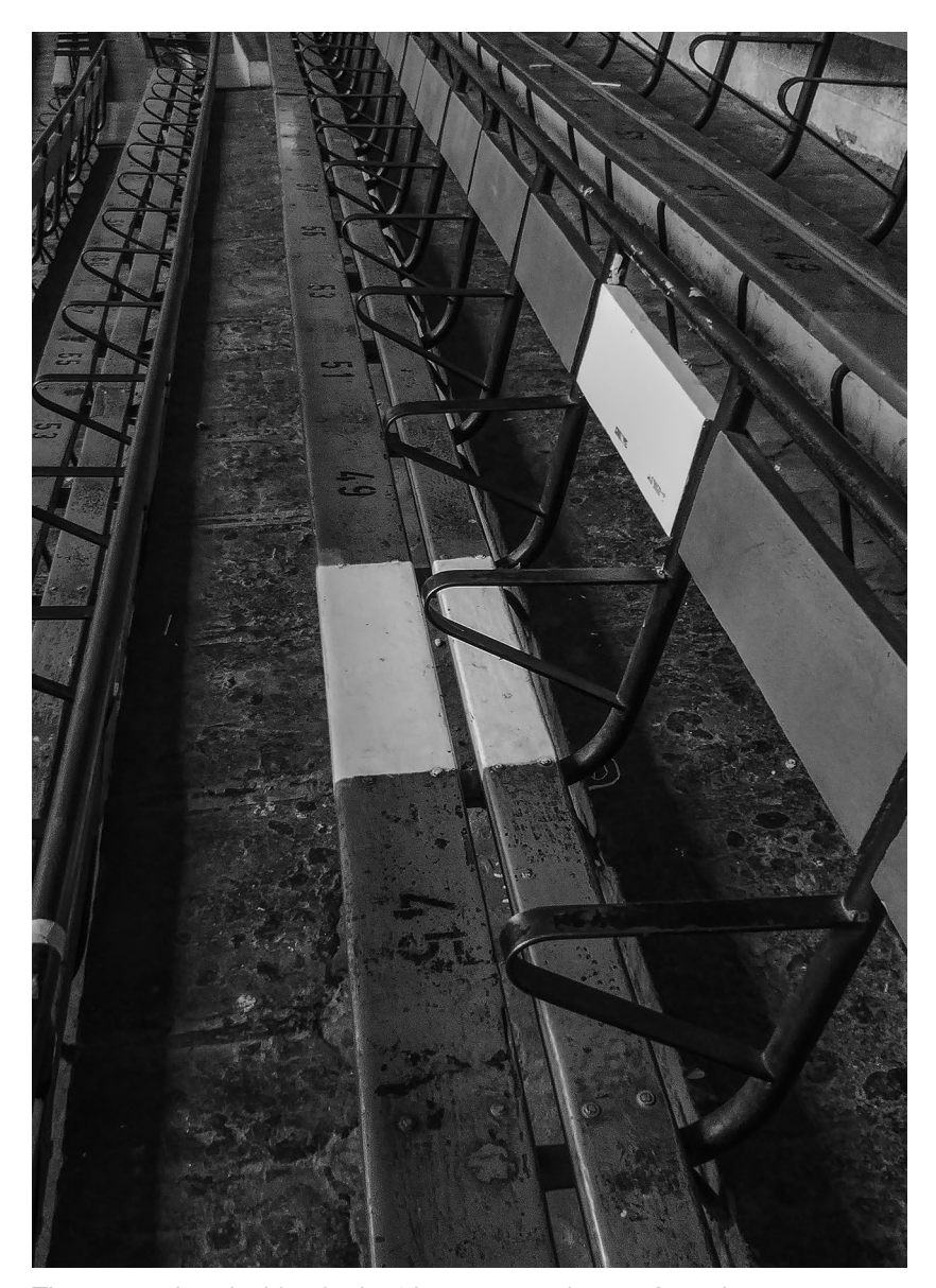
The seat painted white, in the 'dangerous prisoners' section, is that believed to have been occupied by Jara for a period after being recognised.