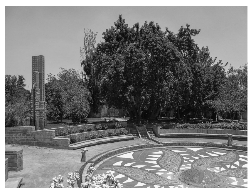
The Ombú tree, Villa Grimaldi. No signage attaches to it. Only Michele Drouilly's 'Memory room' gives an account of what happened here.