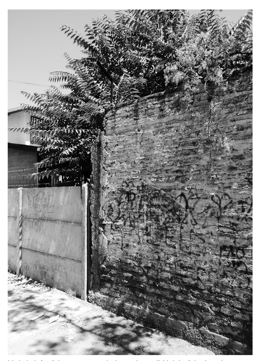
Little is left of the once-guarded exterior wall (right) of the Loyola CNI Depot.