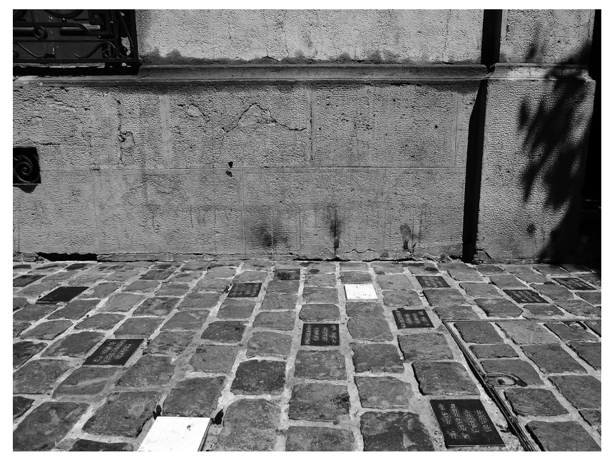
The front façade, Londres 38, showing the marks of burning candles resting against it during the vigils held for the detained-disappeared.

two testimonies, or paste photographs of the detained-disappeared on the walls. Father, mother, daughter, son, husband, wife, Donde está? Where is he? Where is she? Early next morning the O'Higgins workmen arrived to pull the posters off and whitewash the wall. The despairing cries to the disappeared had themselves disappeared. All that remained, to careful observers, were a few whitewashed corners of posters too hard to remove, and the tiny marks at ground level where the vigil candles had discoloured the once elegant white façade.