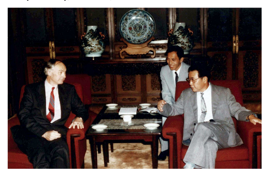
Figure 9: Robert O'Neill with Deputy Premier Li Peng, Beijing, September 1986.