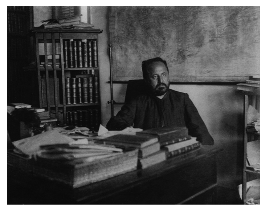
FIGURE 3.1 Sheikh Muḥammad Rashīd Riḍā (1865–1935) in his Al-Manār Office in Cairo (Family archive in Cairo)

miracle."<sup>15</sup> In response, Ghulam Ahmad depicted Riḍā as a "jealous" and "arrogant" scholar who, like many others, not only rejected the message, but fueled the dislike of Indian Muslims against him and his followers.<sup>16</sup>