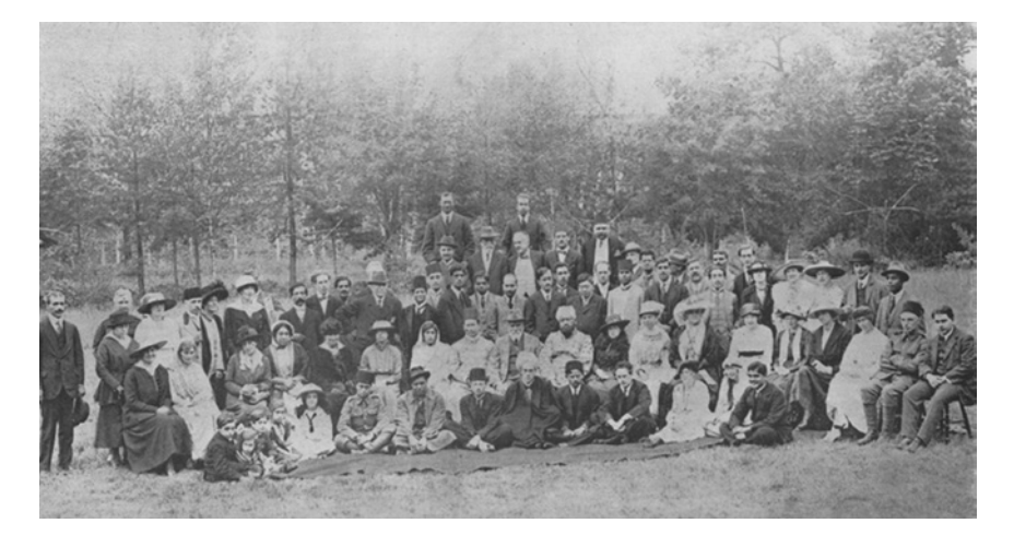
FIGURE 3.2 Id-ul-Fitr day at Woking, 10 July 1918 (The Islamic Review, August 1918)

for Islam in India and Europe, Riḍā finally concluded that the Ahmadis of both branches were followers of falsehood (b\bar{a}til) .<sup>36</sup>