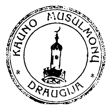
FIGURE 8.2 Kaunas Muslim Society's stamp, on a document dated 9 September 1937<sup>42</sup>

After the local organization's reorganization in 1930 into a purely religious (rather than a confessional Tatar) organization named the Kaunas Muslim Society (officially registered in 1936 and headquartered in the interim capital close to the seat of power), the most active members of the Kaunas congregation apparently had hoped that the relevant state authorities would recognize their new/old organization as the de facto leader among the nation's Muslim congregations and as the center around which provincial congregations should unite. The state appears to have, for a moment, subscribed to this idea and entrusted Kaunas Muslim Society with the supervision of a state allowance and its distribution among the three acting imams. Members of the Society, perceiving themselves as acting on behalf of and in the name of the state, in