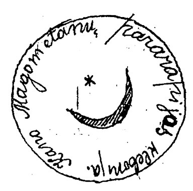
FIGURE 8.1 Sample of the requested stamp of the Rectorate of Kaunas Mohammedan Parish, 31 October 1923<sup>41</sup>