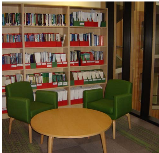
One of the reading rooms in the Hedley Bull Centre