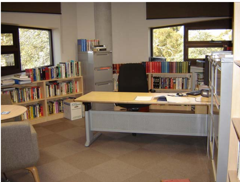
Professorial office in the Hedley Bull Centre