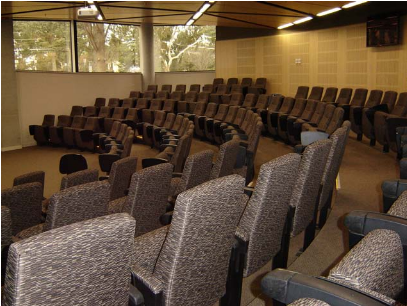
View inside the APCD Lecture Theatre in the Hedley Bull Centre