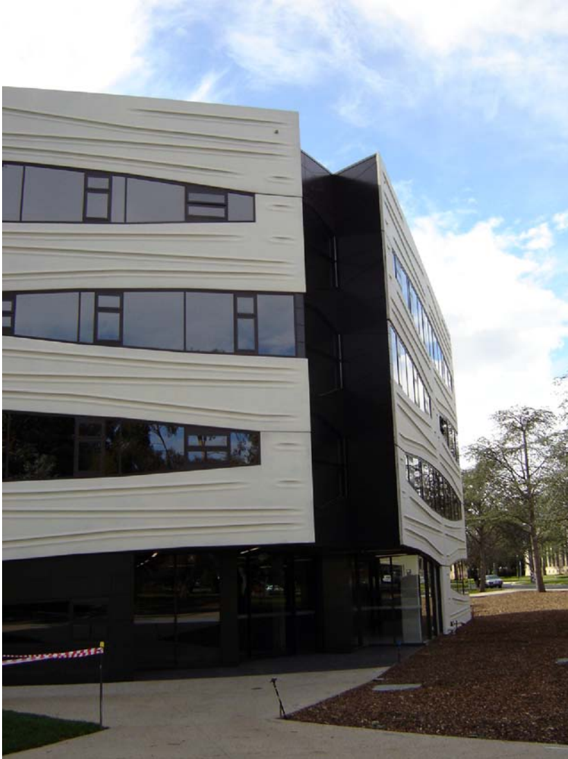
Main Entrance to the Hedley Bull Centre