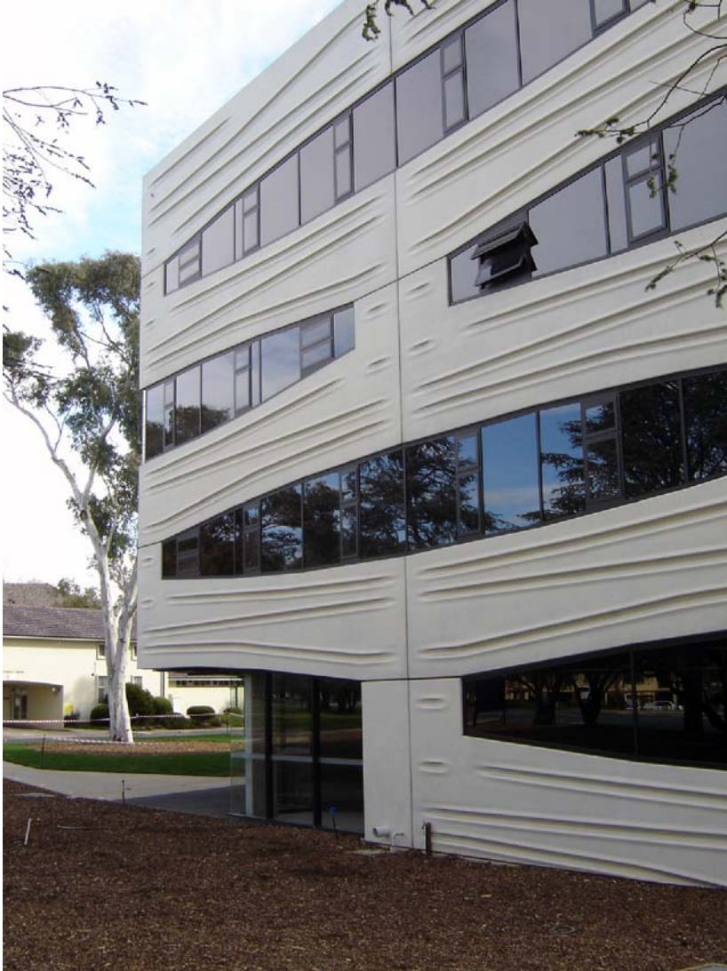
Main Entrance to the Hedley Bull Centre