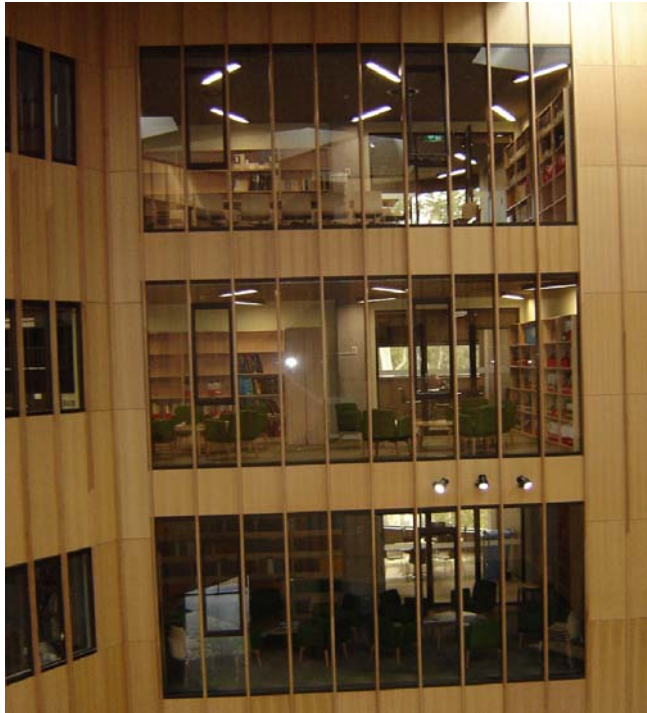
Three levels of reading rooms in the Hedley Bull Centre