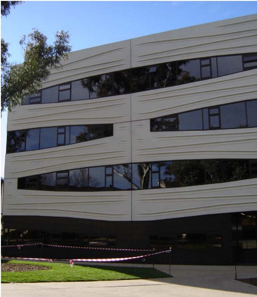
Main Entrance to the Hedley Bull Centre