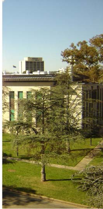
View from a professorial office