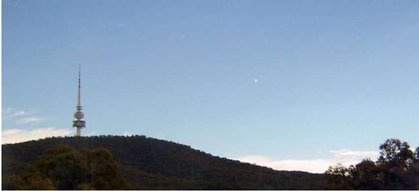
View of Black Mountain and Telstra Tower from Level 4, Hedley Bull Centre