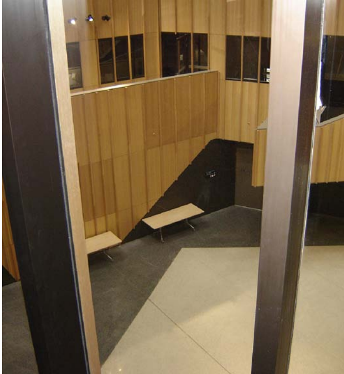
Looking down on the atrium of the Hedley Bull Centre