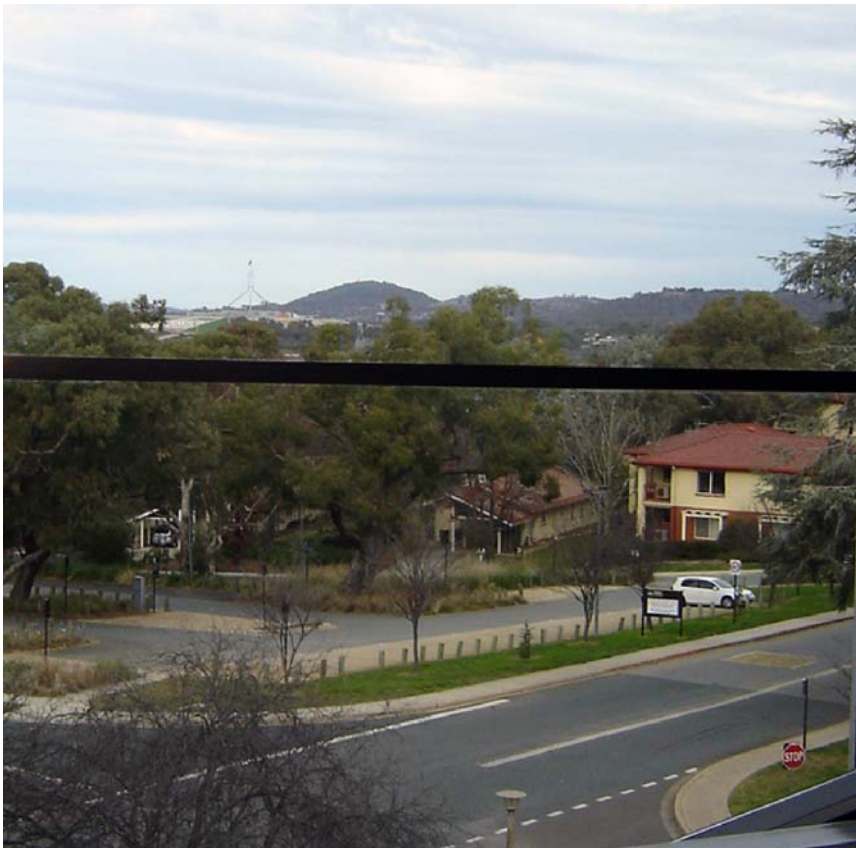
View of the corner of Liversidge Street and Garran Road (with parliament in the distance) from Level 4, Hedley Bull Centre