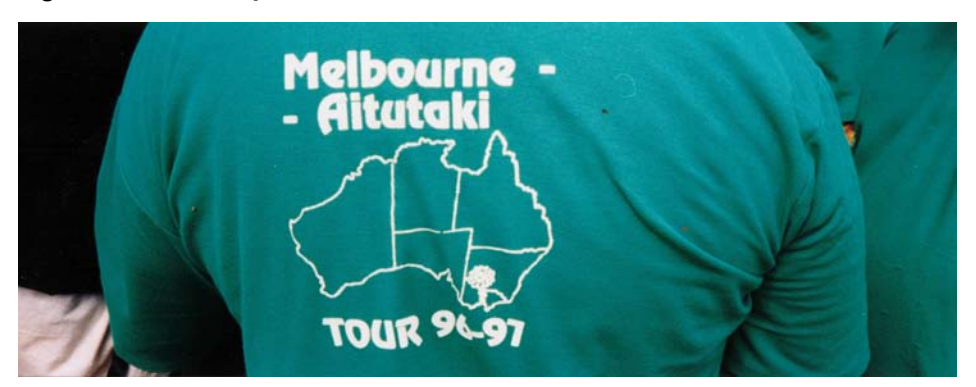
Figure 5-1: A tere pati T-shirt

These t-shirts make an important statement about the nature of Cook Islands diasporic communities and about transnationalism more generally. Both the emblem and the map visually represent the way these Melbourne Cook Islanders view their group's identity and place as dual: they are Aitutakian but also Melbournians. This twin state of belonging is a key aspect of transnational identities and Cook Islanders, like other Pacific Islander diasporic communities, have a complex range of investments in more than one country (Guarnizo and Smith 1998, 13; Lee 2003, 2004, 135: Spoonley, Bedford and McPherson 2003).