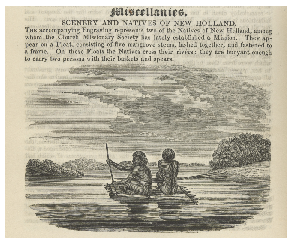
Fig 2. During the 1830s, the Church Missionary Society published tales of bush life, cultural clashes and missionary work at Wellington Valley. As the picture indicates, many aspects of traditional Wiradjuri life were continuing, to the fascination and concern of the missionaries.

Missionary Register, September 1834, L & G Seeley, London. National Library of Australia, N266.3CHU.