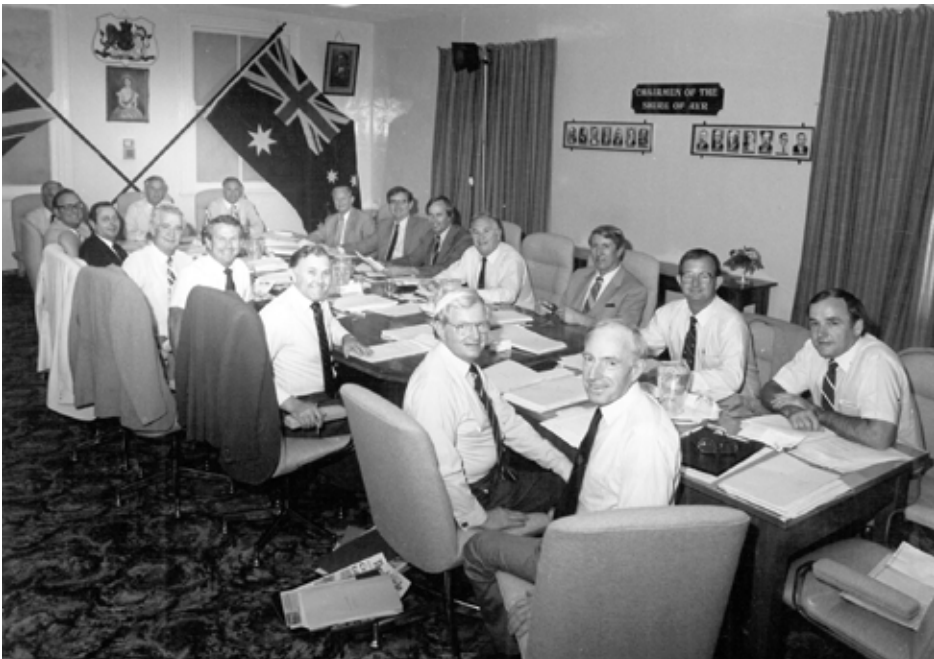
Image 16. The Seventh Bjelke-Petersen Ministry meeting at a country cabinet at Ayr, prior to the 1983 State election.