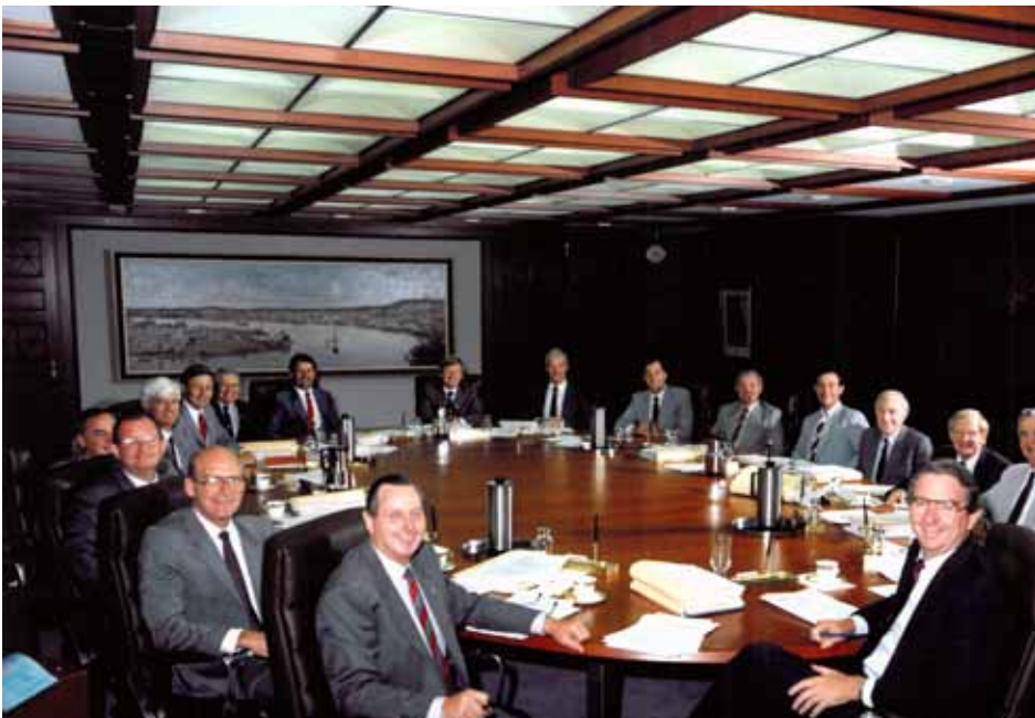
Image 22. The Second Ahern Ministry in 1989.