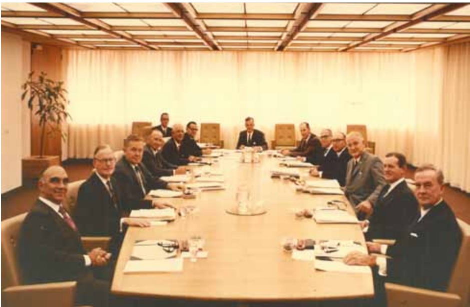
Image 9. The Second Bjelke-Petersen Ministry in the early 1970s.