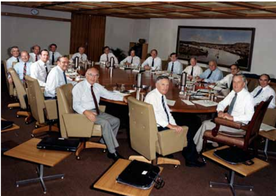
Image 14. The Sixth Bjelke-Petersen Ministry circa 1982.