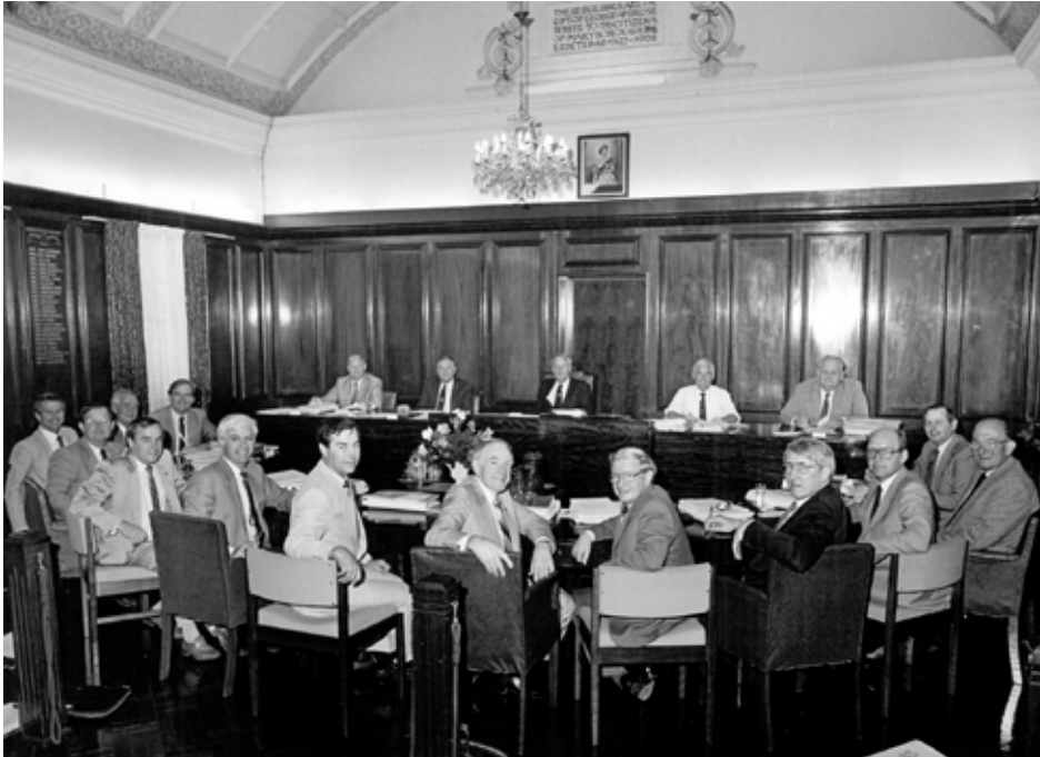
Image 17. A meeting of the Eighth Bjelke-Petersen Ministry at Maryborough circa 1984 or 1985.