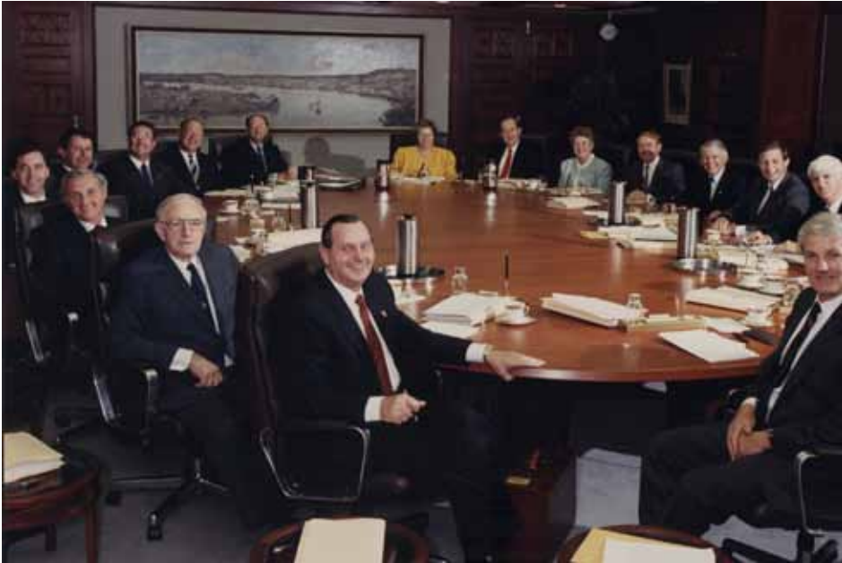
Image 23. The 18 member Cooper Ministry in September 1989, the first to contain two women cabinet members.