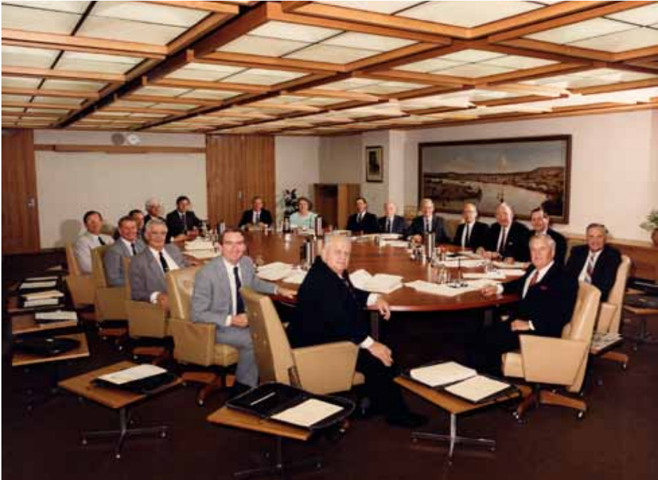
Image 19. The Ninth Bjelke-Petersen Ministry that lasted from December 1986 to December 1987.