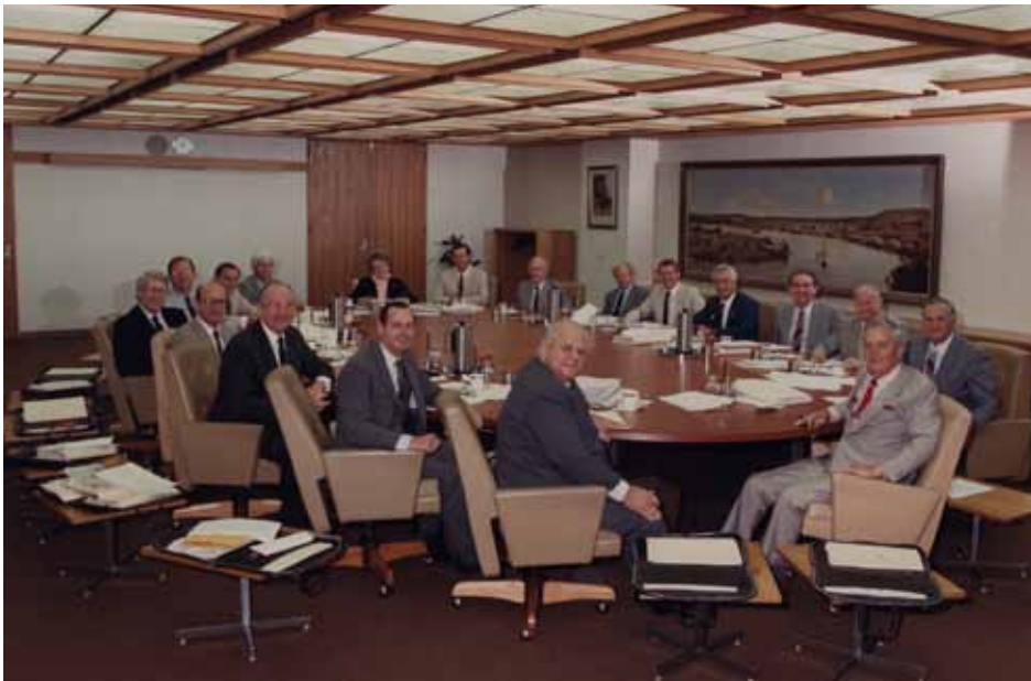
Image 18. The Eighth Bjelke-Petersen Ministry when the Nationals governed alone circa 1986.