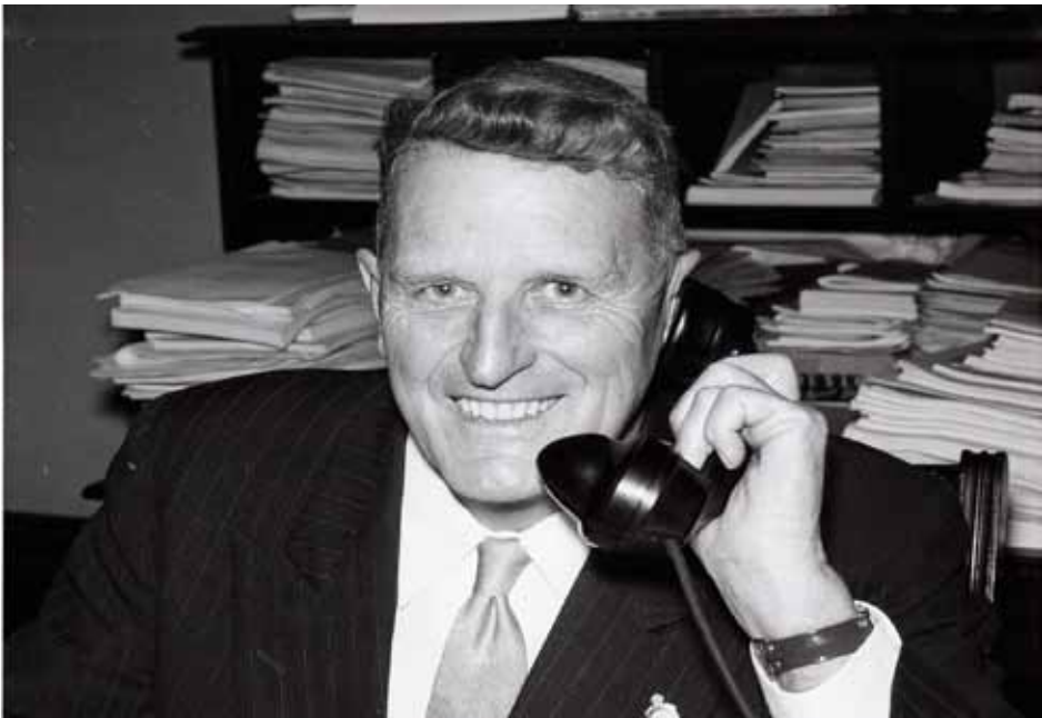
Image 5. Frank Nicklin, Leader of the Opposition in Parliament House June 1957.