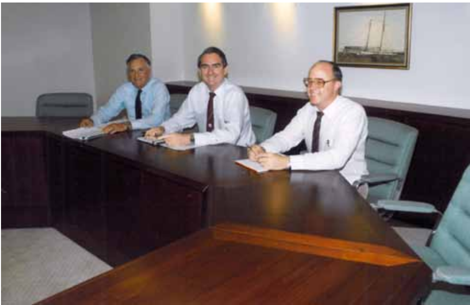
Image 20. The interim Ahern Ministry in 1987.