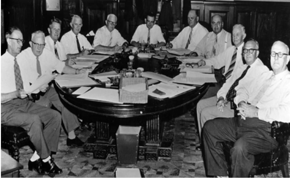
Image 6. Nicklin Ministry circa 1960s.