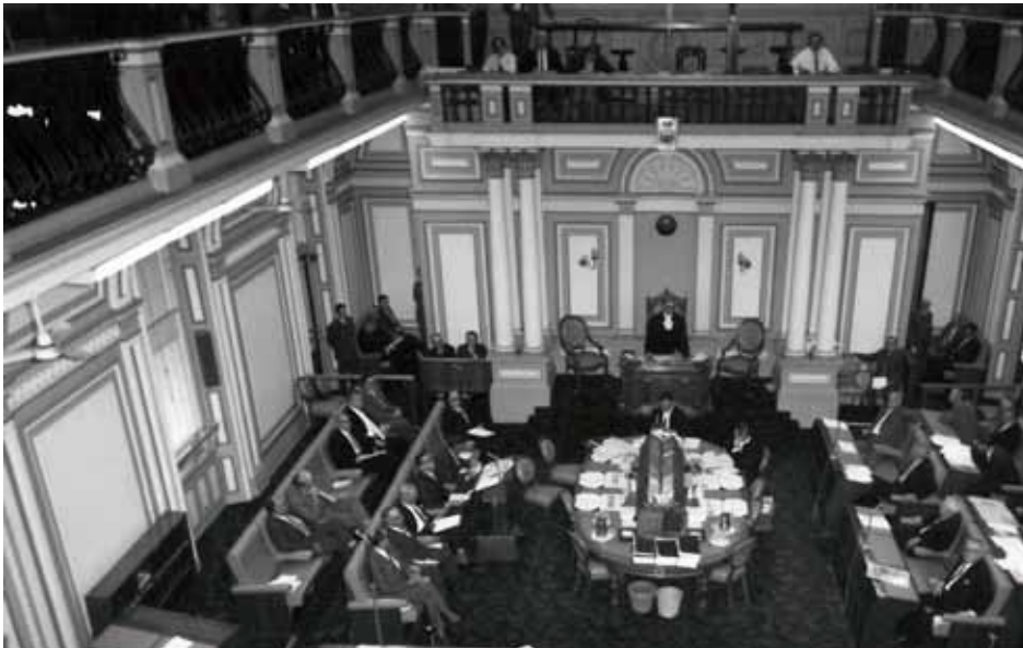
Image 11. The Queensland Legislative Assembly sitting in the early to mid 1970s, prior to the major restoration in the early 1980s.