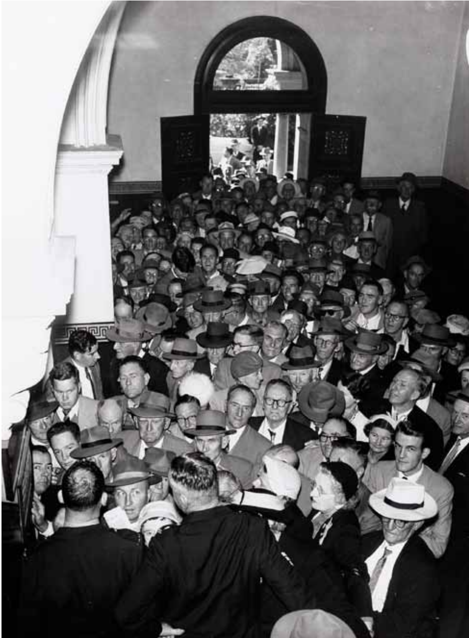
Image 3. Members of the public attempting to gain entrance to the public gallery to witness the fall of the Gair government in June 1957.