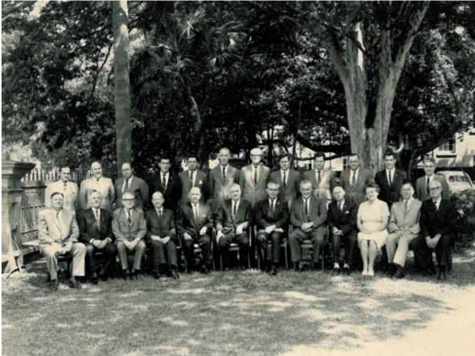
Image 10. The Opposition Leader, Jack Houston (seated centre), with some of the Opposition members circa 1971.