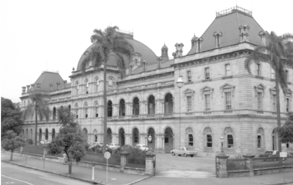
Image 7. Parliament House, circa 1960s.