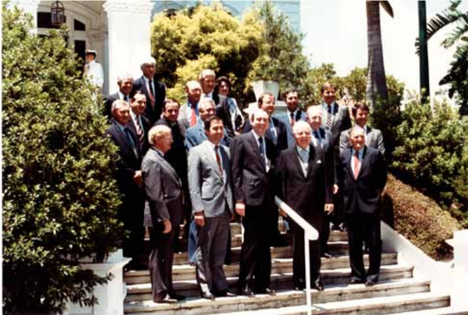
Image 21. The first Ahern Ministry after its swearing in with the Governor Sir Walter Campbell, December 1987.