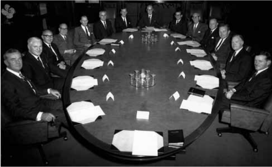
Image 8. The First Bjelke-Petersen Ministry in the early 1970s.