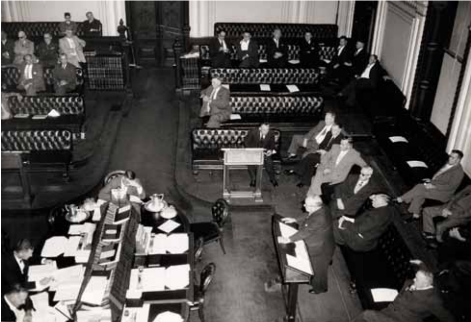
Image 1. The Premier, Vince Gair, standing in the foreground asking the House to vote supply in June 1957 before the fall of his government.