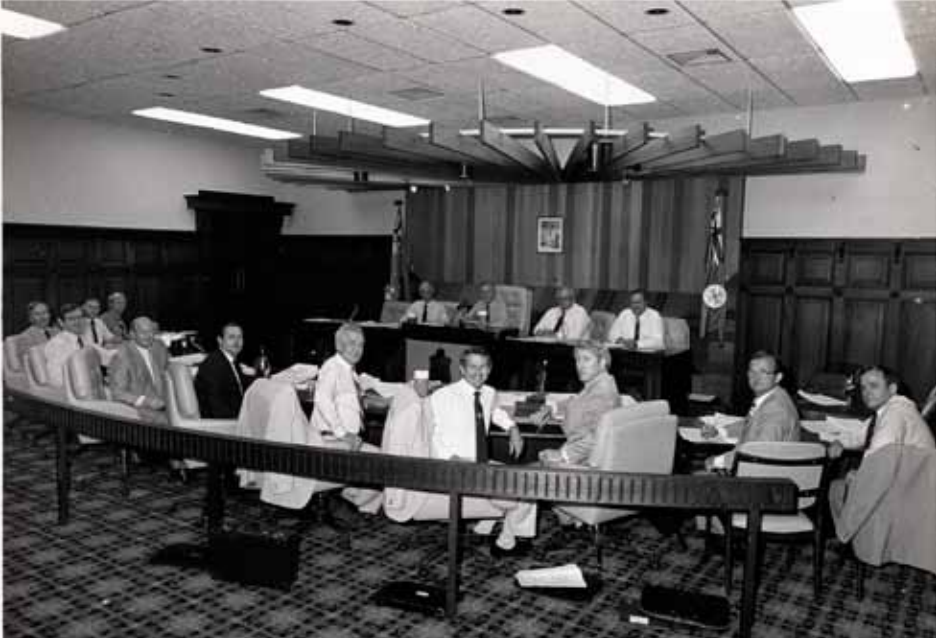
Image 15. The Seventh Bjelke-Petersen Ministry 1983, the so called 'Rump' Ministry composed solely of Nationals.