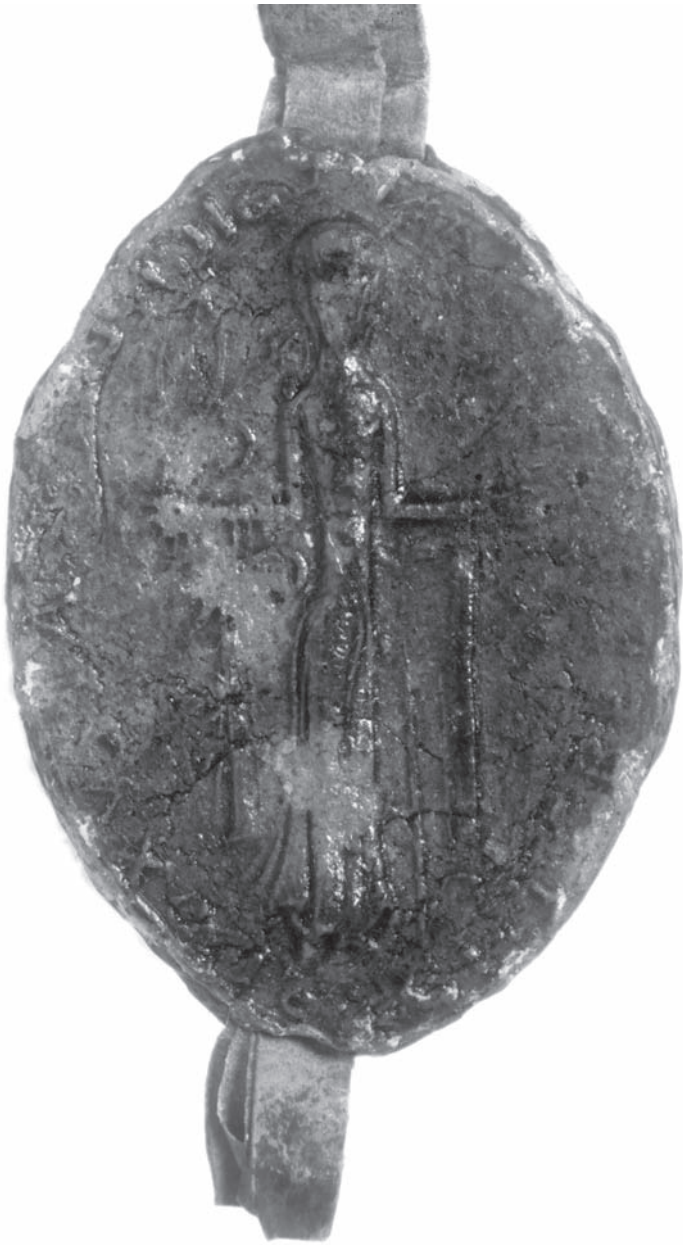
Seal of Alice, Countess of Northampton (1140–60, Egerton Ch.431).