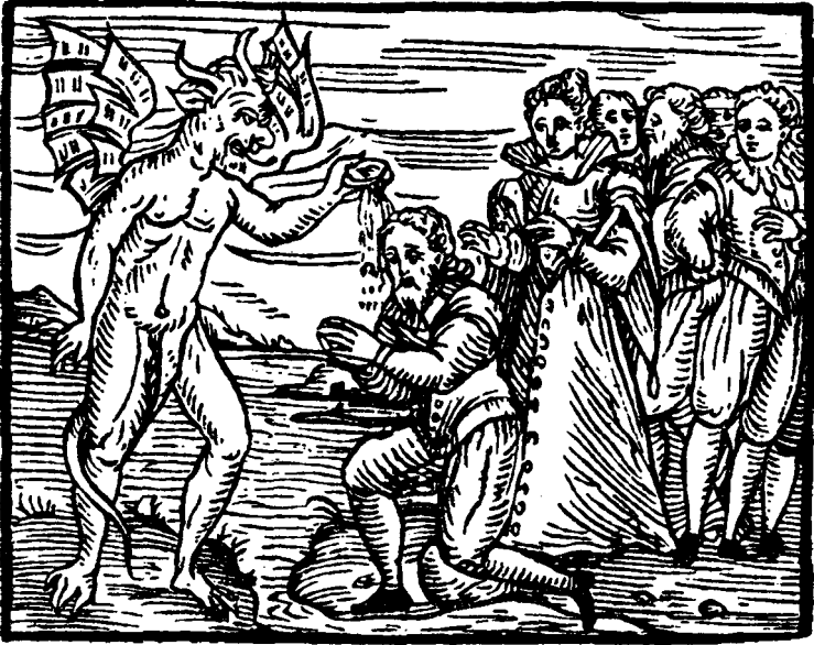
3 Male and female witches; 'new mock baptism' of a male witch by a devil.