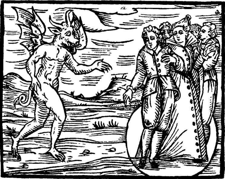
5 Male and female witches standing in a magical circle to swear allegiance to the Devil.

process of question and response, which produced the final document that Junius ratified and confirmed in public on 6 August 1628, a full month after he ‘at last began and confessed’. This is the key crime here, as in most other cases involving the ‘elaborated concept’. There are also various local details and imps’ names in the confession, but it follows the generic script very closely.