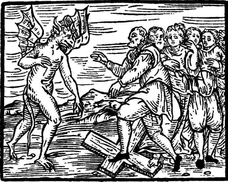
4 Male and female witches; male witch stepping on a cross as a sign of renouncing Christ.

accusing them of witchcraft as well. The details of his confession conform closely to the ‘elaborated concept of witchcraft’, as Wolfgang Behringer has described it, that quasi-literary confabulation of satanic, pagan and folk practice with utterly imaginary but quite ancient slanders that had first coalesced in the Malleus maleficarum of 1487, but did not reach its fully formed state until the sixteenth century. It is important to note that Junius confessed to having renounced God in Heaven and all the heavenly host by the formula ‘I renounce God in Heaven and his host, and will henceforth recognise the Devil as my God’ (see figures 4 and 5). 32 Given the insistence with which Junius had, under torture, denied renouncing God, we can conclude that he had been questioned closely and repeatedly about this item. The presence in the confession not only of a description of the act, but also of the precise formula used, points to a carefully shaped and guided