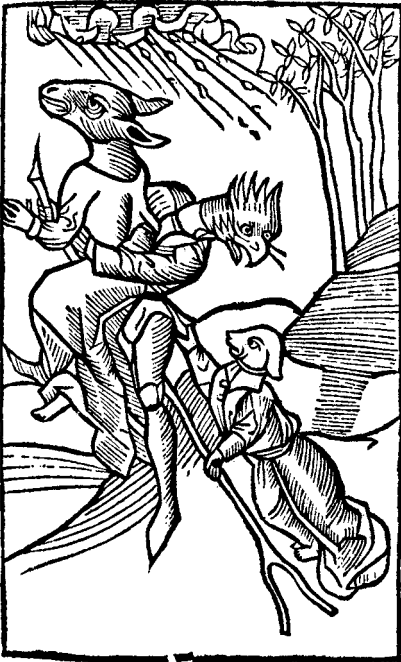
6 Witches in the form of animals, riding a stick.