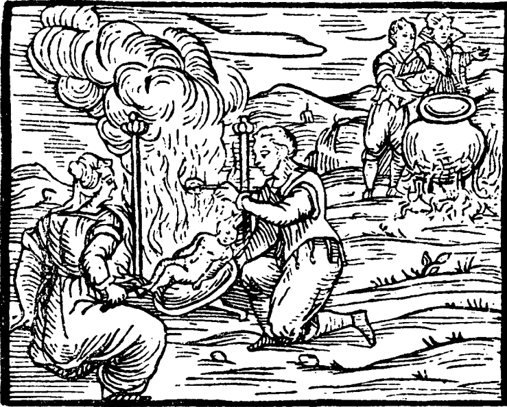
9 Male and female witches subjecting the bodies of dead infants to roasting or boiling as a preliminary to using their fat or ashes to make noxious charms, potions and ointments.

roasting an infant while a couple in the background prepares to boil a child in a cauldron (see figure 9). 59