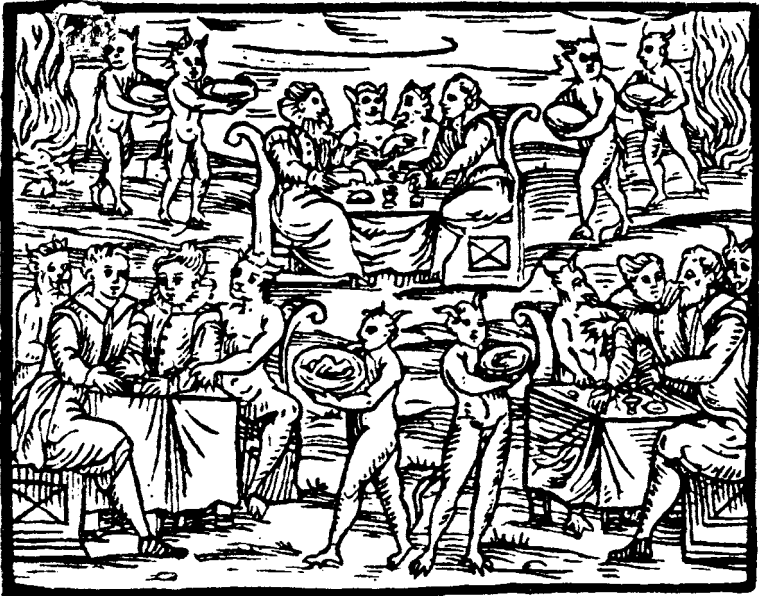
10 Male and female witches dining at the witches' Sabbath.

Norman Cohn has argued that the early modern notion of the Sabbath evolved from much older fantasies about various dissenting groups. Early Christian apologists encountered widespread beliefs that