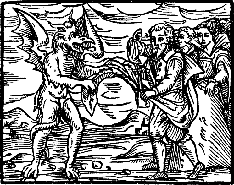
8 Male and female witches; male witch gives a piece of his clothing to a devil as a sign of homage.

(Rome, 1555) also contains illustrations of both male and female witches. In one woodcut, a male witch is using a knotted rope to influence the winds. 57