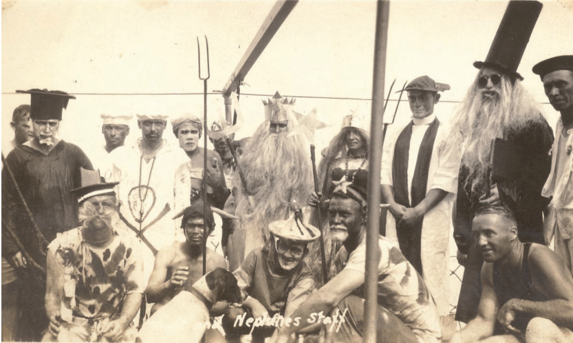
Characters in Neptune's Court, early twentieth century

winnigen ter zee, 1672-73,' following sea victories over France and England, suggesting that Neptune was pervasive in Dutch maritime folk culture, which characterized the Netherlands. 91 There is even the proposal that the visual representation of Neptune influenced the standardization of St. Nicholas ( Sinterklaas ) with beard, staff, and robes. Besides being the most popular festive figure (in England it would be Father Christmas), St. Nicholas became the patron saint of seafarers. 92