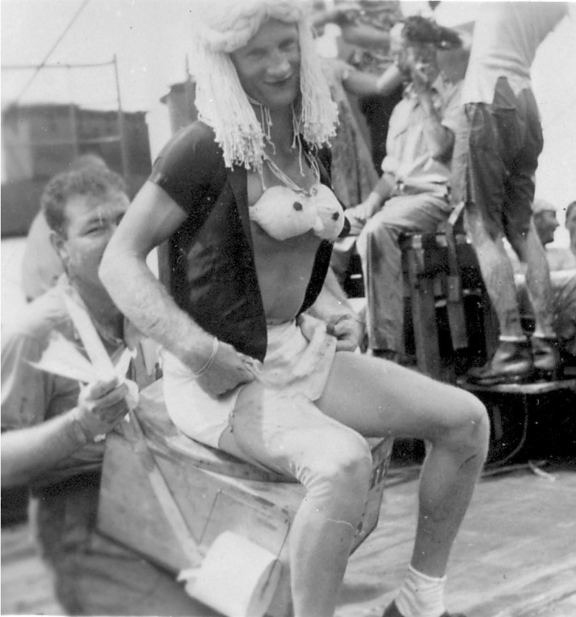
Pollywog in drag on Wog Day sitting on mock toilet seat

logical compact, an 'order of the deep,' with the fatherly Neptune, rather than with a princess. Women are equated with the pollywog, an identity intended to be repressed. The Wog Queen contest, for instance, emphasizes the femininity, and therefore weakness, of the wogs. Contestants draw laughter and ridicule, because they suggest