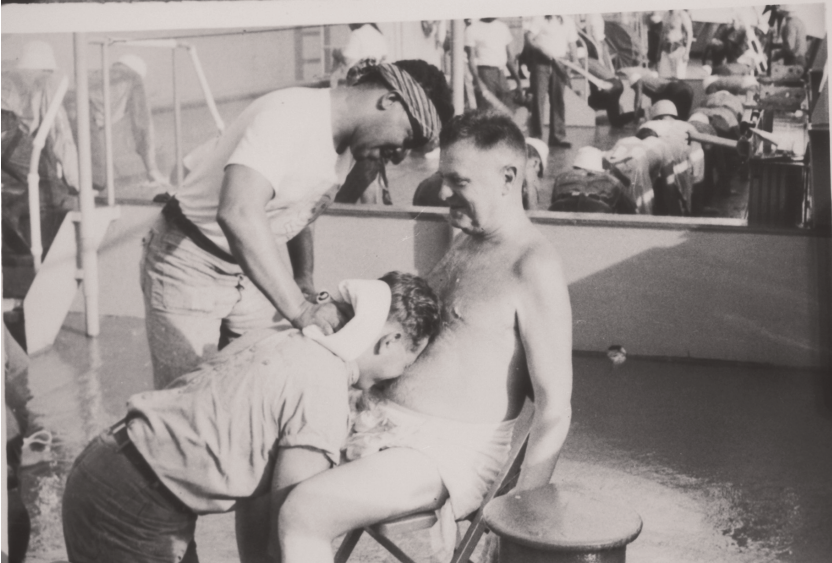
Kissing the Royal Belly covered in raw eggs and oysters, USS Oxford, 1966

mother to fear of the repressive, revengeful father. To effect manliness at sea, especially given the view that maternally dominated, landed civilization is feminized and soft, and the military insecurity about homosexuality in an all-male environment, female figures, or men in feminized positions, are sexually dominated and ridiculed. Dealing with the often unconsciously internalized insecurity that sailors take on feminine roles on board, female (and the sodomized male) characters are externalized, ejected from the self; they are performed in Wog Queen contests, dog auctions, and homosexual enactments as ridiculous, passive, weak, and scared. 95