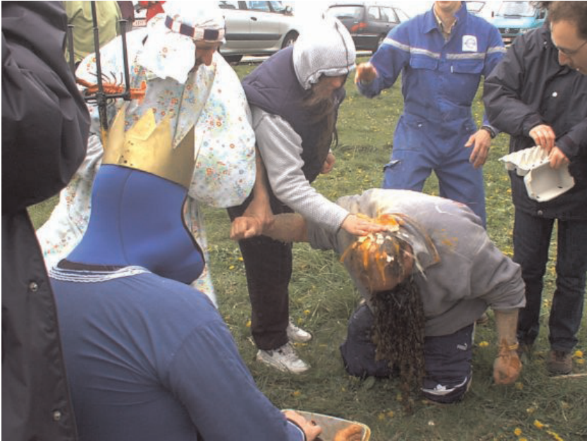
Hazing of initiate by dumping eggs over his head during Neptunusfeest of Duikteam Medusa, Netherlands, 2004

sitivity. In the Low Countries, for example, scuba diving clubs such as Duikteam Medusa are known for their own versions of Neptunusfeest in which new divers' heads are doused with flour and eggs while a crowned Neptune accompanied by two white-robed helpers presides. Their line is the liminal space of the shore, between land and sea. Their reference to danger and the unknown is in the depth of the waters. Solemnizing the ceremony, the helpers bring the initiates one by one before Neptune as judge and ruler. After Neptune gives a flowery speech, he is given reverence by both male and female initiates with a ritual kissing of the feet. Difficult tasks are then assigned to the initiates such as carrying a ball in a spoon without dropping it, catching a jam-covered apple dangling from a string without the use of hands (resulting in an embarrassing mess). While wearing a blindfold,