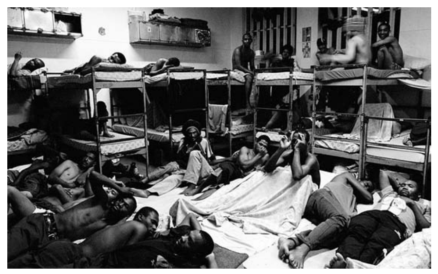
A communal cell in a prison in Cape Town, 2004. From the series of prison photographs, 'Die vier hoeke' ('The four corners') by Mikhael Subotzky.

transferred. Most inmates in the prison are either coloured or black Africans. With the influx of black Africans into the townships and informal settlements of Cape Town throughout the 1980s and 90s, the ratios of black African inmates have also increased.