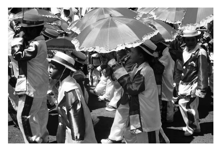
Coons parading through the streets of Cape Town, 2005.