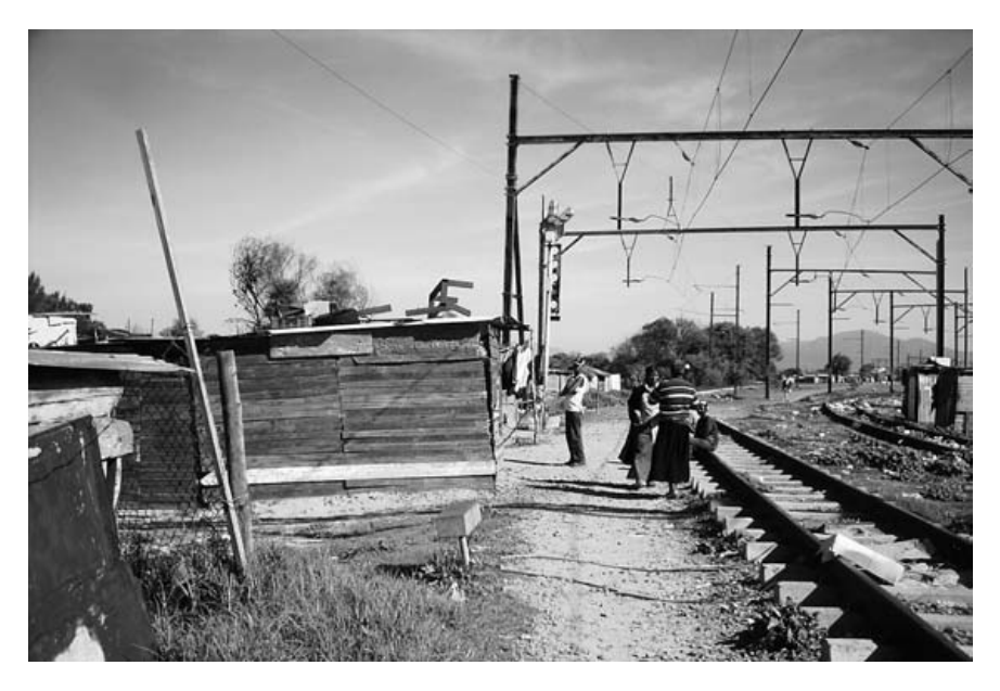
Informal settlement in Cape Town, 2005. The women in the picture are black African Muslims, who live with their families along one of the main metro railway lines going to Cape Town.

was often visited by wealthy South African Indian businessmen parking their Mercedeses on the outskirts of the shack settlement, and being surrounded by hungry black African children to whom packets of white loaves where distributed every Friday on the stated condition that their mothers "had to be Muslims."<sup>21</sup> The interviews were conducted in Xhosa or in English according to the preferences of the interviewee and our perception of the interviewee's level of proficiency in English. Unlike in the other communities in which I worked during my two periods of fieldwork, most interviews were conducted during day time. Since many interviewees were unemployed or worked in the informal sector, this proved unproblematic.