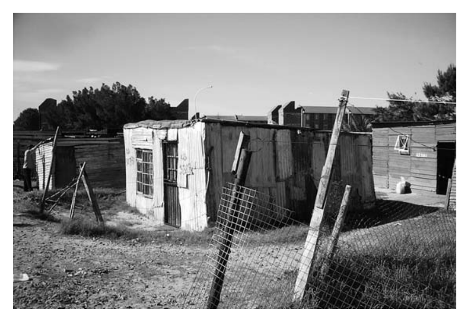
Shack in informal settlement in Cape Town, 2005.