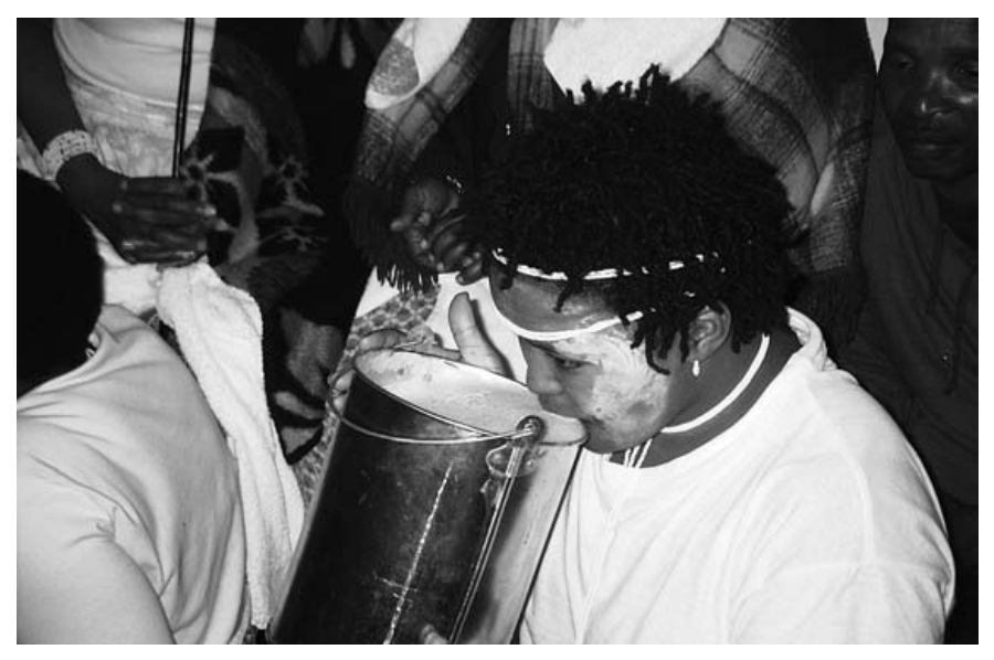
Xhosa igqira initiate drinking umqombothi, Cape Town 2005. The white clothing and headband mark her status.