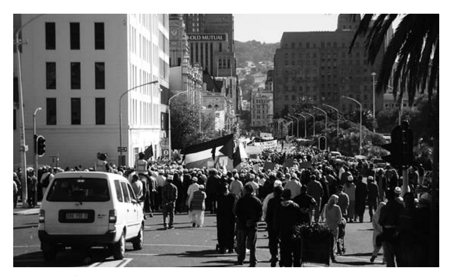
Marching for Palestine on Al-Aqsa Day, Darling Street, Cape Town, 2005