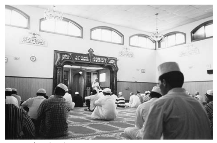
Mosque interior, Cape Town, 2000.