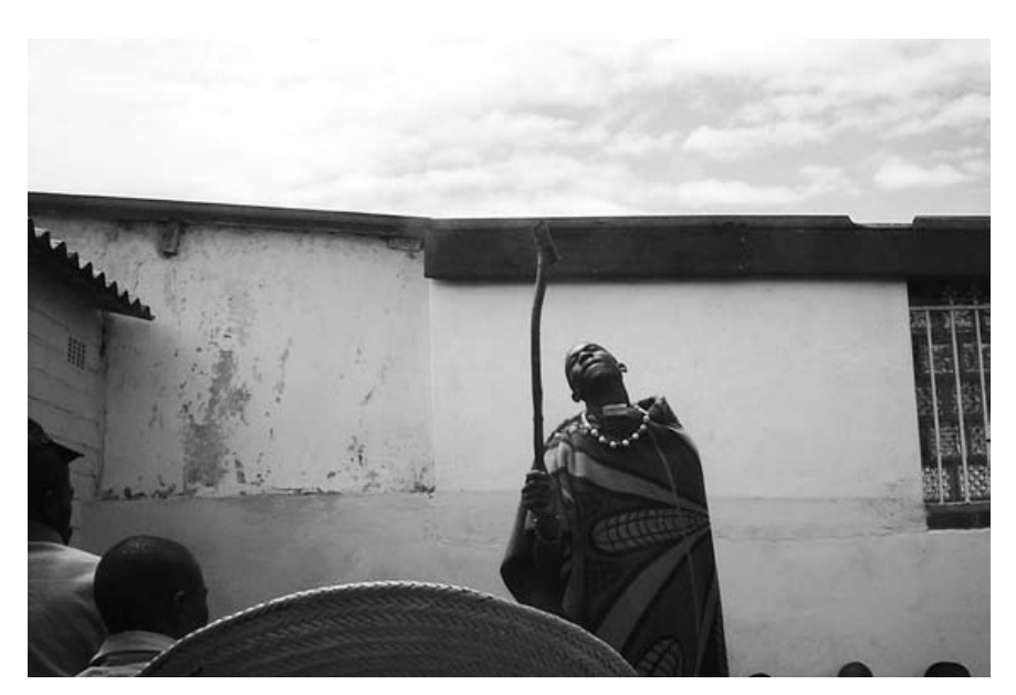
Xhosa initiate addressing the ancestors in ritual language, Cape Town, 2005.

The narratives of Tahseen (Thambeka) and Said (Sipho) point to some of the many routes to conversion to Islam among black Africans in Cape Town. It should be quite clear from their narratives that the appeal of Islam for both of them would seem to have something to do with the circumstances of material deprivation in which they live. Yet it would be tantamount to class-based reductionism to regard their conversions to Islam as a mere reflection of their circumstances, because for both of them, making spiritual sense of their lives and circumstances has also been an important consideration.