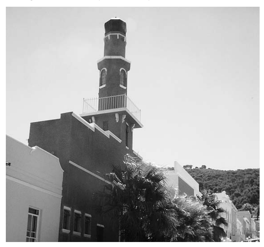
The Auwal Mosque in Cape Town.

early in the morning, and the local residents' association had received complaints from local Muslims about the same yuppies having loud parties and drinking alcohol on the stoeps (small front porches) of their houses.