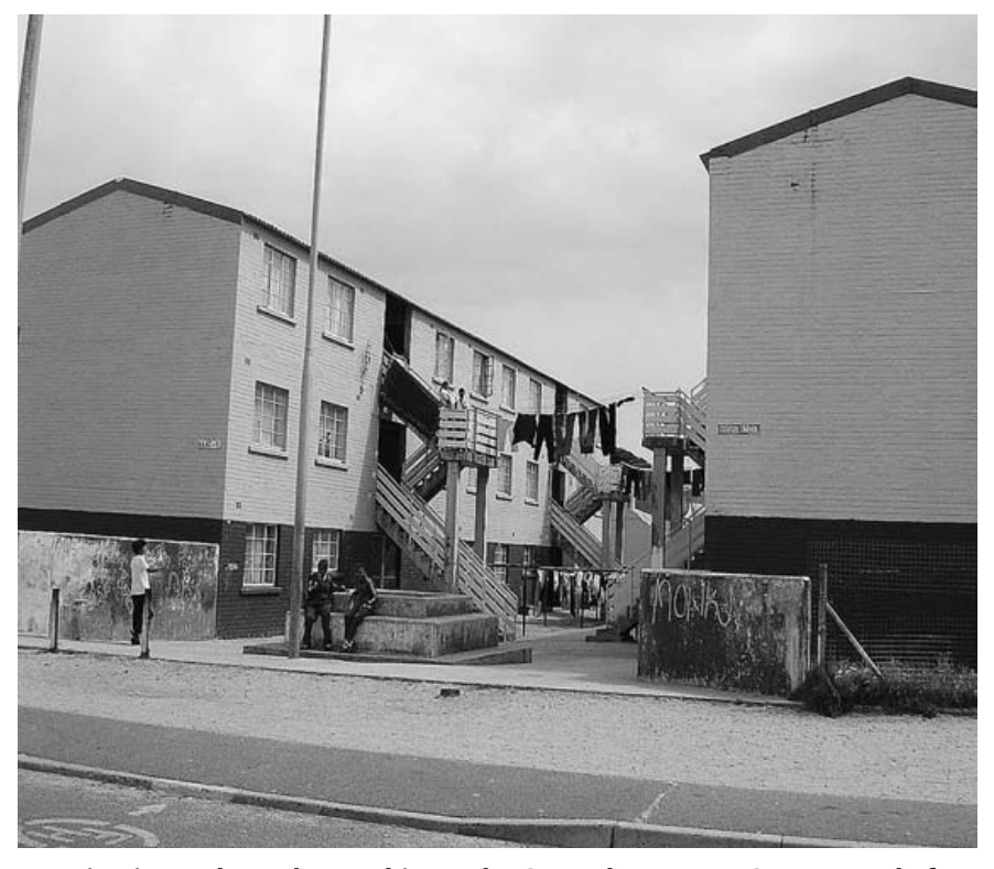
Housing in a coloured township on the Cape Flats, 2006. Constructed after the forced removals under the Group Areas Act in Cape Town in the 1960s and 70s, such sub-standard housing is found in all coloured townships on the Cape Flats.

religious systems in which a male has the unilateral right to marry more than one wife (Seymour-Smith 1986: 228). It is often conflated with, or rendered as, polygamy , which in anthropological usage refers to systems in which both members of both sexes have this right in principle. Polygyny may be restricted , as in the case of Islam, in which a male may contract a maximum of four wives, or unrestricted , as in the case of many African customary systems. The sura or chapter of the Qur'an that permitted polygyny is sura 4:3. According to Islamic traditions, it was revealed after the battle of Uhud (625), in a context in which there were many widows and orphans (Esposito 1983: 20). The conditions for polygyny set down in this sura as well as in sura 4:129 – namely adequate and equal provision for wives and children in polygynous marriages – have generally been interpreted as restricting, rather than encouraging the practice of polygyny among Muslims (Waines 1995: 93-4).