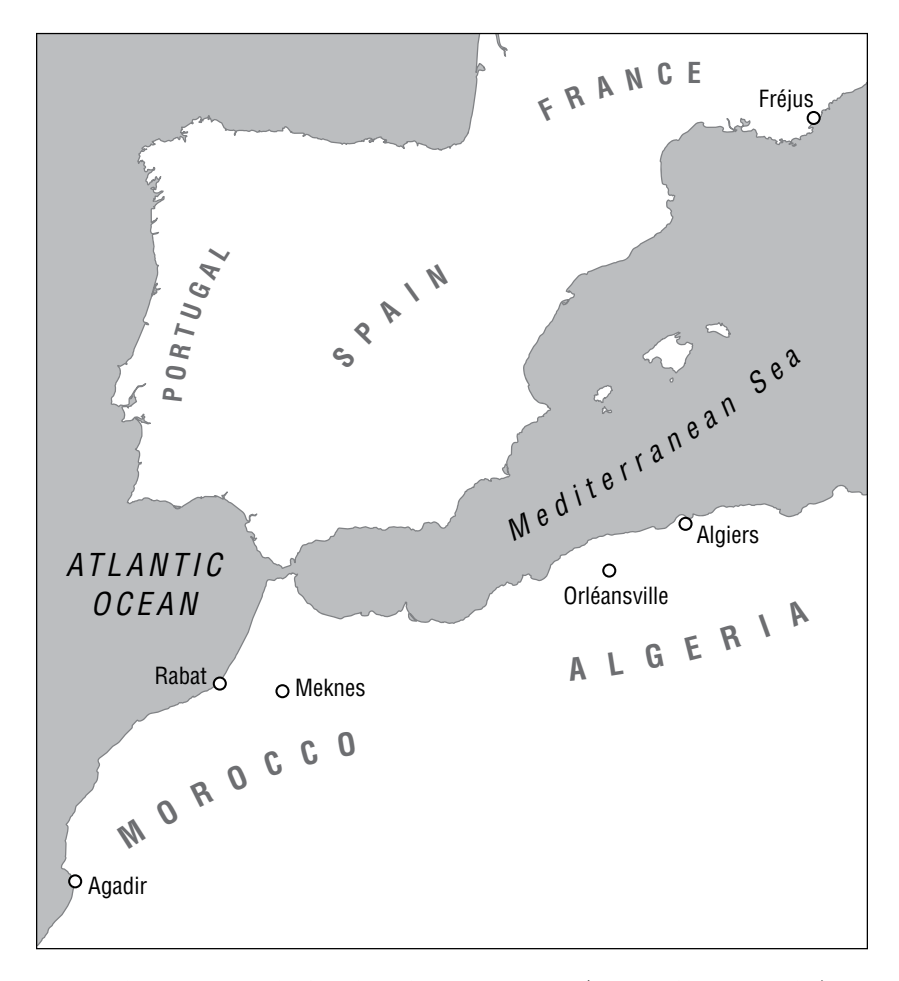
MAP 1. The western Maghreb and southwestern Europe. (Erin Greb Cartography.)

architecture and urbanism of post-disaster reconstruction. This archival record is replete with evidence that the processes of decolonization and disaster were not just related by a coincidental similarity in their effects on human bodies and built environments but that disaster and decolonization impacted each other in multiple ways, as the legacy of colonialism and the politics of decolonization shaped the distribution of harm and the distribution of aid, while the destruction of cities created new landscapes for the imagination and implementation of post-imperial visions.