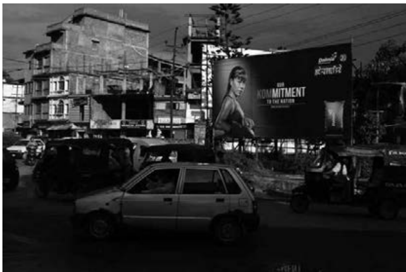
Image 5.1 Billboard featuring Mary Kom, Khoyathong

main commercial areas on advertisements for soap, phone companies, and banks. As with all signs in Imphal, whether featuring a Northeast singer or a Bollywood star, the logo and slogan that one would see elsewhere in India is accompanied entirely or in part by a translation in Meitei and written in the Meitei Mayek script. It is very uncommon to find a sign without Meitei Mayek script somewhere on it, and those without it don't last long and are dismantled by ethno-nationalist groups.