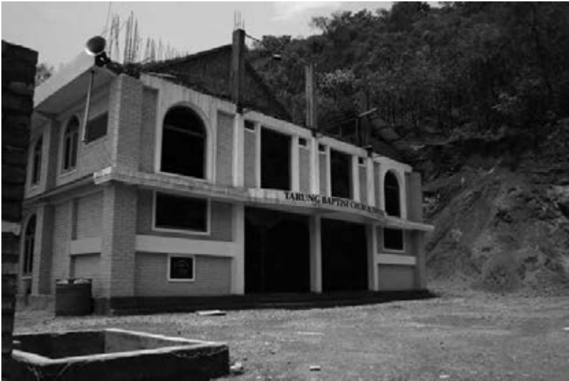
Image 6.2 Baptist church under construction, Langol