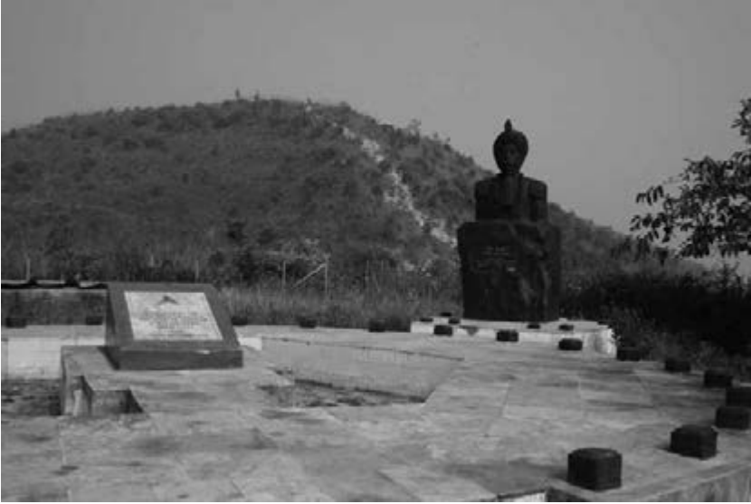
Image 3.3 PLA Memorial at Cheiraoching

Manipur in an era before the splintering of the polity and the ascendancy of hill-valley politics. Ironically it is an organ of the Indian state, the Guwahati High court, which enables families to pay tribute to secessionist relatives without being arrested or harassed by the armed forces. Each year the families go through the process of seeking High Court permission, itself a bureaucratic ritual to enable the memorial ritual. Clearly the state is able to co-opt the Nupi Lal and Irabot for nationalist narratives. The PLA is a line the state cannot cross in its appropriation of resistance.