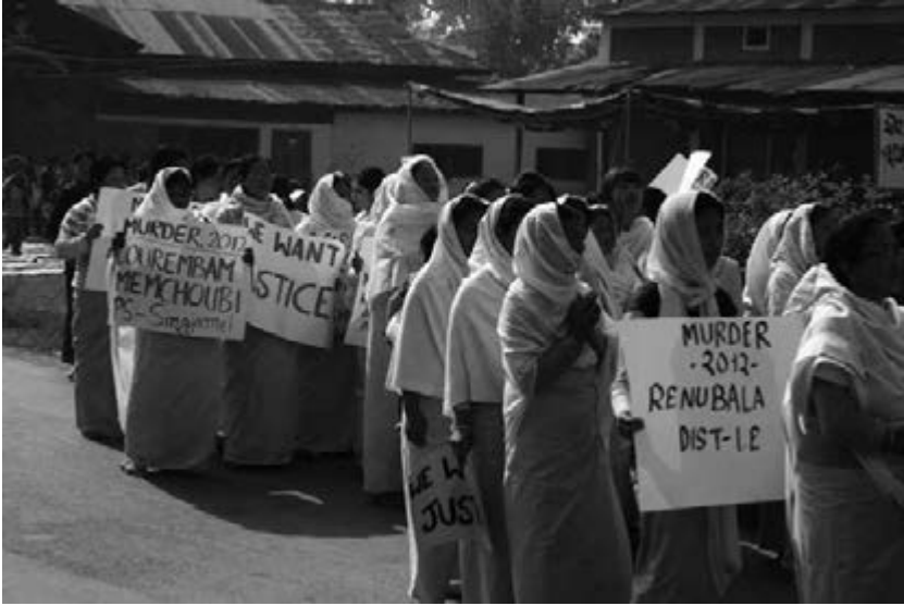
Image 8.1 Start of the rally, Haobam Marak Lourembam Leikai

goods from the border market at Moreh had lost its load as it took the sharp right turn for the final stretch into the city. On both sides of the road red and blue plastic basins, stools, and tied bundles of blankets in plastic covering were scattered. One of the passengers was trying to pick them up while two police spoke to the driver. A man got out from the vehicle behind, itself laden with mattresses, and helped collect the scattered goods and soon the traffic was flowing again.