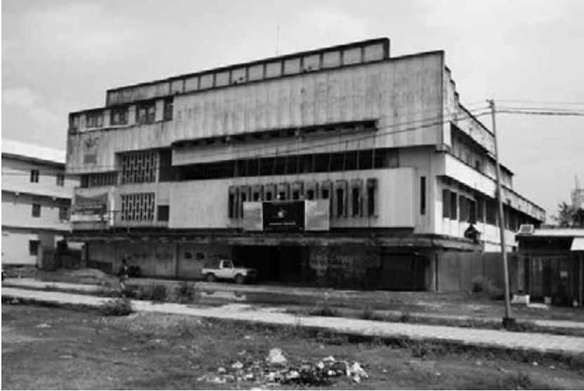
Image 1.1 Shanker Talkies, Lamphelpat