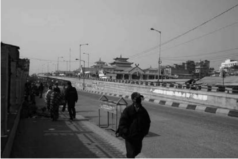
Image 3.2 Bir Tikendrajit Flyover with the Ima Keithel behind

separate market. Cases like this are used to equate the civilian government to the interests of the Meitei population. Many vendors, including Meiteis, tribals, Pangals, and mayangs (non-Manipuris) sell their wares illegally on the pavements, staircases, and ‘gullies’ around the Ima Keithel. This is a popular spot for crackdowns by the Manipur Police and VDF, who clear (or threaten to clear) the area every hour or so with loudspeakers and lathis . Vendors, mostly all women, gather their wares and run to safety around a corner. They are rarely pursued, rather police wait until they return and then extract bribes. This compromise can benefit both sides, though vendors are highly vulnerable to repeated requests each day from different authorities. Unlicensed traders have also occupied other spaces in defiance of the civilian authorities’ attempts at spatial control – including permanent occupation of a nearby market area created to temporarily house licensed traders during the renovation of Ima Keithel.