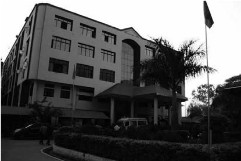
Image 6.1 Shija Hospital, Langol

detailing the early days: terrible roads, no electricity, few patients, fear of ghosts, and scorn from other doctors about going private. Yet he was adamant that it was necessary. The public system was so bad that he had to start a private clinic to provide care to more people and try to keep medical professionals in the state. It was 'enforced'.