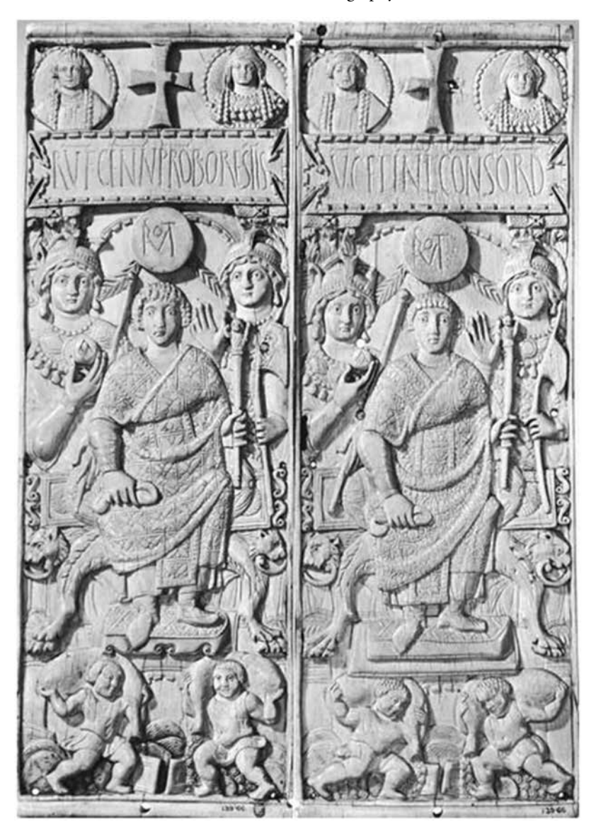
Figure 10.1. Consular diptych of Rufus Gennadius Probus Orestes (530), ivory. Portraits of Athalaric (top left) and Amalasuntha (top right). (Victoria and Albert Museum no. 139-1866.)