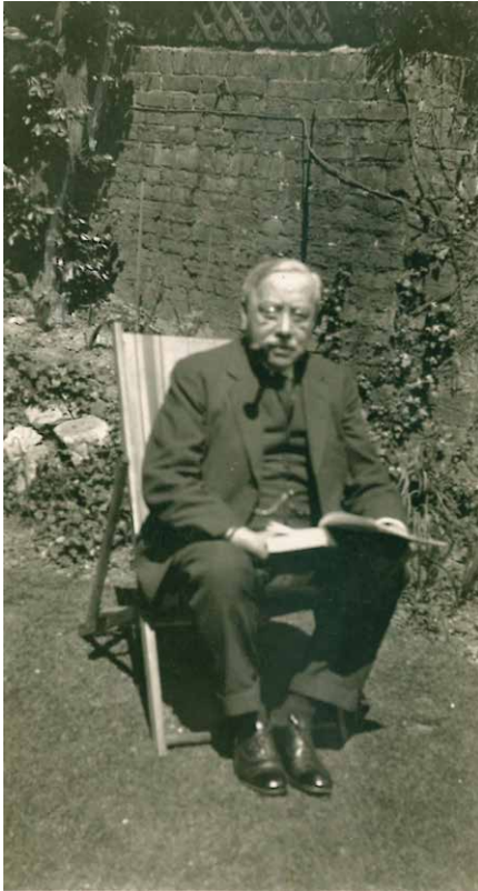
Figure 19.9. Tout in the garden of Oak Hill Park, Hampstead, May 1927.