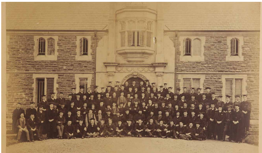
Figure 2.1. Photograph of the staff and students of St. David's College, Lampeter, 1890. Tout is seated in the second row.