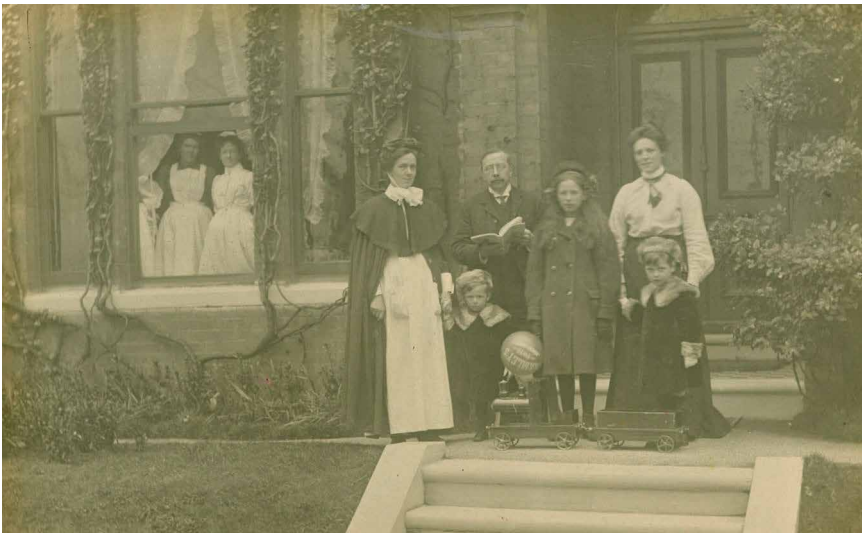
Figure 19.6. Family and servants at Mauldeth Road, Manchester, c.1907.