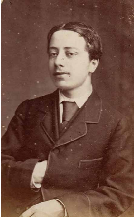
Figure 19.2. Tout at Oxford aged eighteen.

in the year. As Stubbs famously remarked, ‘unus, solus, totus’. He then stayed on in Oxford and over the next two years took a classics or, as it is known, a ‘greats’ degree, securing a second, not a first. A purpose in staying on may have been to compete for fellowships becoming vacant, first at All Souls and then at Brasenose. But he failed to secure either. He did some private tutoring, which presumably brought him some income, and also spent time learning Anglo-Saxon and Icelandic, the latter a particular interest of one of his mentors, York-Powell. 6 We also know that it was during this period that he applied for, and was offered, a civil service job but decided not to accept it.