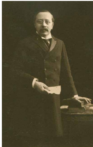
Figure 19.5. Thomas Frederick Tout, c.1897.