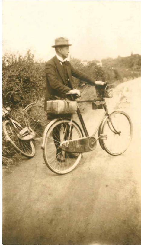
Figure 19.8. Tout with bicycle, c.1920.

The two boys of the family were respectively eight and ten years younger than my mother, too young to have been mobilized for the First World War.