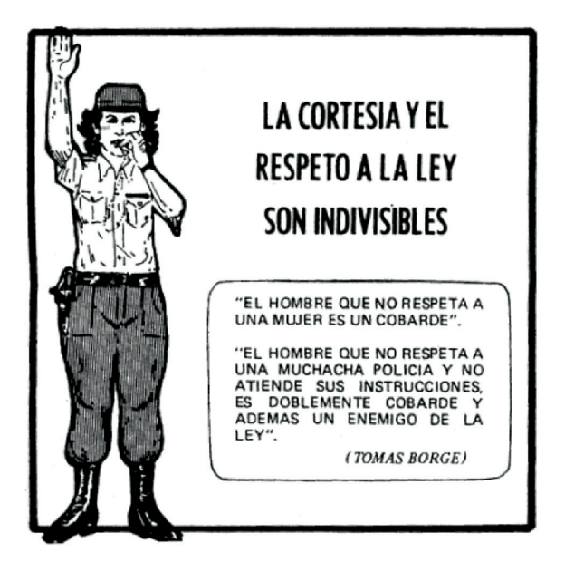
Figure 1.1. 'Courtesy and respect for the law are inseparable'. 'A man who does not respect a woman is a coward. A man who does not respect a young female police officer (una muchacha policía) and does not follow her instructions is twice as cowardly and also an enemy of the law.' (Tomás Borge) (Image: Barricada, 14 Sept. 1980)

and alcoholism as social ills and provided many former prostitutes with new training and employment opportunities.<sup>35</sup>