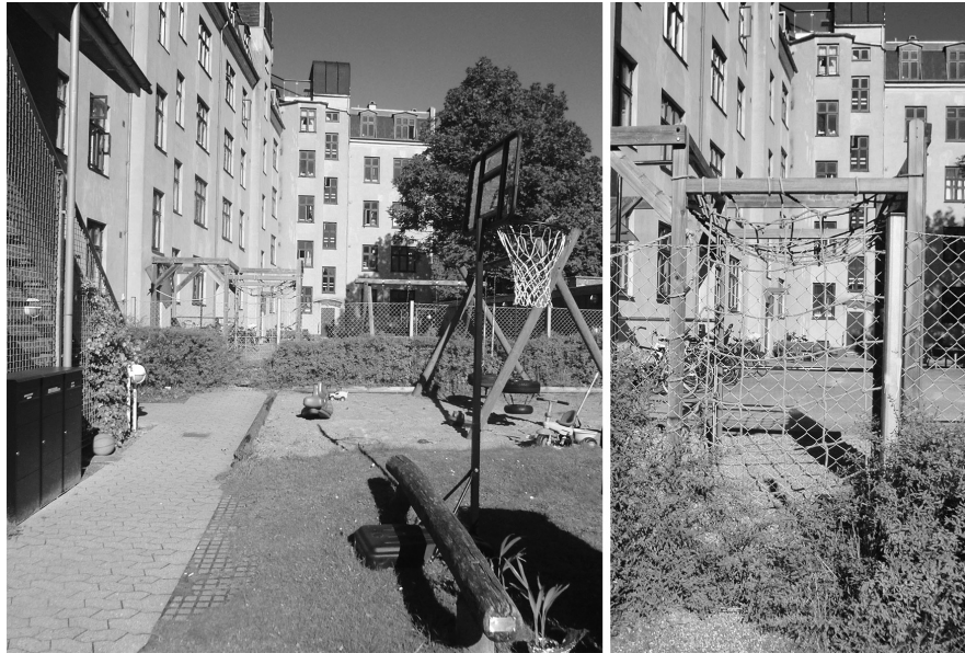
FIGURE 12.4 A Danish courtyard in the city district, where there was formerly an opening in the fence giving children direct access to the neighbouring courtyard

(kick bikes) were sometimes used for trips there, unlike in the other case areas. Most girls there appeared to be allowed less independent mobility than most boys, having to follow stricter routes from school to home and call their parents to ask for permission if they were invited to a friend's house, whereas many boys could wander as they pleased or just leave a message when visiting a friend.