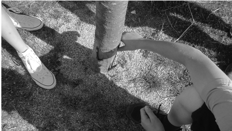
FIGURE 12.5 Swedish urban village. Children showed engagement in the quality and care of the green spaces, looking at a damaged tree

also showed that they cared for the environment and the quality of green space (Figure 12.5). In the other areas, children did not consider it possible to talk to managers they met during the walk. When passing a playground reconstruction in a school yard in the Danish city district, children were interested, but not informed about what was being done. When passing a playground under reconstruction in the Swedish city district, the children only looked at it until the researcher encouraged them to talk to the staff. However, a few children had been in contact with managers, for example when a large grass surface was mown by horse-drawn machinery, which the children liked. Only a couple of times did we observe a dialogue between children and managers, but it was not concerning management or maintenance.