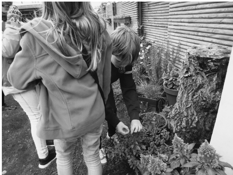
FIGURE 12.2 Tasting and eating fruit, berries and herbs was an attractive activity, particularly in the Swedish and Danish city districts

The curiosity of children was not restricted to viewing and listening, but also included senses of touch, smell and taste. They showed an interest in how to use plant material in their local environments. This was most clearly shown in the focus on growing and particularly in edible plants. During the walks, several tasted and chewed things such as leaves, fruits etc. Many children were aware of edible plants in their surroundings. They pointed out fruit trees, berry bushes, herbs, even shops giving out sweets or buns for free or very cheap. Some children participated in cultivating flowers and vegetables in their gardens and courtyards (Figure 12.2). Others, mainly in the Swedish case areas, talked a lot about fruit trees and picking fruits and berries from trees, which were seen as beautiful and useful for both play and food.