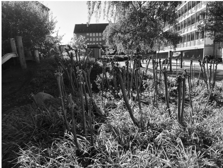
FIGURE 12.3 Danish city district. Before maintenance, this had been an attractive place for playing hide and seek

Children expressed complexity in their views on tidiness and aesthetics, with a clear focus on possibilities for action. They admired beautifully coloured flowers and picked up the colourful petals from the ground and all kinds