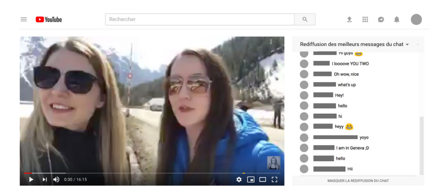
Fig. 6.2 Screenshot of Southern's livestream showing live comments, starting 30 seconds after the beginning of the video. Screenshot, 24 January 2019, YouTube.

Composition of a new goal: At this stage, the interaction of the main actants produces a new actant, actant #4. In technical mediation, a new actant is characterised by a goal that differs from that of previous actants (Latour, 2007). Neither human nor nonhuman goals are set