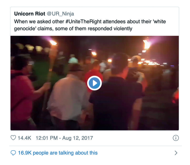
Fig. 9.8 Unicorn Riot, posted to YesYoureRacist Twitter screengrab, "Some of them responded violently", August 13, 2017.

As this example demonstrates, the type of visibility that is produced by DV carries with it the capacity to intervene into a subject's life in materially consequential ways. In this case, correct identification and exposure within the subject's local environment affects his social status and "life chances" (Weber 1978; Giddens 1973, pp. 130–1), namely the ability to maintain employment following the significant publicity received by his (now former) employer concerning his off-work activities, which led to his obligatory resignation.