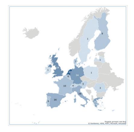
Fig. 11.1 Countries represented by workshop participants (Total N=215) *Three private-sector delegates represented organisations from the United States.

Table 11.1: Sectors represented by workshop participants