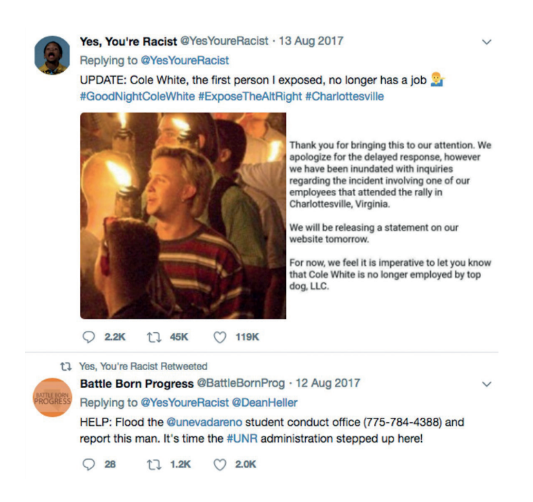
Fig. 9.7 YesYoureRacist Twitter screengrab, "Update", August 13, 2017.

Sociologically, it is important to consider what is presumed to be selfevidently positive about such a development. A clue can be found in the former employer's note that was included in the social media post, next to a photograph from the rally with an identifiable man — presumably the former employee — holding a torch and positioned in the center. After expressing its thanks for "bringing this to our attention", an apology is offered for a "delayed response". By noting it was "inundated with inquiries" regarding its (now former) employee's attendance at the rally, the business makes known to the reader that this "incident" is considered significant by a multitude of unseen members of the public. It is stated that, "We feel it is imperative to let you know that [he] is no longer employed [here]"(Fig. 7).