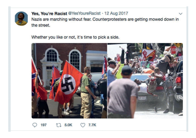
Fig. 9.11 YesYoureRacist Twitter screengrab, "Whether you like it or not, it's time to pick a side", August 12, 2017.

shamed and face the consequences of their actions" (Ahmad, cited in Gass, 2017). In light of the exceptional nature of the events to which they were responding, readers familiar with, and sympathetic to such criticisms about the excesses of online shaming were hereby offered a tacit pass to "shame away".