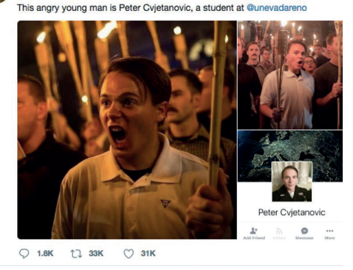
Fig. 9.10 YesYoureRacist Twitter screengrab, "This angry young man", August 12, 2017.

Yes, You're Racist @YesYoureRacist · 12 Aug 2017 Replying to @YesYoureRacist