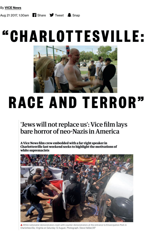
Fig. 9.3 VICE News screengrab, August 21, 2017, https://www.vice.com/en_ca/ article/qvzn8p/vice-news-tonight-full-episode-charlottesville-race-andterror and The Guardian News screengrab, August 16, 2017, https://www. theguardian.com/us-news/2017/aug/16/charlottesville-neo-nazis-vice-news-hbo

backdrop for understanding the significance of the events and most importantly, for present purposes, to understand the nature of the social media response and DV campaign they elicited.