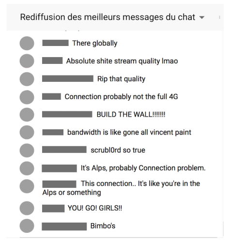
Fig. 6.3 Audience reacting to the bad streaming of Southern's video. Screenshot, 24 January 2019, YouTube.

Obligatory passage point: As the livestreaming continues, new actants appear and disappear (and sometimes reappear) in the frame. The audience is active throughout the live broadcast and sometimes requires Southern's attention, as she has to read the comments posted by her followers and viewers. The mediation, translation and composition processes are characterised by friction, resistance and even opposition between the actants, each of which is potentially capable of putting an end to the livestream. For example, Southern struggles with the bad quality of the stream, which makes it difficult for the audience to follow the message and increases audience discontent, which is expressed numerous times, as in the following screenshot taken directly from YouTube.