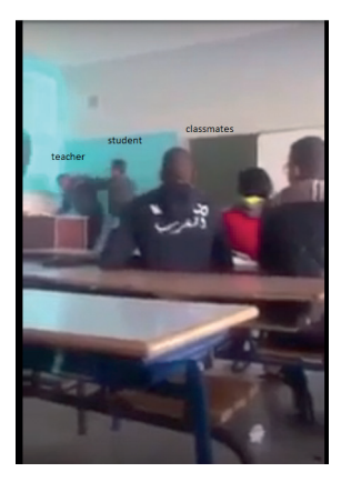
Fig. 7.1 Safi Addakirapress. (2017). Shocking / Student assaults his teacher in Ouarzazate. YouTube, https://www.youtube.com/ watch?v=aC-DjWwDFs8&has_verified=1