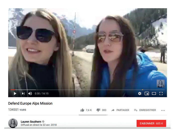
Fig. 6.1 Lauren Southern's livestream interface while she is interviewing Brittany Pettibone. Screenshot, 24 January 2019, YouTube.

symbols. Negative comments largely addressed the bad quality of the broadcast, holding the technical device (the nonhuman actant) responsible.