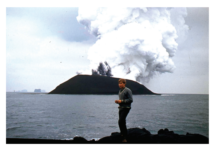
Fig. 9. On Surtsey, in the summer of 1965. Another island is being born nearby.

my friends at the scene picked up an old camera my father had lent me and took a picture of me (fig. 9). The picture encapsulates that connection between Westman Islanders and the islets that have grown up from the seafloor all around us. Standing there on the newly solidified lava, I am innocence itself, a long-legged boy en route to school on the mainland, ready to kick up my heels and try my luck.