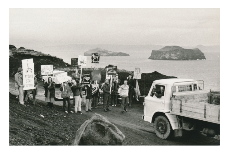
Fig. 11. Demonstration for the protection of Helgafell, November 1971.

I remember vigorous debate in the press about the wounded volcano during my teenage years, when I was home on Heimaey between terms at school. These were the first environmental controversies I encountered, although at the time I didn't think much about them. Grown-ups debated a lot of issues, usually on strict party lines, sometimes arguing for the sake of arguing. The subject was addressed in the spring of 1965 at a meeting of the local Environmental Committee, established in 1957. One of the members had this recorded in the minutes: