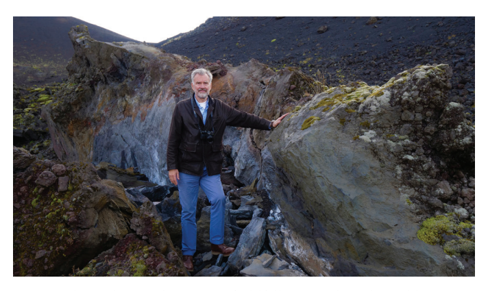
Fig. 30. The author in the crater of Eldfell, 2016.

Lien took the idea well, and there was no going back. I went to Oslo and began an unexpected and enjoyable encounter with volcanic eruptions and the people who live with them (fig. 30).