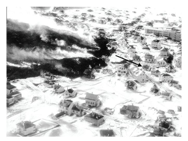
Fig. 20. The advancing lava a week before Bólstaður (shown by arrow) was destroyed.

move, for whatever reason, have a camp or a hearth. Perhaps it would be more correct to say that the environment, the people, and the community are one. Nowadays that unity is constantly being sundered and the concomitant trauma leaves no-one untouched.