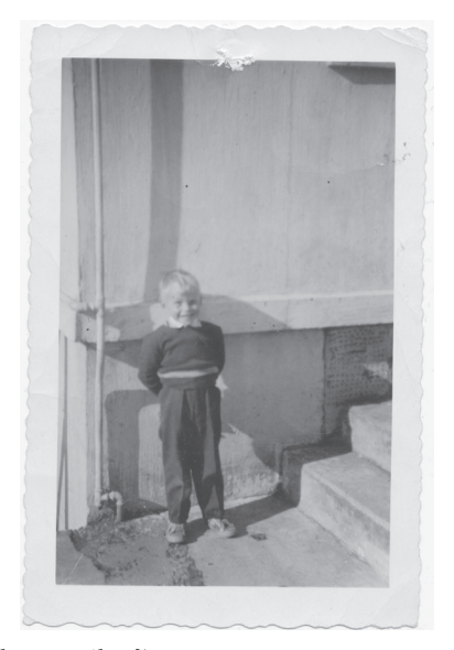
Fig. 2. The author at Bólstaður.

Bólstaður succumbed to glowing lava in the middle of the eruption of 1973. I was not there, nor were my parents or siblings. I was a graduate student in England, while they had moved to the mainland four years before. We were not among the five thousand refugees fleeing the eruption that night. I did not see Bólstaður destroyed. But I came across a picture, the final photo of my birthplace, around the time that I began writing this book. I was startled to see it. When I showed it to my siblings and our mother, they reacted the same way I did: shocked and silent. Nothing has outmatched Nature here. A light westerly breeze carries off the clouds of steam rising from the lava, giving the photographer a clear view of what once was Bólstaður. The advancing lava has already buried one end wall of the house where my mother "birthed me in the bed," as she put it. The other end wall has been thrust forward, and the lava has set the house on fire; flames lick the roof and windows (fig. 3). In the heat, the sheet asbestos of the roof has exploded into white flakes, which