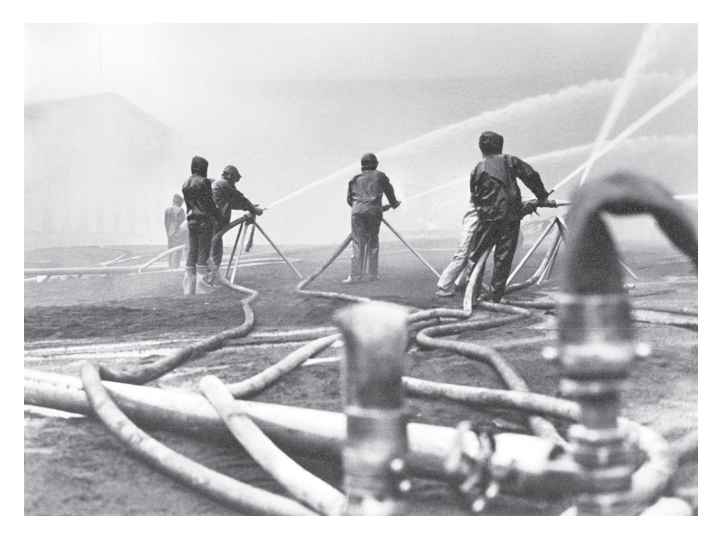
Fig. 19. Retreat from the electrical power station on Tuesday, March 26.

every day. Behind it rose the Heimaklettur cliffs, with their own hipped roof.