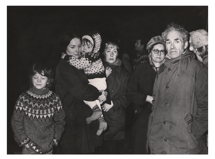
Fig. 15. Evacuees from the Westman Islands arrive in Þorlákshöfn on the morning of January 23, 1973.

the waves, almost side by side and full of people. The two ships' crews fought to get a new tow line between them, but the tow-line broke over and over. Sometimes the people on the wooden Andvari feared that the prow of the steel Hrönn was going to smash into them in the heaving seas. Rubber tires were hung from the gunwales to cushion the impact if the boats were to collide. The crews of the Andvari and Hrönn battled until nine o'clock in the morning, while the two ships made slow headway. Then additional boats came to the rescue from the mainland, and one of them took the Hrönn in tow. The three vessels finally sailed into Porlákshöfn about two in the afternoon. Many passengers were feeling very unwell and shaken after their long sea voyage (fig. 15).