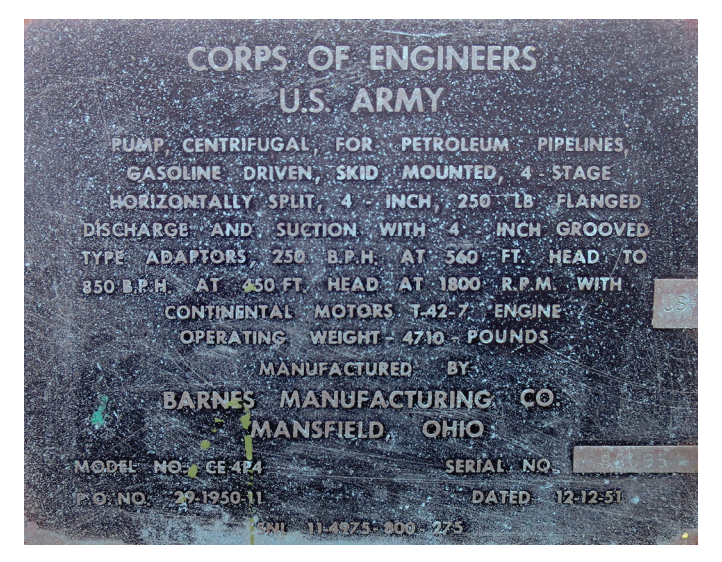
Fig. 23. Manufacturer's specification of pumping gear.

people were sure to defeat that too, like other enemies of progress.