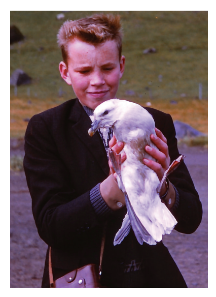
Fig. 8. Nature exploration on Heimaey.

visual perception, but we had no idea about this, and it didn't matter. The rocks punished you if you did not do things right. You tripped, were injured, or fell into the sea. Most kids did fall into the sea now and then, so it was just as well they learned to swim. The sea water in the swimming pool on the Westman Islands was freezing cold, and it was necessary to throw buckets of water over us kids standing on the side, to get us used to it before we were ordered into the pool.