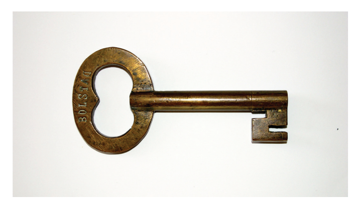
Fig. 28. The key from Bólstaður.

staður — apparently by pure chance. The story of the key is also the story of the eruption. ^{69}