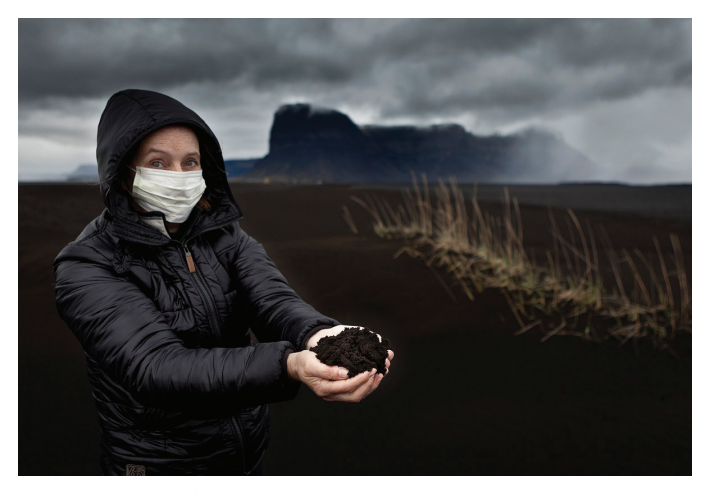
Fig. 4. Under Eyjafjallajökull, 2010.

reached the city at about nine the next morning. The passengers, feeling slightly high after all their wandering, compared notes and admired the morning sun. The surreal journey home from Norway had taken 26 hours, instead of the usual three. A similar experience must have inspired the French comedy film, Eyjafjallajökull (2013), which chronicles the trials of a divorced couple who, when their flights were cancelled, were forced to drive together, willy-nilly, across Europe to get to their daughter's wedding in Greece.