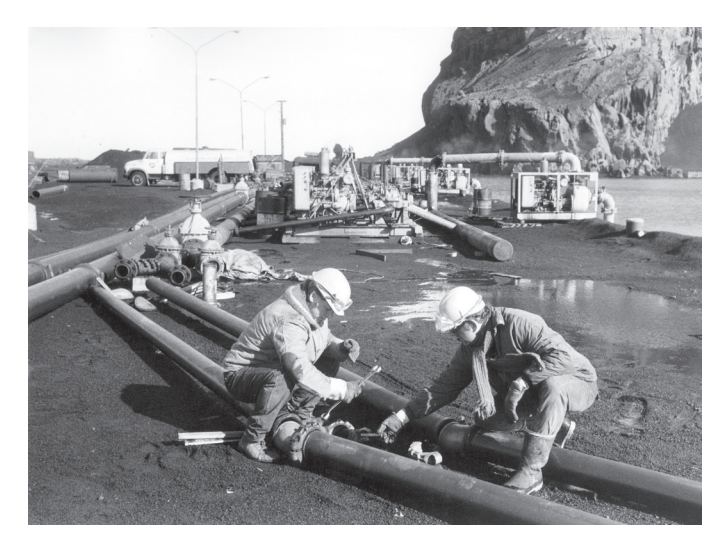
\it Fig.~22 . Pumps and pipes on the harborside.

fire station. Others found rooms at the nearby HB Hotel, or in a fishermen's hostel by the harbor, or at the power station — until it was engulfed in lava. Some sheltered in abandoned houses. For months these were the habitats, places, and ground that the teams striving to save the town and harbor bonded with.