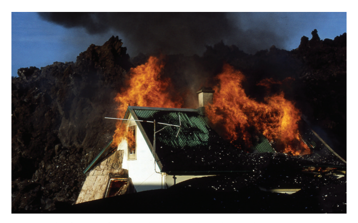
Fig. 3. Bólstaður on fire, April 2, 1973.

flutter down like snow onto the black volcanic ash that has settled around the house.