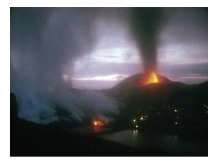
Fig. 26. A "time-lapse" photo taken during the Heimaey eruption.

the battery ran down unexpectedly. We picked five spools and had them scanned, so that we could work with them in digital form. In total, the footage came to about twenty minutes, representing several days of the eruption.