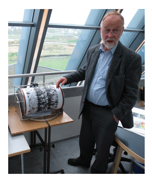
Fig. 10. Geophysicist Páll Einarsson standing next to a seismometer similar to those that he installed before the Heimaey eruption.

to the farm of Skammadalshóll in the south, and was to play a vital part in the story of the Heimaey eruption (fig. 10).