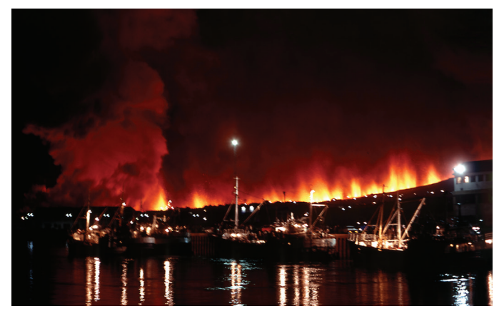
Fig. 14. One of the first photographs of the Heimaey eruption.

about; my forebears fled here, escaping from the Laki eruption, with everything they owned in a single chest."38