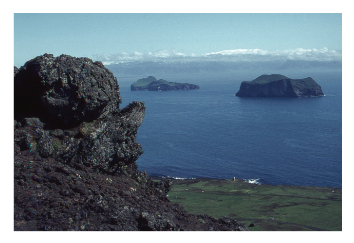
Fig. 13. Shoulder Stone (to the left) in the hills of Helgafell where an eruption broke out on 23 January 1973. Eyjafjallajökull in the background.

place for kids to practice their sprang technique, in preparation for gathering seabirds' eggs from the cliffs when they got older. Around the mid-twentieth century, before the rapidly growing village approached the foot of Helgafell, the dell below Shoulder Stone was a popular campsite for youngsters, at a convenient distance from home. People spoke of a bare patch around here, popular with teenagers in wintry conditions, where natural heat in the earth prevented the snow from settling. Not far from the cliff was a cave, which also attracted youngsters in search of adventure.