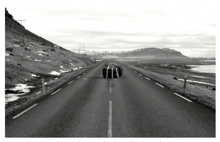
Fig. 5. The stone that spoke at Hali.

The next morning, a couple of hours before the festival was to begin, the news spread that a huge stone had fallen from the mountain above Hali (fig. 5). I rushed to the scene to take photographs. The stone had landed neatly in the middle of the main road, halting traffic in both directions, as if it were making a point — perhaps to urge people to stop and reflect on their life's journey. I was puzzled and a little scared. A small group of travelers had stopped to examine the magnificent stone's colors and shape. Some gently touched it. Some gazed at the mountain above to imagine where it had spent its earlier life and the route it had taken. The Road and Coastal Administration in the nearby village of Höfn had been notified and soon a worker arrived on a tractor to move the stone and clear the remaining debris off the road. He gently nudged the stone off the road and further down the hill towards the ocean, as if to complete its journey. A few months later, the stone was moved to its "home" at Hali for permanent residence.