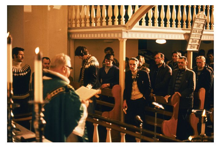
Fig. 18. The "Fire Mass" in Landakirkja, March 22, 1973.

of fleeing or leaving during the service, which I had made slightly longer than usual. Now no length of time spent talking to God could be too long. [...] From this day onwards the fire did no major damage to my parish in this way.<sup>20</sup>