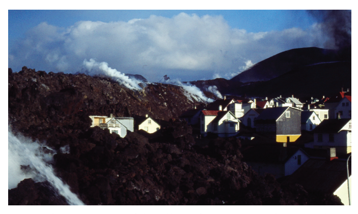
Fig. 21. The eastern part of the village of Heimaey, April 2, 1973.

My mother heard the news that Bólstaður had been consumed from her nephew, Siggi, who was operating a crane as part of the lava-cooling operations. Siggi owned the only crane on the island during the eruption, and he and other men were working night and day, transporting the pipes that carried the cold water out onto the lava, as well as fetching valuable machinery out of danger.