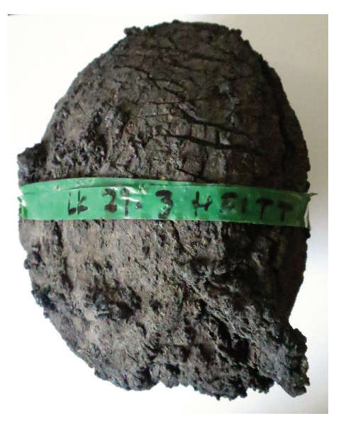
Fig. 27. Bomb, "LK 27.3. HOT," six kilos.