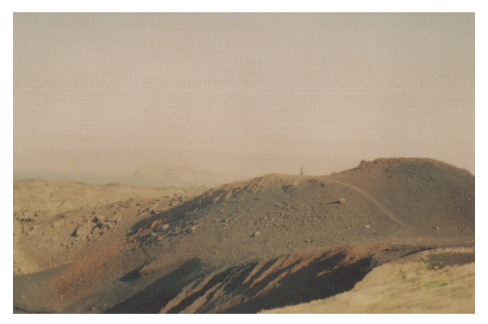
Fig. 29. Ilana Halperin, Eldfell.

several layers of cream, chocolate, and marzipan. The women studied the "tephra layers" of the cake, to the last crumb.