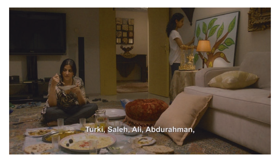
Fig. 4.5 Wadjda: Wadjda's mother eats after the men have left

When Wadjda's father or any object invoking the father is present (such as his scarf, which the mother irons), the house appears as a divided space that determines gender roles, responsibilities, and labour. After preparing dinner for her husband's guests, Wadjda's mother brings the plate to the living room door, knocks, and hides so that the men cannot see her. The long shot placing her in a dark background enclosed within many door frames suggests a segregated and highly divided space. Later, as the men have left the house, the mother sits alone, surrounded by empty plates, eating the food that the men have left (see Fig. 4.5). Meanwhile, Wadjda