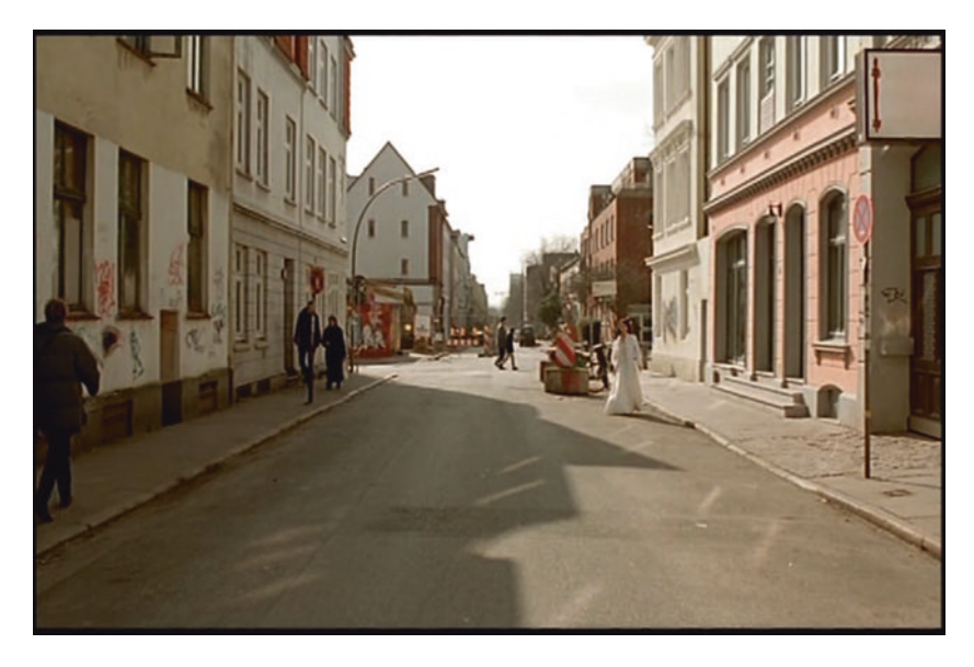
Fig. 5.5 Head-On: Sibel walking in the street

the diegetic environment; the open frame asserts her right to be there as any other body on screen.