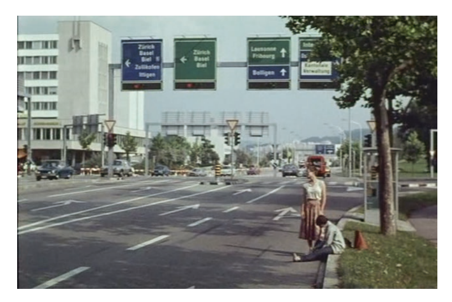
Fig. 2.5 Messidor: The road forms a social border difficult to cross for Jeanne and Marie

quo. The sudden heavy sound of traffic interrupts the silence of the mountains and situates the two hitchhiking women on the side of a busy road (see Fig. 2.5). The dissonant score in a minor key and the long take of the two small bodies framed in a long shot immobile on the side of the road—in opposition to the movement of the cars in the centre of the frame—produce a sense of entrapment, an entrapment into a sexist system, which the urban space embodies and from which it is difficult to escape. Whereas the road forms a visual border on screen, maintaining the women in stasis and on the margins of the public sphere, the mountains become their home on the road, a 'room for themselves'. As we will see in the following chapters, affirmation of wilful women often coincides with establishing and inhabiting one's own space, which manifest both diegetically and aesthetically.