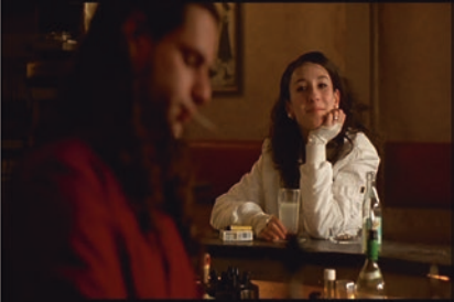
Fig. 5.4 Head-On : Fluid dynamics of power in the cinematic space