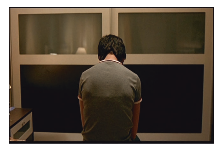
Fig. 5.14 Head-On : Sibel's limitation to freedom expressed through her habitation of cinematic spaces

(2002, 91–92). The cracks that Sibel's wilful body created on screen through eroticism, dance, and abjection seem to have closed down on her, only leaving the sound of the musical box as a hope for generational wilfulness.