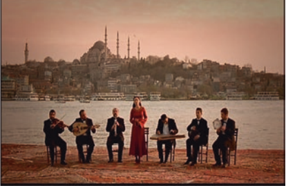
Fig. 5.1 Head-On: Chanting tableaux opening and closing the film