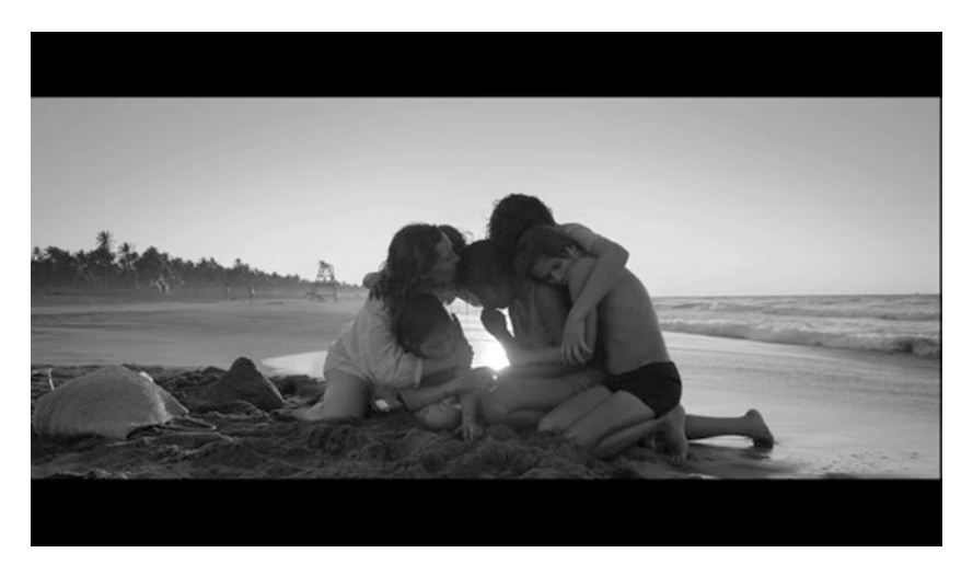
Fig. 6.1 Roma: The family surrounding Cleo as a member of the family