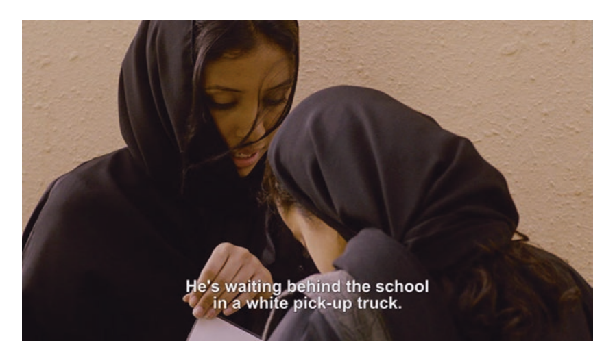
Fig. 4.2 The veil takes a wilful form in Wadjda