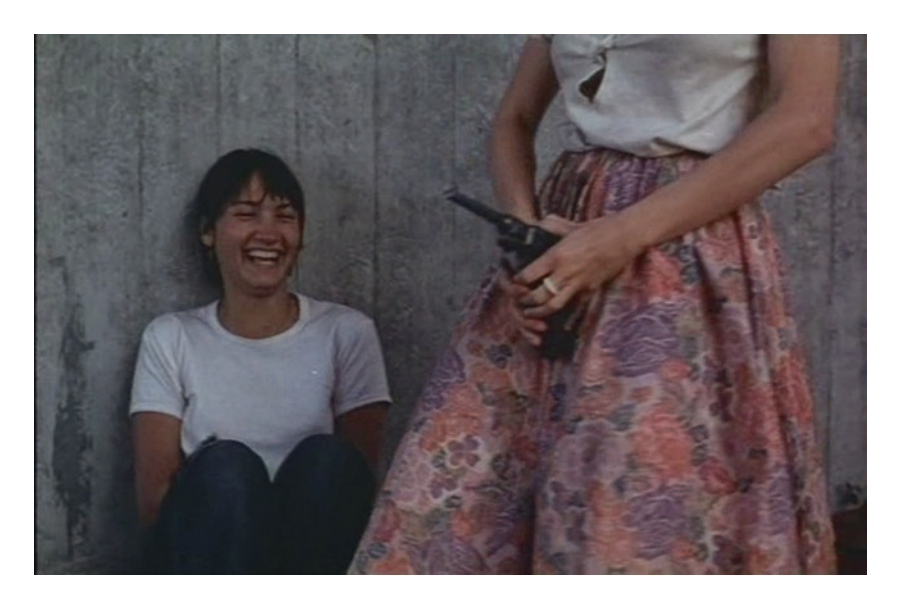
Fig. 2.7 Messidor: A weapon is a penis and vice versa

opposing agents and victims, while also counteracting the gendering of space and myth of the subject as a fixed set of identities.. As explained in the previous chapter, it is the accumulation of being negatively affected in their habitation of 'public' spaces that spurs women's wilful acts. In A Question of Silence (Marleen Gorris 1982), wilfulness is borne out of a casual encounter between women who have suffered from institutionalised forms of sexism and misogyny, which have barred them from inhabiting public spaces as freely as men do. The accentuated sound of the wheels of one woman's shopping trolley and another's pushchair stroller as the two women enter a clothing shop, soon to become a crime scene, brings to the fore the everyday duty they are charged with. The coincidental murder that they commit together in spite of not knowing each other, and the complicit silence of the other women in the shop, points to a societal abuse of women as a collective that eventually results in affirmative resistance. In Messidor, it is also a lack of resources (not having access to their own car) that brings the protagonists together. It is a tiredness of abuse, of not being accommodated—a general accumulation of negative affects—that brings women together and leads to their bonding over wilful acts, which is emphasised in these two films as well as in Butterfly Kiss, Monster, and Frozen River among others.