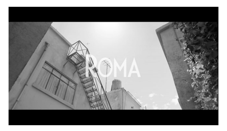
Fig. 6.2 Roma: Ending image after Cleo has left the frame