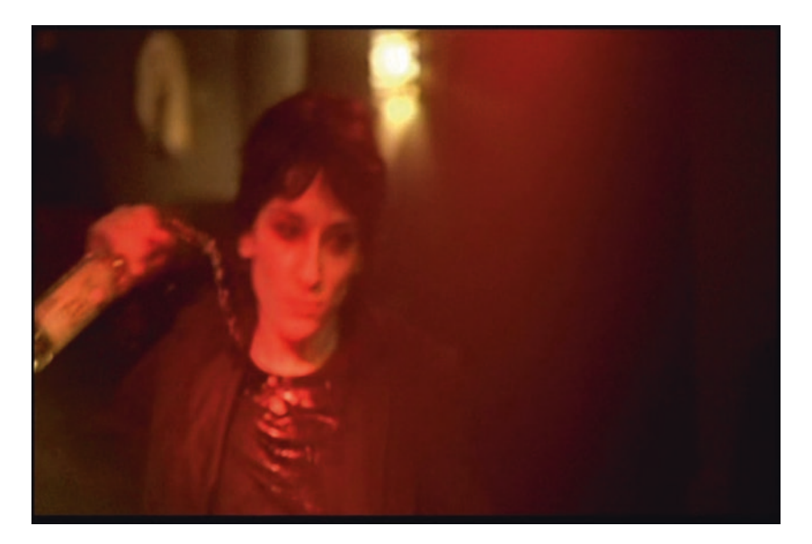
Fig. 5.7 Head-On: Sibel drinks and dances until she falls to the ground, unconscious

In the third dancing sequence that closes Sibel's punk life, she drinks and dances frantically in a bar in Istanbul to the point of collapse. While Sibel drinks and dances, the song 'I Feel You' by Depeche Mode plays, loudly and extra-diegetically, indicating Sibel's own self-destructiveness and anticipating the ultimate trajectory of her life ('I Feel You' also plays when Cahit drives his car into a wall at the beginning of the film). The lyrics of the song correlate with the diegesis of the film, in its suggested replacement of religion (the Muslim religion of Sibel's family) with sex and drugs ('you take me to and lead me through oblivion'). As Sibel drinks and whirls around, the handheld camera follows her movement in close-up, making a constant effort to reframe her in the middle, and even 'loses' her for a moment. The editing of the scene, through multiple cuts and dissolves of short takes of Sibel in close-up, condense the passing time while giving form to Sibel's wilful liminal subject. If the camera's framing of Sibel obeys the cinematic narrative conventions of keeping the main character in the frame—filmically integral to social norms—the disjointed editing gives shape to a resistance to integrate a normative frame of