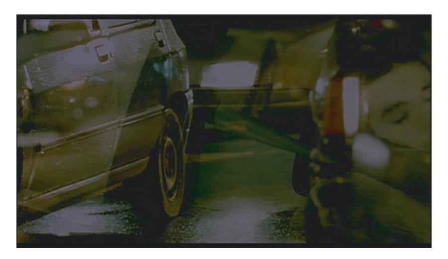
Fig. 3.5 Vendredi soir: Claire Denis' ballet of cars

camera films the lights of slowly moving cars in a close-up with a telephoto lens, which reduces the depth of field and creates a surreal, ethereal atmosphere—non-anchored in real space. The classical music, tight shots, shallow depth of field, and very slow movements (of the camera and the cars themselves) portray a ballet of cars , transforming modern purposeful objects of transport into poetic abstractions. By recurrently filming smoke and steam in close-ups, Denis reinforces the magical dimension of the scene by giving cars a 'poetic' texture.