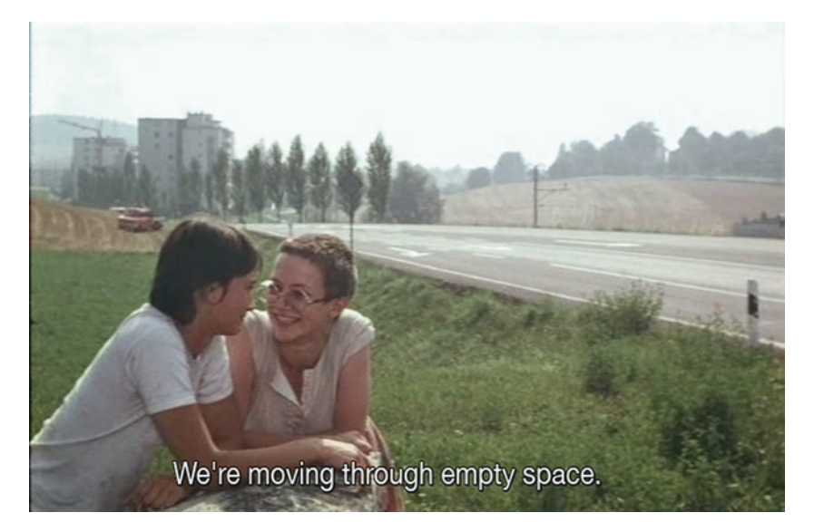
Fig. 2.6 Messidor: 'We're moving through empty space'

lack of frequent action, and numerous ellipses emphasise the long-lasting persistence of the protagonists against the power-geometries they have to face. Scenes often start in medias res (such as in Homer's The Odyssey): in the middle of conversations, with a response to an unheard question, or by framing a landscape in a fixed shot that the moving bodies of the protagonists interrupt. The lack of chronology and cartography of the women's journey creates a sense of affective duration, not limited by time and space but expandable across times and spaces through how one is affected and affects others. The wilful affects of the protagonists are demonstrated on screen as disobedience, going against the flow, and occupying space. When Jeanne and Marie walk on the side of the road, the camera films them in tracking shots from right to left, walking against the traffic that flows in a conventionally forward direction from left to right on the screen. As they philosophically reflect on their own movement 'in empty space... [becoming] interesting', their paused bodies and their voices take the foreground while the passing cars and the sounds of traffic are relegated to the background (see Fig. 2.6). Their bodies taking space on screen give form to wilful affects, as a refusal to go with the flow of the patriarchal capitalist system. The aesthetic choices of this scene show how their paused