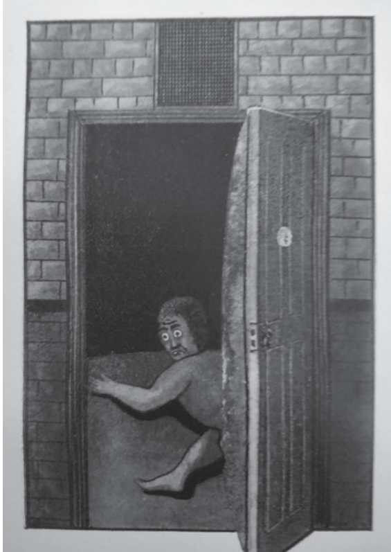
Fig. 3.5 James Scott’s drawing of a seclusion room (James Scott, Sane in Asylum Walls [London: Fowler Wright, 1931], facing p. 102) (Copyright: owner sought but not found)