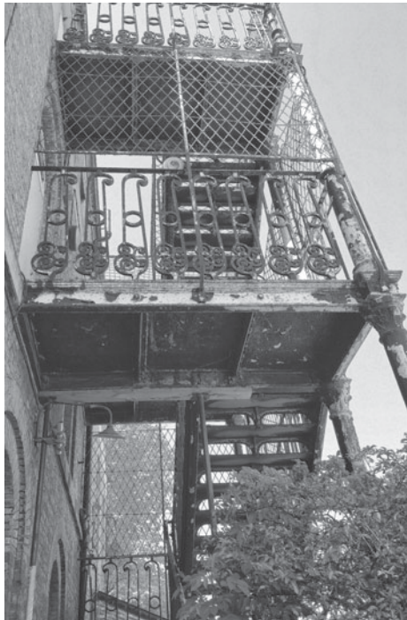
Fig. 2.2 Emergency staircase at Hanwell