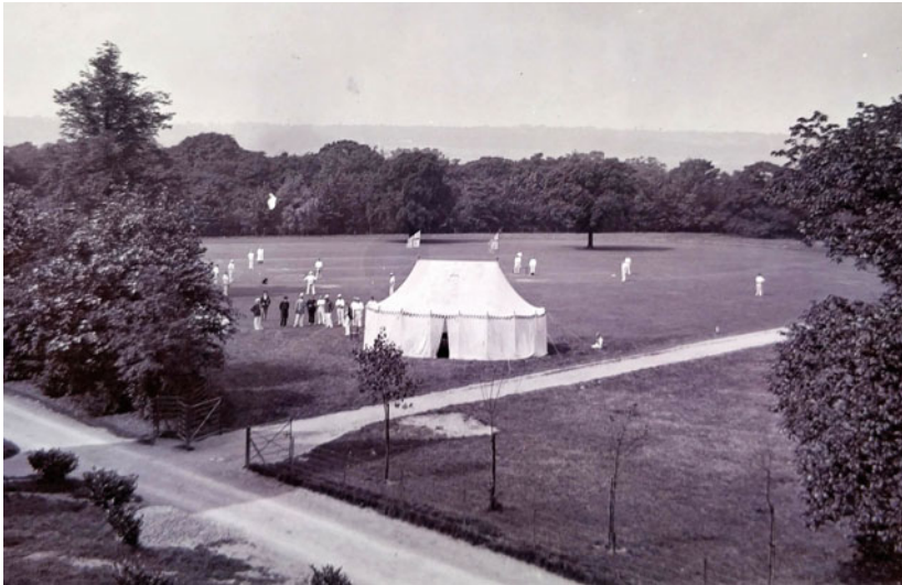
Fig. 5.1 Cricket pitch at Claybury, before 1917

Land usually used for recreation in asylums (Fig. 5.1) was ploughed