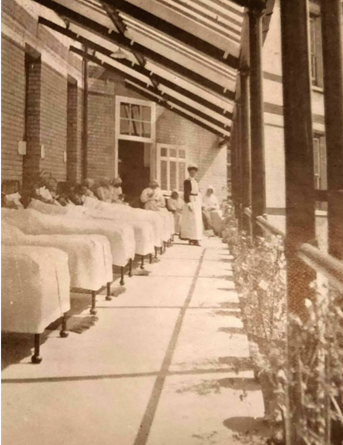
Fig. 7.1 Verandah for nursing patients with tuberculosis in the open air, at Horton Asylum. Given to Mott by the medical superintendent. Photographer unknown (Mott, “Tuberculosis in London County Asylums”: opposite, p. 116)

during the war, the need to regularly weigh patients, as Crookshank and others had advised, but implementation varied. 35 Also in the war years, most experts recommended physical examination rather than X-ray screening to detect lung tuberculosis, but with medical staff shortages the standard three-monthly physical health checks for patients were abandoned, with the risk of overlooking new or emerging cases. 36