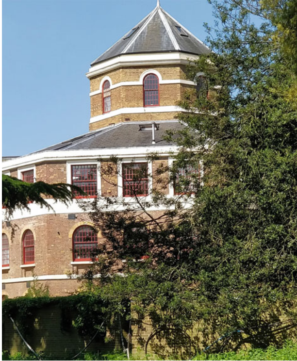
Fig. 1.3 Hanwell Asylum (Photograph by author, 2017)

standards within them. These varied despite the Lunacy Act 1890. The Act mandated legal, financial and organisational structures, and the hierarchy of authority, oversight and regulation stemming from the central government body, the Commissioners in Lunacy until 1914 and the Board of Control (“the Board”) thereafter, which had responsibility for civilian asylums in England and Wales. The rigid, legalistic approach of the Lunacy Act also reflected increased societal and legal concerns about public safety, ensuring detention of “dangerous” lunatics while preventing wrongful incarceration of “sane” people. Beyond these requirements, the public generally distanced themselves from happenings inside the asylums, their perspectives reinforced by novels about lunacy