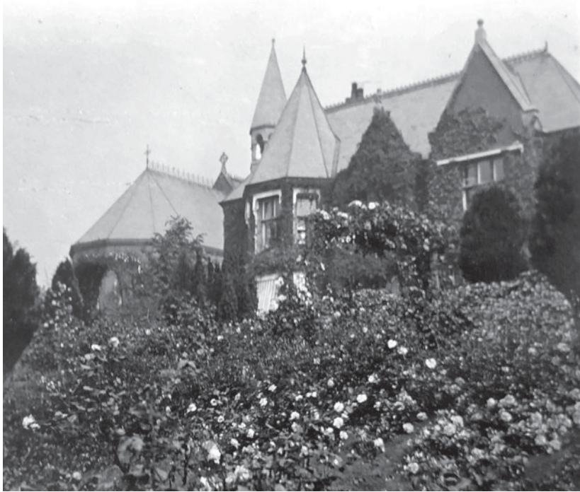
Fig. 4.1 The medical superintendent's house at Claybury, photographed from the rose garden, before 1917. The chapel is behind the house, to the left

of things as they are,' not of 'things as they should be'", in the words of Montagu Lomax, whose book about his wartime asylum work subsequently triggered the Cobb Inquiry into asylum practices. 58 With the risk of being dismissed for criticising the authorities, Lomax was aware that he had to take a difficult ethical decision: either to complain and risk being dismissed, or to continue to observe while part of the asylum system for long enough to write about his experiences at a later date. 59