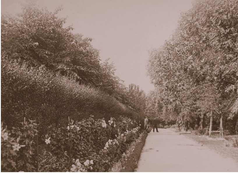
Fig. 6.1 Patients' garden at Claybury, before 1917

of the sexes". 49 Occasionally a sexual assault occurred, but those reported in minutes identified staff as perpetrators, not patients. One male staff member was sentenced to six months hard labour for a sexual assault on a woman patient. 50 This sort of offence reinforced the asylum authorities' determination to "prevent the association of the sexes" except under "complete and careful supervision". 51