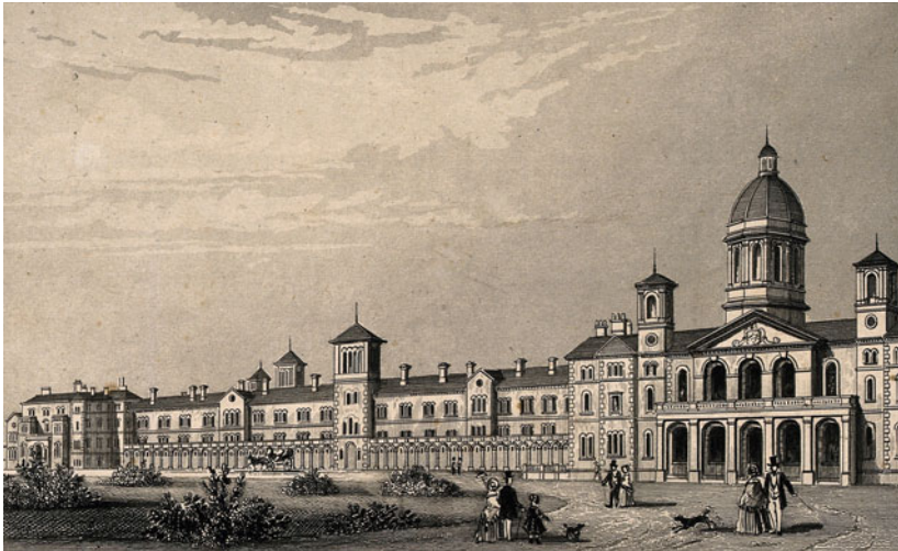
Fig. 1.2 Colney Hatch Lunatic Asylum, Southgate, Middlesex: panoramic view, undated

The architecture of the asylums, the palatial façade of Colney Hatch (Fig. 1.2) or the prison-like central towers at Hanwell (Fig. 1.3) were emblematic of the diversity of the asylums in terms of practices and