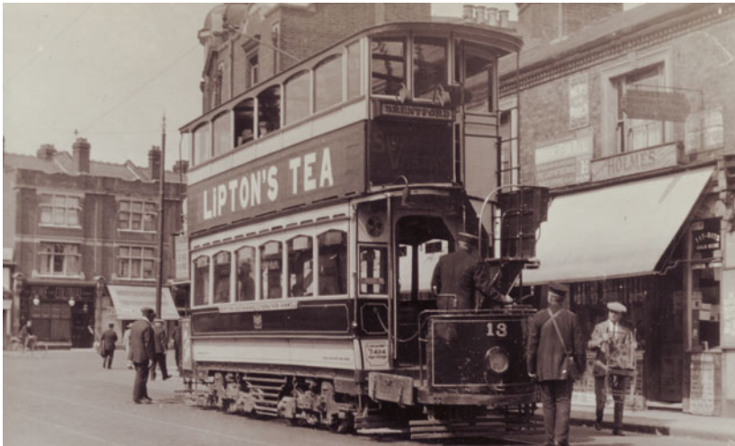
Fig. 6.2 Tram, a few minutes’ walk from Hanwell Asylum c.1910 (Public domain), https://en.wikipedia.org/wiki/Hanwell#/media/File:Tram_in_hanwell_boston_road.JPG

Since asylum activities were part of treatment, Mercier cautioned against punishing patients by preventing them from joining in, as participant, performer or spectator. 55 On the other hand, activities were used as rewards, such as tram outings to Uxbridge for working patients at Hanwell (Fig. 6.2). 56 Entertainment programmes continued as usual in the early months of the war, including the annual patients’ fancy dress ball at Claybury and a Vaudeville show at Colney Hatch. By Christmas 1914, celebrations faced disruption because of night-time lighting restrictions and risk of cancelation at short notice in the event of an air raid