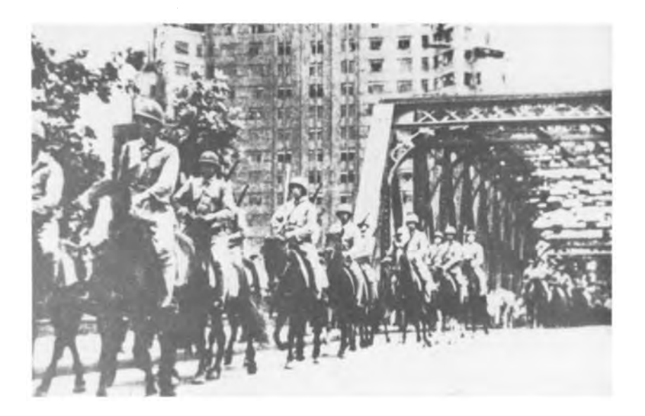
PLA troops entering Shanghai, 25 May 1949.