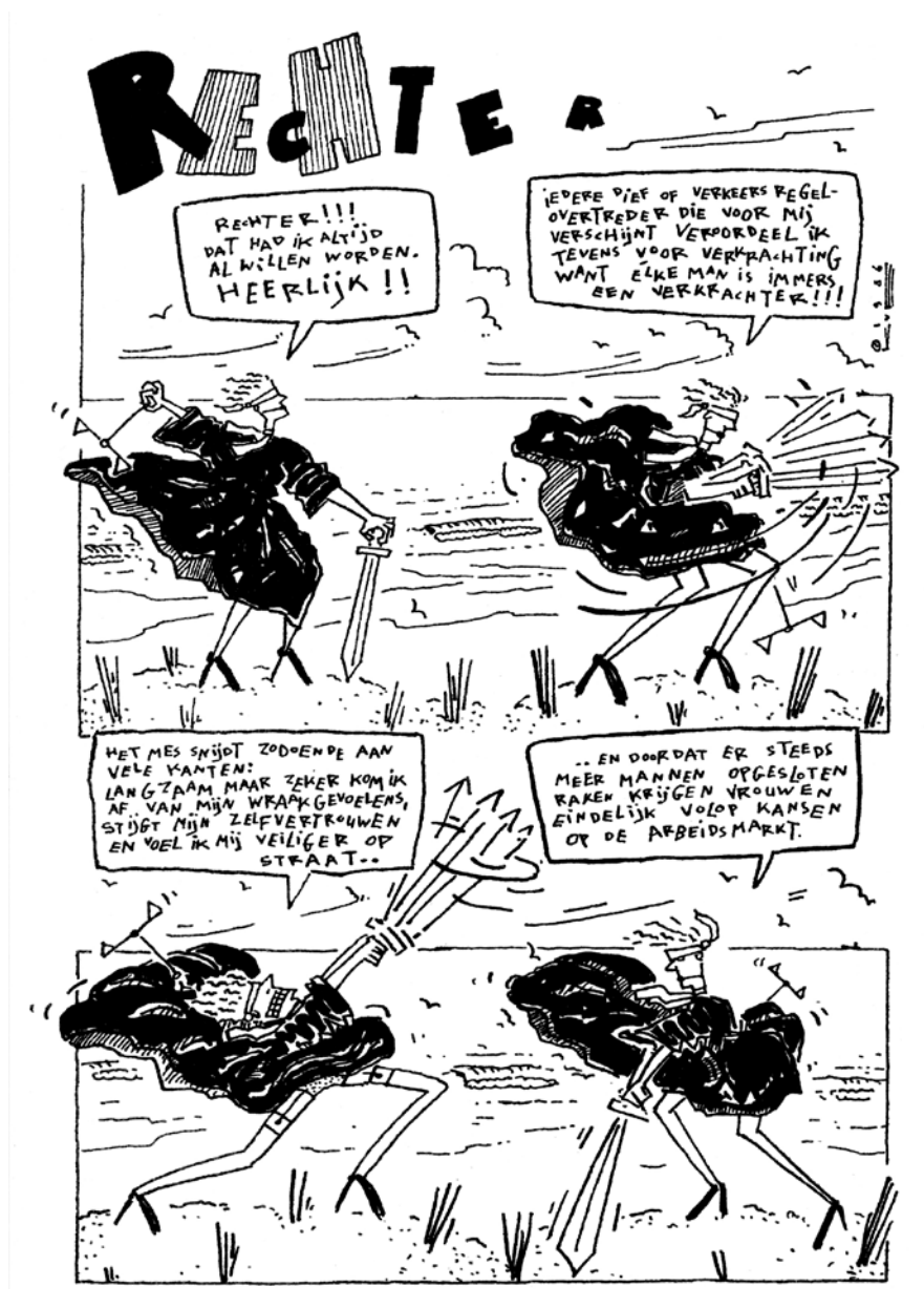
FIGURE 2 Rechter [judge]. "Judge!!! I've always wanted to be a judge!! Lovely!!" "All thieves and road traffic offenders who appear before me will be sentenced for rape too, because every man is a rapist!!!" "Slowly, this will satisfy my feelings of revenge, increase my self-confidence, and make me feel safer on the streets ..." "... and since an increasing number of men will spend time in prison, there will finally be far more employment opportunities for women" [translation by author], Elderen, van (2009, 24). Courtesy of caricaturist Karin van Elderen.