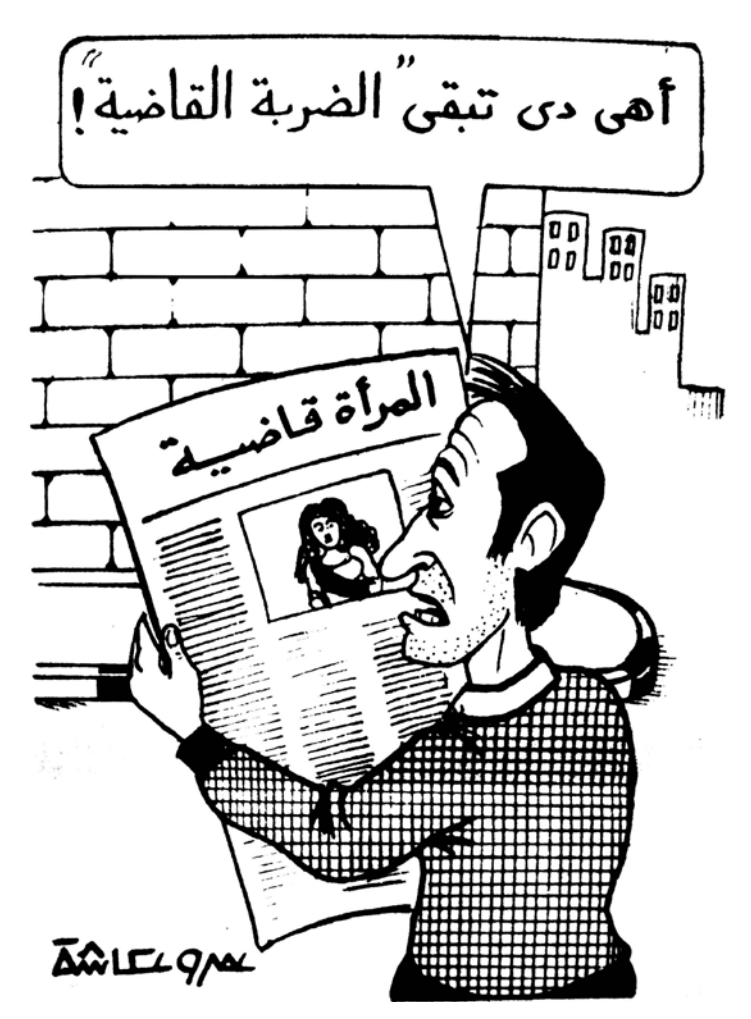
FIGURE 3 Women Judges. When the man reads in the newspaper that women have become judges, he says: "Now this is the blow of the woman judge" [this will be the final blow to men, personal communication Amr Okasha, September 29, 2014]. Amr Okasha, al-Wafd, June 19, 1994.

as judges in the Family Courts, they should be barred from entering the criminal law courts (e.g. al Jazeera Net 2007). A survey conducted during a general assembly meeting in the Judges' Club in November 2005 indicated that 85 percent of the judges did not accept the appointment of women to the civil or