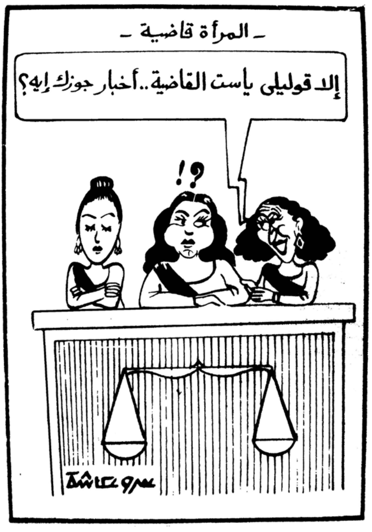
FIGURE 1 The Woman Judge. The judge on the right asks the presiding judge: "Come on, tell me, madam judge, how is your husband doing?" Al-Wafd, June 17, 1994. Courtesy of Amr Okasha, caricaturist, political writer, and deputy manager of al-Wafd newspaper.

of their husbands, and where the presence of female judges has long since become a common sight, women's capacity to adjudicate objectively is still put into question. Skeptics frequently make references to their alleged soft and emotional nature to debase women's credibility within the legal system. Hence, the issue of women's authority in the courthouse, on the one hand, and