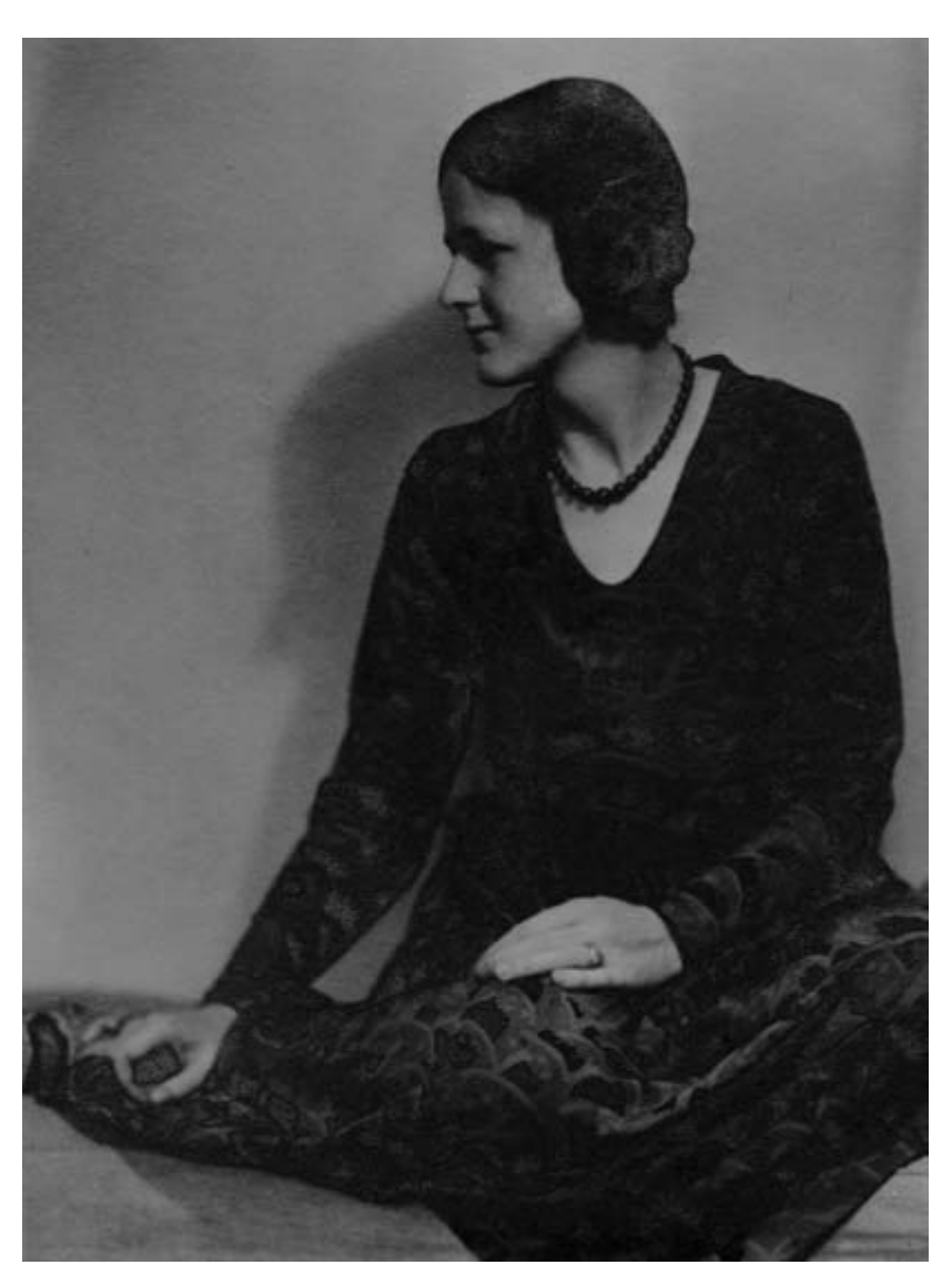
Joan Robinson.