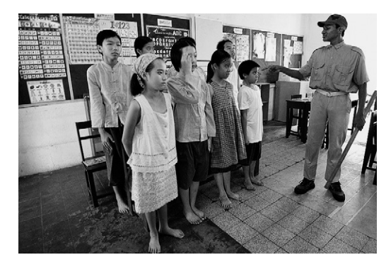
Figure 1: At the Japanese School, a scene from Ronggeng Merdeka . Photo by Tan Sooi Beng, 2007.

After collecting data from the communities, the participants came together to discuss their findings; they looked for ways to combine their interviews, sounds and movements with the music and theatre skills they had acquired to create short musical skits. The musical plays emphasized accessibility to all and sundry, as the content and forms were grounded on the lives of the local people and street performance genres belonging to the various ethnic communities. Ronggeng Merdeka highlighted the hardships encountered by the ronggeng performers of different ethnicities during the Japanese Occupation in Penang and the period leading to Independence. The multiethnic young participants in this play portrayed the challenges that children faced in the Japanese school that they had to attend.