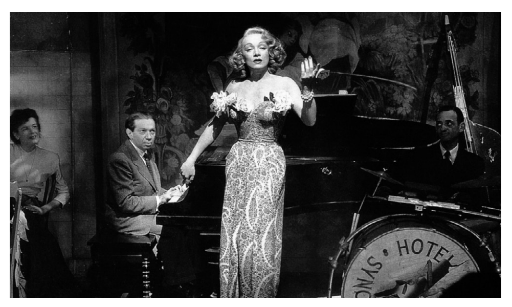
Figure 5: Marlene Dietrich and Friedrich Holländer at the Hotel Eden, A Foreign Affair , film directed by Billy Wilder.

counterpoint between utopia and dystopia, conditions both juxtaposed and inverted by the cabaretesque. It is this counterpoint that stages the mise en scène for Friedrich Holländer and Billy Wilder (1906–2002) in their 1948 film, A Foreign Affair , which provided the basis for another recording project of the New Budapest Orpheum Society. Filmed in part in the rubble of post-World War II Berlin, A Foreign Affair blurs the cinematic boundaries between documentary film and feature-length film. The cruel realities of war and destruction lie in "the ruins of Berlin," but the film itself weaves comedy and film noir together. Billy Wilder and Friedrich Holländer returned to Berlin from American exile once again to play their pre-war roles as film director and cabaretiste. The music mixes the diegetic and the non-diegetic in complex ways. Holländer is playing, but so are Marlene Dietrich and Holländer's fellow musicians in the Hotel Eden Syncopators on the cabaret stage, mirroring the house band in Der blaue Engel eighteen years before, on the eve of the Shoah (figure 5).