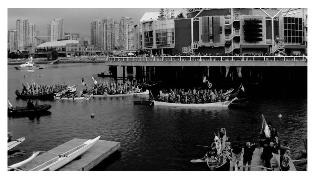
Figure 1: First Nations Canoe Gathering, Vancouver 2013.

Performances assert the sovereignty of their own legal traditions, including clan organization, and confirm ownership of the land in traditional Indigenous contexts, but also in Indigenous-settler contexts.<sup>19</sup>