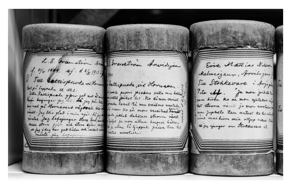
Figure 2: Wax cylinders from the Tirén collection.

and proved to be an excellent tool for collecting folk music. The reasons behind Andersson's standpoint are difficult to understand—possibly he would have liked to ensure the opportunity to "correct" errors in the performances of the music when he transcribed it. In order to avoid others interfering in the interpretation of the material, he might have thought that it was best not to have recordings as a primary source that could be discussed. But there are also other reasons why the Tirén collection was not included in the Folk Music Commission's collection. One was of course the issue of whether or not this was really "Swedish culture." At that time, the Sami were seen as an example of "the culture of others." The location of the joik recordings at the Natural History Museum's Ethnographic Department underlines this. The joiks became part of the presentation of "primitive music" from different parts of the world—mainly from Africa and Australia.