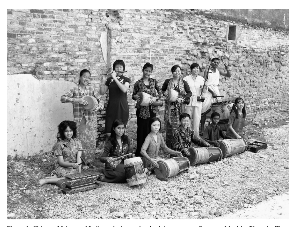
Figure 2: Chinese, Malays and Indians playing each other's instruments, Ronggeng Merdeka . Photo by Tan Sooi Beng, 2007.

King Street, Queen Street, Campbell Street, Victoria Street.