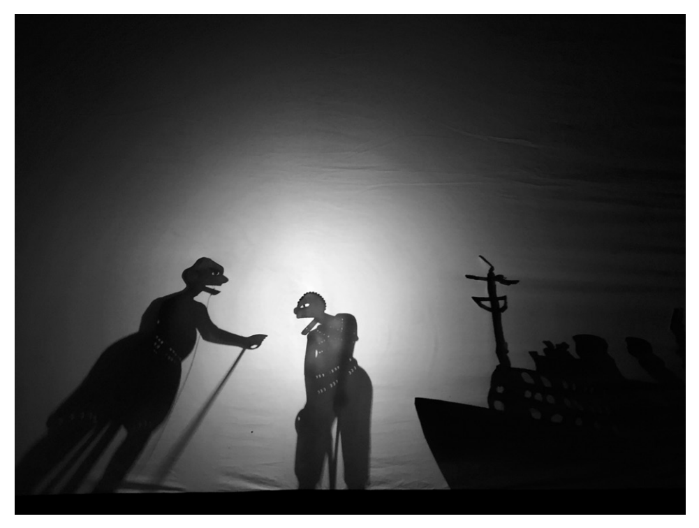
Figure 3: New localized multiethnic characters set at the port of Penang in the Malay shadow play Wayang Chulia . Photo by Tan Sooi Beng, 2016.