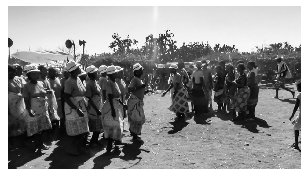
Figure 2: The Savazy II Women's association arriving at a mortuary ceremony with some money in a plastic bag on top of a stick. Screenshot, Soamanonga 2012.

of women's associations, and other women, did not voice wanting to break with their gendered roles in conversation with me.