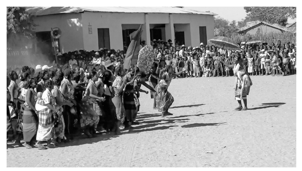
Figure 1: The Beadabo women's association during the visit of a Minister. Screenshot, Belamoty, 2011.

erally: 'numerous mothers'). The dancers flex their knees, lean their upper bodies forward, turning their heals in- or outward on every step, alternating the right and left foot to each beat of the music, whilst holding up the palms of their hands and an umbrella, rotating them regularly. Like the songs, this combination of embodied signs and dance acts are all signifiers of the circumcision ceremony in the central Onilahy Valley, particularly of the figure of the mother within this context.