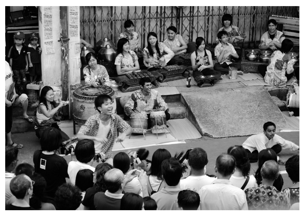
Figure 4: Performing to the market community in front of closed shop houses at Campbell Street Market. Photo by Tan Sooi Beng, 2008.

bak Muda performed in front of a row of shop houses that were closed to make way for cafes and restaurants. The performance in front of closed doors was a statement in itself. The performers also added lines about people moving out of their homes and shops in the course of the play. Additionally, through the research and performance of Opera Pasar , there was increased interest in the heritage Campbell Street Market; the market has now been earmarked for restoration and will not be closed down.