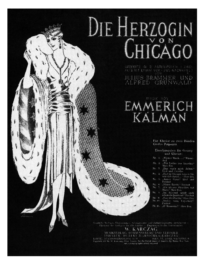
Figure 4: Cover of the piano-vocal score for Kálmán, Source: Kálmán 1928.

from operetta to the Broadway stage, doing so, however, by transforming traditional Viennese operetta themes to jazz. Kálmán's search to find an American jazz-inflected voice for the musical stage brought only limited success. When he composed his final work for the United States, Arizona Lady , in 1953, the last year of his life, it was a German radio performance that brought the unfinished score briefly to life in 1954. With a libretto about contested border-crossing between Mexico and the United States, Arizona Lady had its premiere and revival almost sixty years later, first in Chicago (2010) and then in Berlin (2014–2015 season). The New Budapest Orpheum Society, too, has sought to find the jazz-inflected voice of an exiled Jewish composer, affording it new possibilities through the moral imperative of commemorative performance (see e.g., Julia Bentley's recording of "Wir Ladies aus Amerika" on New Budapest Orpheum Society 2014, track 4).