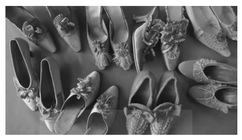
Figure 5.1 Luxurious footwear in Marie Antoinette.