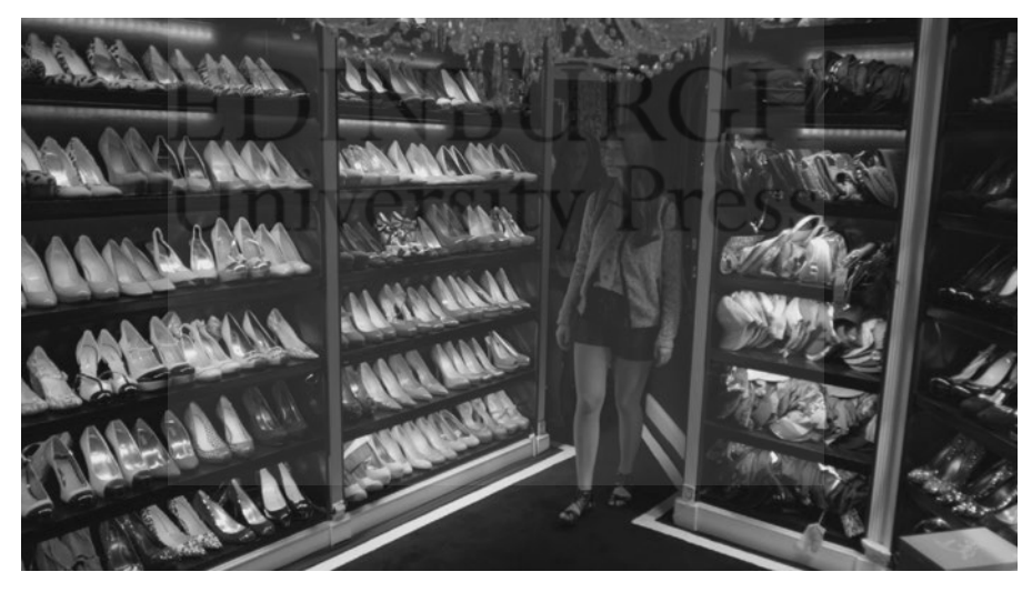
Figure 5.2 The abundance of shoes and accessories in The Bling Ring .

The Bling Ring 'narratively static and morally banal', Joe Neumaier from New York Daily News (2013) complains that 'half the movie is spent watching shallow kids try on other people's clothes'.