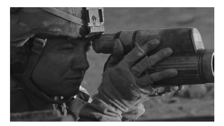
Figure 3.6 Guns as metaphor for cameras: meta-cinematic reflection on the war film.

is especially true in The Loveless (1982), Point Break (1991) and The Hurt Locker (2008). Even though she does not focus on time-images, Benson-Allott addresses the 'relentless duration' that characterises Bigelow's cinematography: 'For nothing much happens – but this nothing much nonetheless produces abrupt, brutal, and devastating violence' (2010: 34).