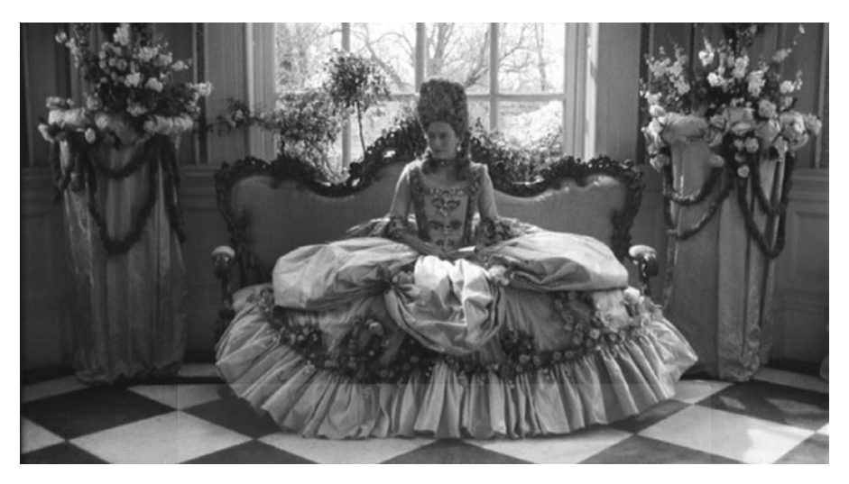
Figure 5.3 Orlando as a frosted blue cake.

'Society' parlour scene, 'Orlando is immobilised like one elaborate, frosted blue cake on a love seat' (Pidduck 1997: 176). Marie is likewise paralleled with the lavish pastries, abundantly displayed throughout the film; as the Duchesse de Polignac remarks at one point, 'she looks like a little piece of cake'.