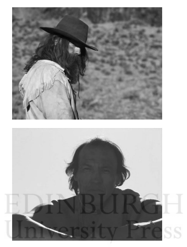
Figure 4.2 The duel of the gazes.

characters in the film, is terrified, and in her first encounter with the Cayuse she deploys a gun. The figure of the protagonist armed with a rifle, reproduced in the film's poster, traces a correspondence between female empowerment and white vigilantism. If, according to Robert Warshow, the values of the Western are expressed 'in the image of a single man who wears a gun on his tight' (1964: 105), then Emily effectively reinstates this image, without necessarily questioning its values.