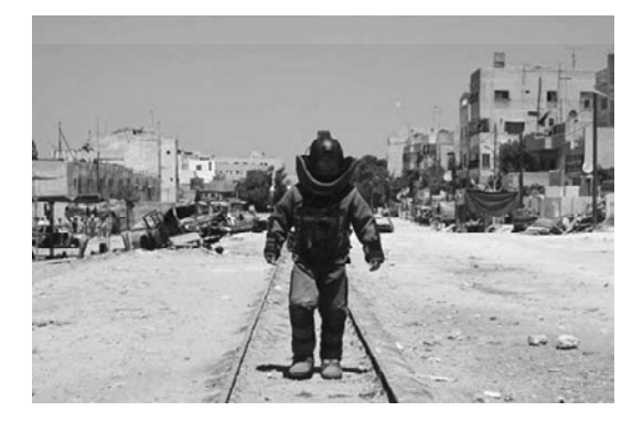
Figure 3.2 James as the heroic figure in the untamed landscape who asserts mastery over the environment.

In The Hurt Locker , most of the scenes take place in open spaces – paradigmatic of the representation of the frontier in Westerns – which are