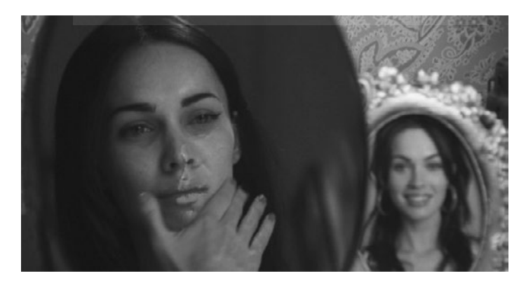
Figure 2.4 Postfeminist regime exposed.

Remarkably, in Needy's penetrating comments, intertextual mechanisms play an important role. One of the traits that she shares with other heroines – for example, with the Fitzgerald sisters in Ginger Snaps – is her great passion for horror cinema. That she is a fan is alluded to by her T-shirt and posters that cover the walls of her bedroom, which make reference to The Evil Dead (Sam Raimi, 1981), a B-movie horror flick with heavy doses of gore, humour and intertextual play. Needy's erudition stands in contrast to Jennifer's plain ignorance, who confuses Rocky Horror Picture Show (Jim Sharman, 1975) with a boxing film and whose filmic sensibility is expressed through films such as