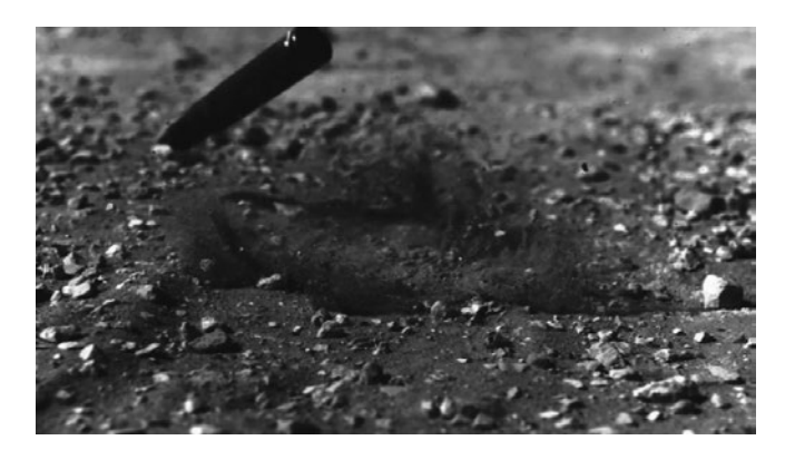
Figure 3.5 Dilated temporality: the Western trope made eerie.

bullet hitting the sand. However, the combination of time-images together with the uncanny guitar accompaniment produces a disturbing effect which has little to do with the carnivalesque approach to representing violence in spaghetti Westerns. The ironic resonances of the Western seem to dramatise American failure in Iraq: the sequence development does not lead to a stable social order, and the climax – when the last Iraqi man dies – is deprived of any heroic or victorious tone. Significantly, the same guitar music is heard again at the end of the credits, just after 'Khyber Pass' – an anti-Bush anthem composed by the heavy metal band Ministry.