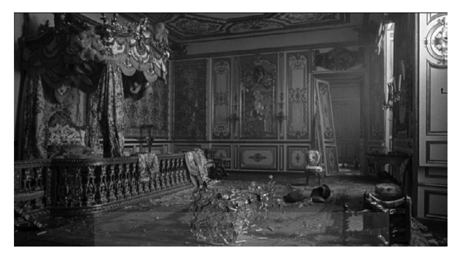
Figure 5.6 The palace is destroyed, but Marie Antoinette (temporarily) escapes punishment.

means by which Marie was defined by court and public is summed up in that bedchamber, and now it has been killed. (2010: 376)