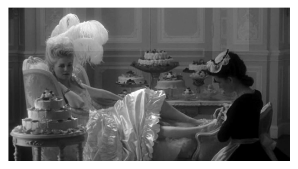
Figure 5.5 Marie Antoinette's direct mode of address.

The Queen's direct look at the camera echoes Orlando's similarly enigmatic mode of address in Potter's adaptation of Virginia Woolf's novel, which – as many scholars have claimed – offers a humorous commentary at key moments during the film. This address has sometimes been interpreted as a self-conscious rejection of the conventional notions of authenticity in favour of a dialogic retelling of the past, as well as foregrounding authorship in terms of revision