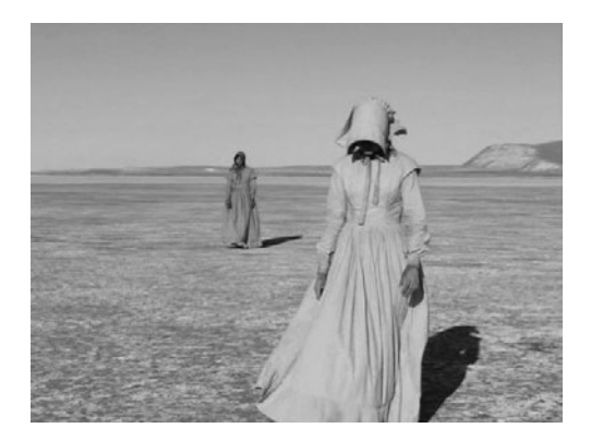
Figure 4.4 Flat affect and underperformed emotions.

containment, enigma, coldness, monotony and absence, which challenges the more traditional representations of 'female' emotions in film history. Already in Reichardt's previous film, Wendy and Lucy , Williams communicated this affective neutrality: her expressions are reduced to a minimum. Reichardt emphasised: 'I knew I needed someone who could be very still without coming across as emotionally dead' ('Wendy and Lucy: Press Notes', 2008). Williams seems to suppress emotions and exteriorise the apparent emptiness that surrounds her; this inexpression or even resistance to represent legible emotions can be interpreted as an attempt to avoid drawing attention to herself or as a rebellion against the demands to give a settled response to a situation – a response that would box her into the melodramatic registers traditionally embodied by female characters in the Western.