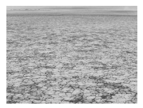
Figure 4.5 Haptic inhospitability of the land(scape).

Thus, the affective qualities the film generates through its representation of the desert are not necessarily detached from the more conscious cognitive perception. As Mary Harrod argues in her article on the aesthetics of pastiche: