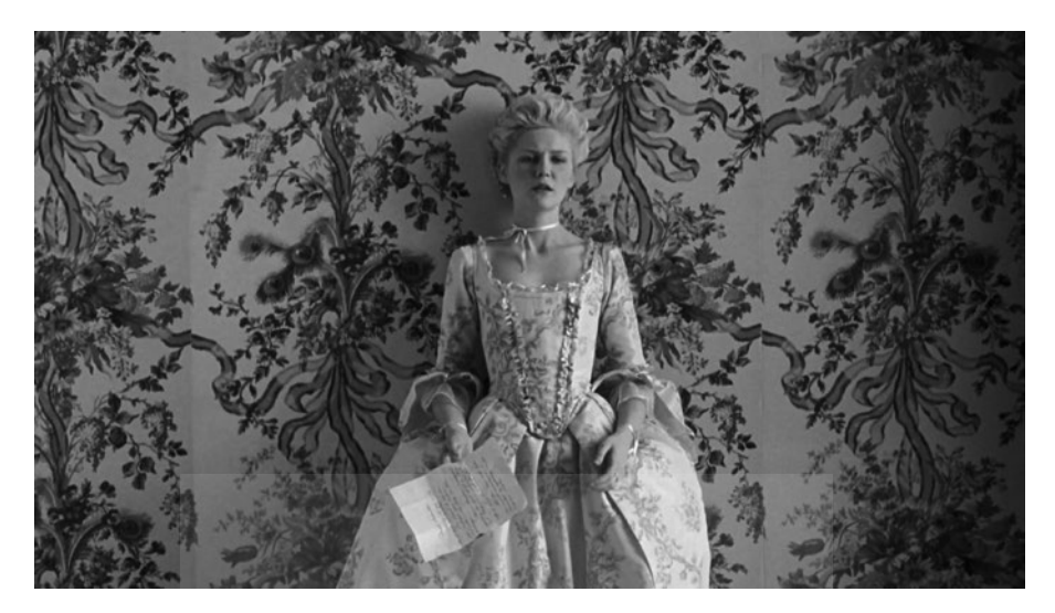
Figure 5.4 Marie Antoinette blends and disappears into the ornate floral-patterned wallpaper.

of the camera matches the pace of her movements and draws us tentatively closer to Marie Antoinette. This scene, which culminates in a close-up on her tearful face, is highly emblematic of how the protagonist's pain is visualised and played out through the sensuously textured details of the mise-en-scène.