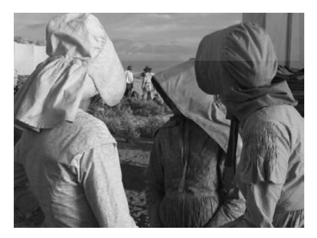
Figure 4.1 The gendered organisation of space: men withdraw to deliberate the course, while women look on from a distance.

The bonnets, which serve as a protection from the harsh sun by effectively covering the women's faces, render them anonymous, as well as highlighting their exclusion from decisions about their own fate. Throughout the film, the three women are often framed together, and away from the men. While the men draw apart to debate their course, the camera constantly keeps the women at a distance – a device that underscores the spatial organisation of knowledge.