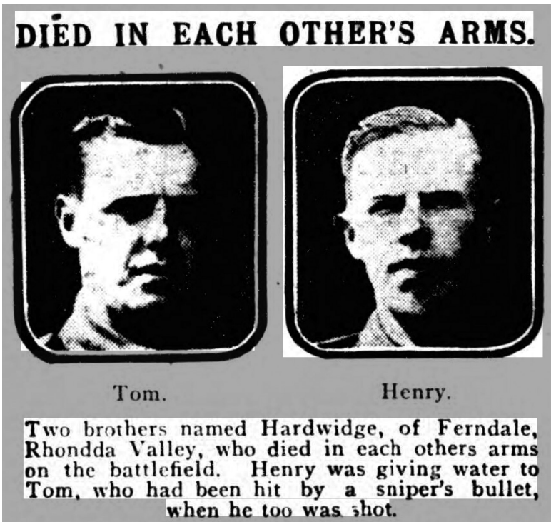
Figure 5 'They died in each other's arms', Daily Mirror , 24 August 1916.