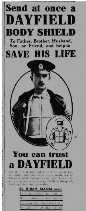
Figure 1 Advertisement for the Dayfield Body Shield.