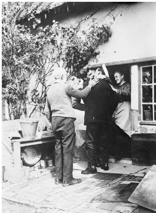
Figure 3 Soldier and sailor brothers greeting each other upon their arrival on leave at their parents' house.

These formed part of Nicholls' series of soldiers on leave, perhaps reflecting his aim to 'build up a "story"' around his subjects. 126 The two photographs show that, like many of Nicholls' images, this 'meeting' was carefully posed and looks staged. The story that the image imparts is one of brotherly love and affection. Clearly, the trope of loving brotherhood was one that the official photographer of the home front wanted to propagate.