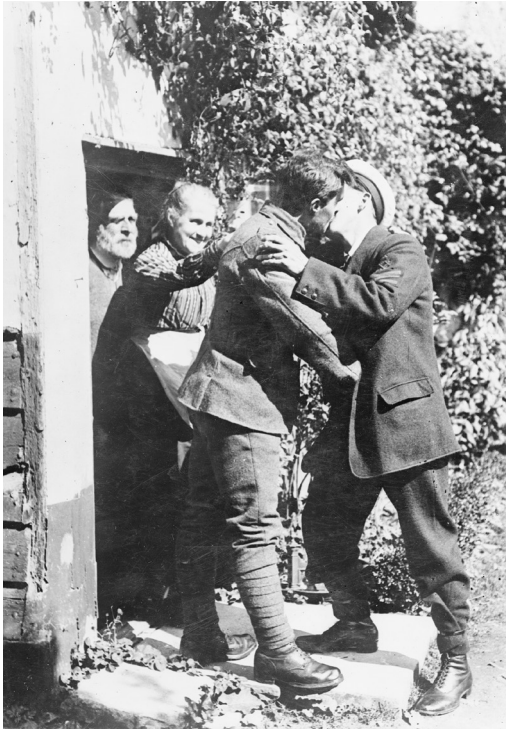
Figure 2 Soldier and sailor brothers greeting each other upon their arrival on leave at their parents' house.

There is a significant absence of the brotherly kiss in these narratives. Brothers' bodily contact on meeting was usually handshaking or hugging. Das's analysis of the 'dying' or 'mothers' kiss suggests that 'friendly' male-to-male kisses saw a revival in the trenches, a reversal of the 'normal tactile codes' which restricted the 'friendly kiss' to ladies. Horace Nicholls, appointed the first full-time Official Photographer of Great Britain in July 1917, captured striking images of a soldier and sailor brother kissing (Figures 2 and 3).