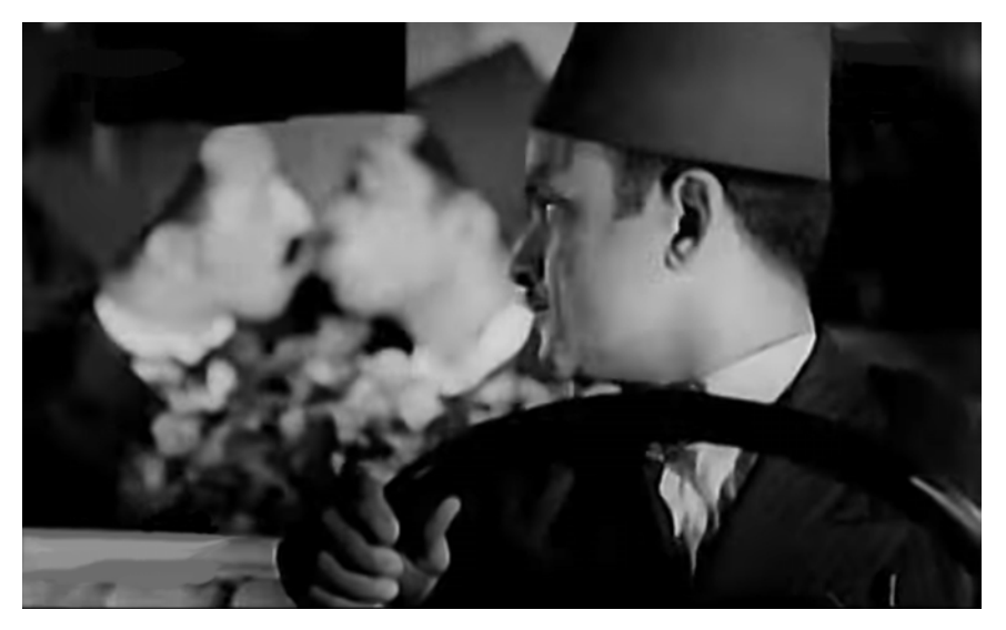
FIGURE 26. A driver watches Chalom (Leon Angel, left) and 'Abdu (Ahmad al-Haddad) kiss. Screenshot from Mistreated by Affluence (Togo Mizrahi, 1937).

CODA: "THE STORY OF A WOMAN WHO WAS TRANSFORMED INTO A MAN"