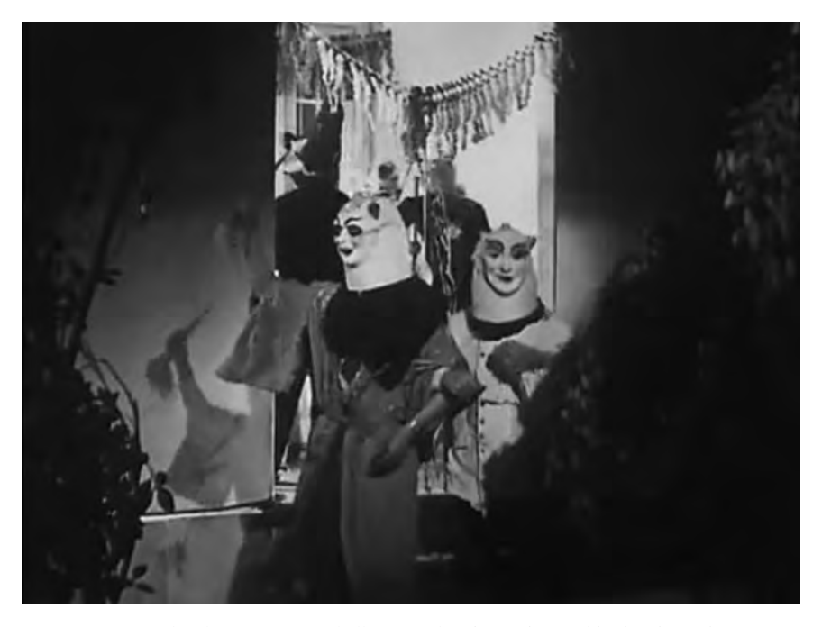
FIGURE 12. Revelers leave a costume ball. Screenshot from The Neighborhood Watchman (Togo Mizrahi, 1936).

out, vice versa, upside down, such is the direction of all of these movements. All of them thrust down, turn over, push headfirst, transfer top to bottom and bottom to top, both in the literal sense of space and in the metaphorical meaning of the image."<sup>56</sup> The conclusion of the masquerade scene may cross the boundaries of good taste. But, following Bakhtin, we can read this elevation of the vulgar and debasement of the cinema as an embrace of the subversiveness of carnivalesque farce.