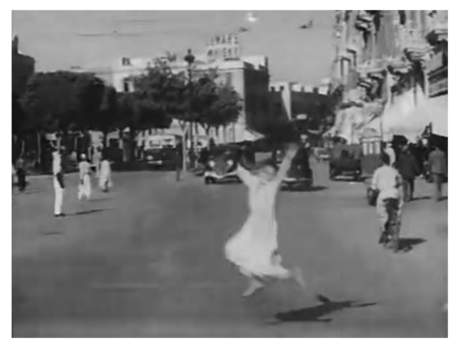
FIGURE 28. Manshiyya Square, Alexandria. Screenshot from Seven O'Clock (Togo Mizrahi, 1937).

Alexandria's eastern harbor. At the end of the shot, the camera has turned around, orienting itself inward toward Egypt, ad Aegyptum . In the diegesis, too, circular urban trajectories give way to a journey along a linear axis. From its position on the Alexandria seaside promenade, the camera points southward, establishing the trajectory of the narrative.