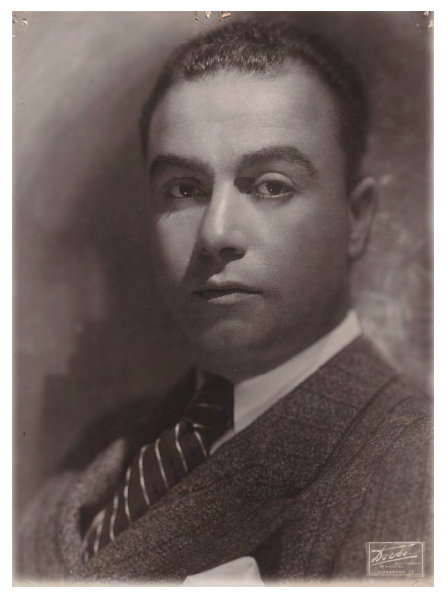
FIGURE 2. Portrait of Togo Mizrahi.

later graces the same shop—as children of Egypt. This book examines the place of Togo Mizrahi, "child of Egypt," in Egyptian cinema history.