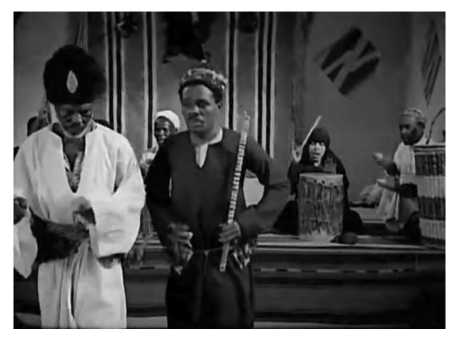
FIGURE 32. Performers at a wedding celebration in Aswan. Screenshot from Seven O'Clock (Togo Mizrahi, 1937).

blackface stage persona, he may here, too, implicitly lay claim to Sudanese ancestry. But we also can't ignore the way this footage exoticizes Nubia for the urban Lower Egyptian viewer, and fails to distinguish between distinct Afro-Muslim cultures.