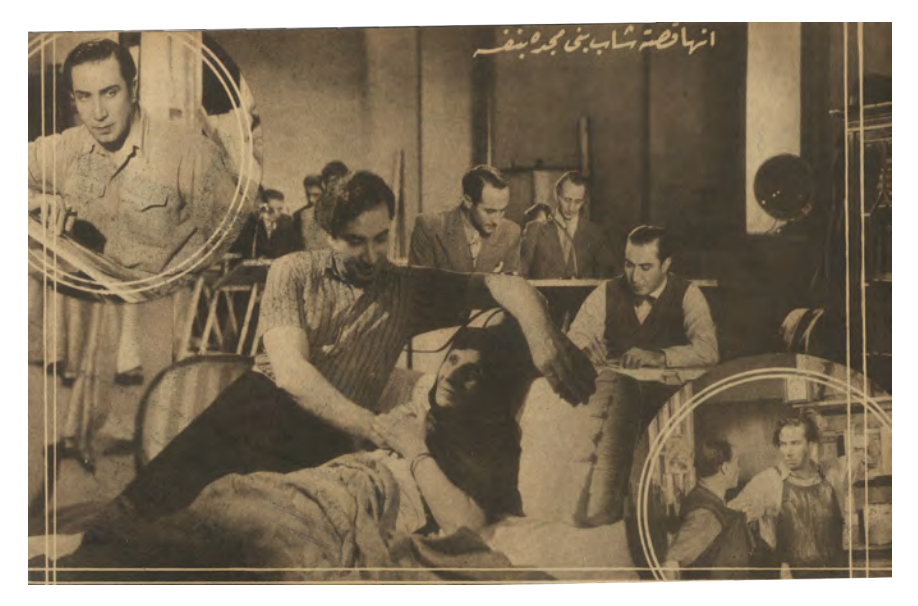
FIGURE 34. A collage, entitled "The Story of a Self-Made Man," shows Ahmad (Yusuf Wahbi) in his many guises: devoted son (center left); engineer at a firm in Italy (center right); mechanic (lower right); and engineer for colonial project in Sudan (upper left). Pressbook for A Rainy Night (Togo Mizrahi, 1939).

Ryzova calls an effendi narrative—a narrative that becomes even more popular in Egyptian cinema during the following decade.<sup>16</sup>