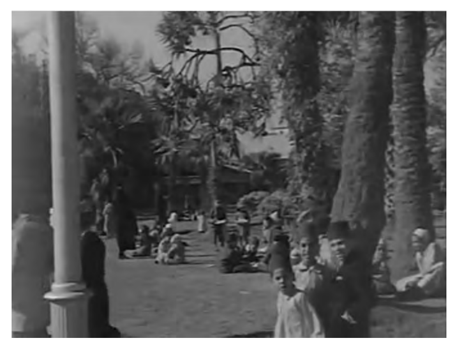
FIGURE 1. Alexandria residents relaxing in a park. Screenshot from Mistreated by Affluence (Togo Mizrahi, 1937).

The footage shows what appear to be Alexandria residents engaging in leisure activities in identifiable locales. None of the credited actors appear in the montage. Children display curiosity about the camera. The viewer is invited to read these images as authentic—even as we recognize the constructedness of the montage. Social codes of dress give the viewer cues to categorizing the individuals included in the footage. Members of the rising middle class—the effendiyya —are shown seeking entertainment and diversion alongside members of the popular classes.<sup>2</sup> This carefully edited montage constructs a festival day in which Alexandrians across the socioeconomic spectrum celebrate in public spaces together.