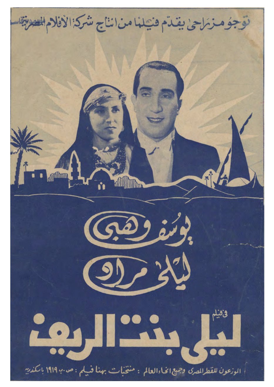
FIGURE 40. Pressbook for Layla the Country Girl (Togo Mizrahi, 1941).