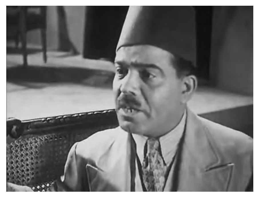
FIGURE 14. 'Ali al-Kassar in his double role as the crime boss. Screenshot from The Neighborhood Watchman (Togo Mizrahi, 1936).

comprehend that they are helping to circulate counterfeit bills printed by the gangsters. They are unwitting agents of exchange.