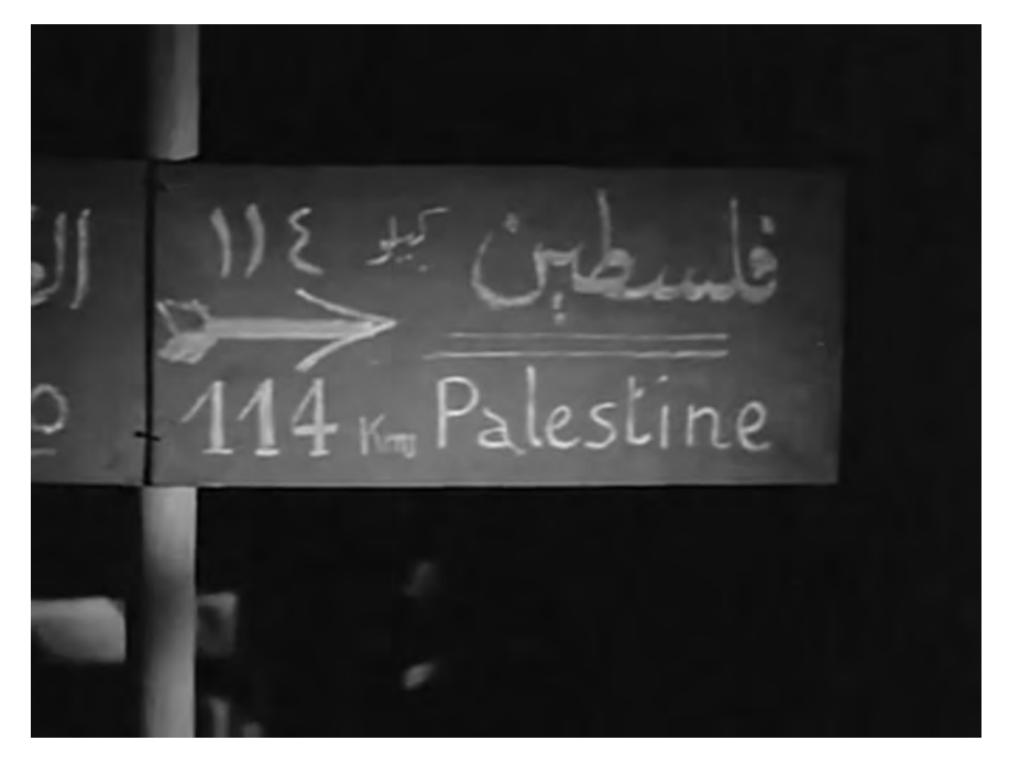
FIGURE 39. Bilingual directional sign near the customs house in Isma'iliya indicating the distance to Palestine. Screenshot from The Straight Road (Togo Mizrahi, 1943).

The accident conveniently provides cover for the later loss of the gold. A telegram sent to the Egyptian Nationalist Bank states that the driver's body was not found but that a bag and a wallet belonging to Yusuf Fahmi were recovered. The article from the newspaper Al-Jumhur that Ibrahim reads out loud in Suraya's dressing room in Beirut notes that no trace of the body or the gold has been found. The two pieces of news, delivered in Cairo and Beirut, bracket the absence in Palestine, and grant it signification: on the one hand, news of Yusuf's presumed death, and on the other, revelation of Yusuf's survival but the demise of his identity.