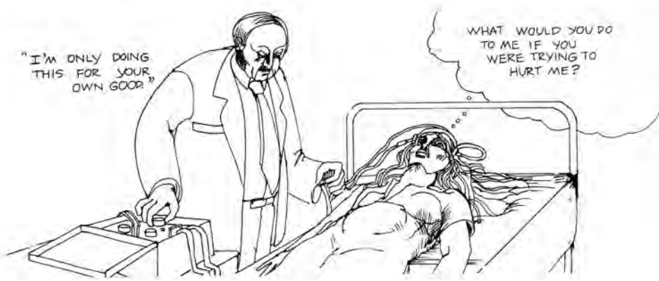
7.1 Dorothy Nissen Sibley, "ECT," Asylum 1, no. 2 (1986): 20, reprinted in 2010 and 2014.

suggestion of gender ambiguity). The image clearly suggests that the male doctor has significant power over the prone and helpless-looking female patient. The second main criticism of ECT is that it is harmful and the threat of ECT is used as a way to ensure compliance with treatment regimes. In the cartoon, the patient draws attention to the paradox of using something potentially harmful as a form of treatment. The cover image for the special ECT issue of Asylum shows a campaigner holding a "No forced shock" placard, with the accompanying text, "brain damage as therapy." Sibley's cartoon draws attention to the paternalism often used as a justification for this practice (the Dr. says, "I'm only doing this for your own good"). Sibley's cartoon allows us to see this psychiatric critique very clearly, through the patient's dark humor (expressed as "what would you do if you were trying to hurt me?"), clearly suggesting that the treatment is ultimately experienced as harmful, not helpful.