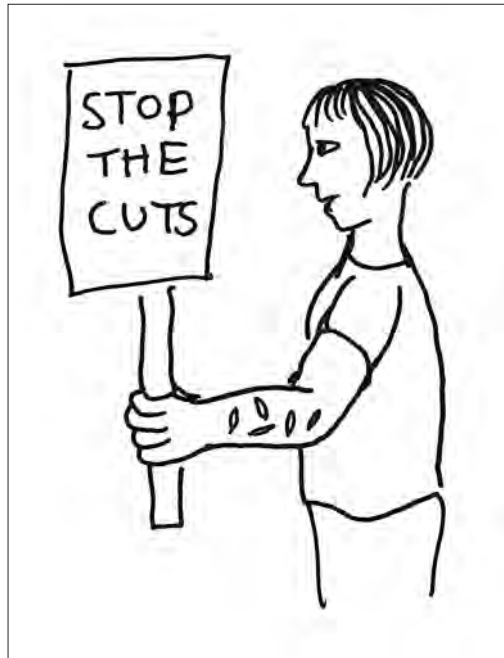
7.5 Tamsin Walker, "Stop the Cuts," Asylum 20, no. 2 (2013): 26. Courtesy of Tamsin Walker.