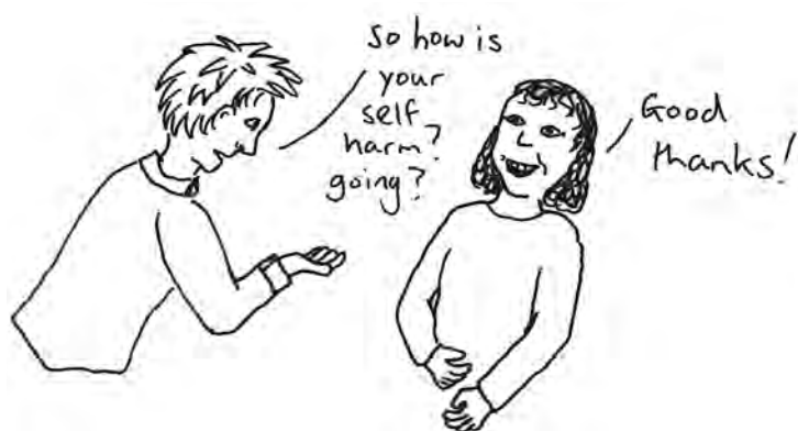
7.2 Tamsin Walker, "How Is Your Self-Harm Going?" Asylum 20, no. 2 (2013): 20.

In parallel, survivor activists attempted to create alternative understandings of self-harm as a "silent scream," a coping strategy, and a reasonable response