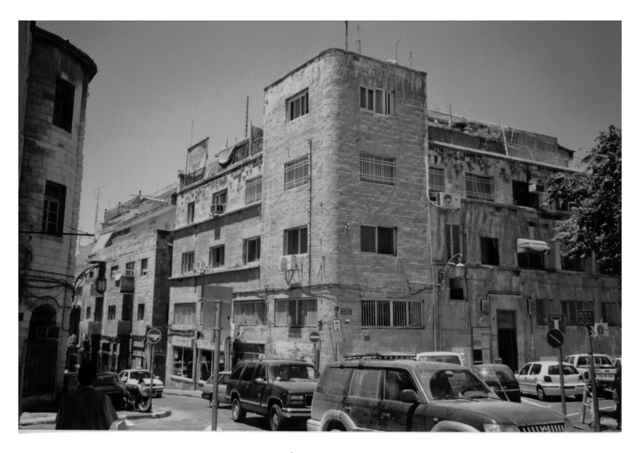
Building of The Palestine Post