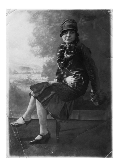
At a photographer's studio, 1932