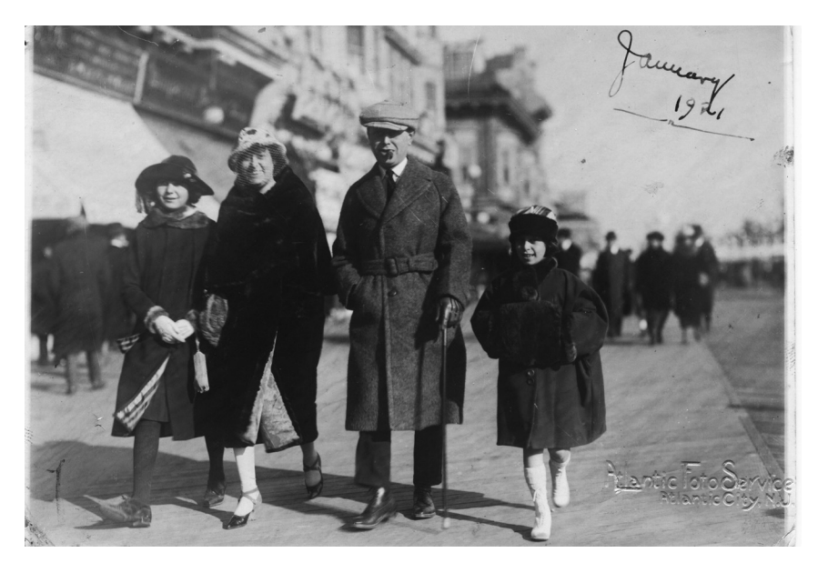
On Atlantic City boardwalk with parents and sister, 1921