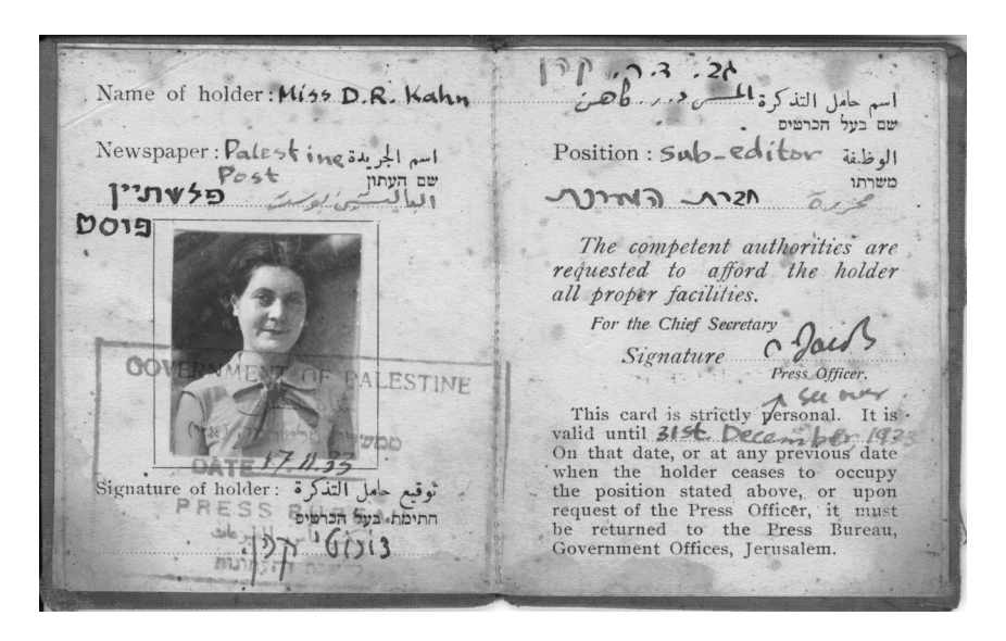
Journalist's ID card from The Palestine Post, 1933