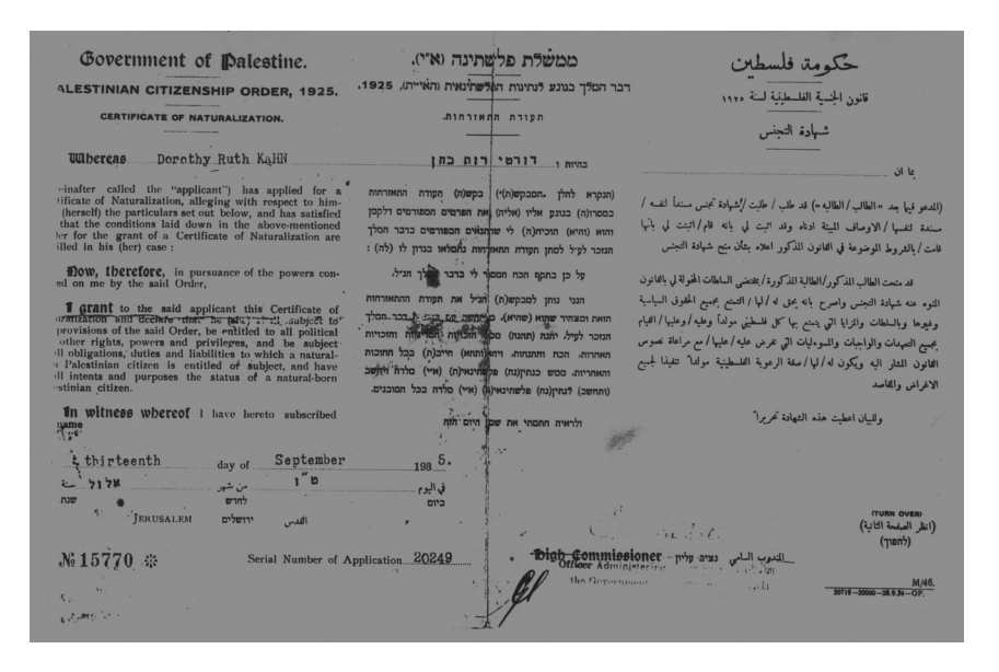
Certificate of Naturalization as a citizen of Mandatory Palestine, 1935