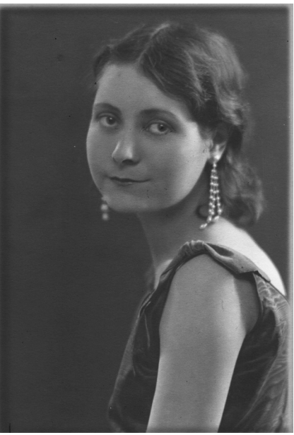
In Atlantic City, 1932