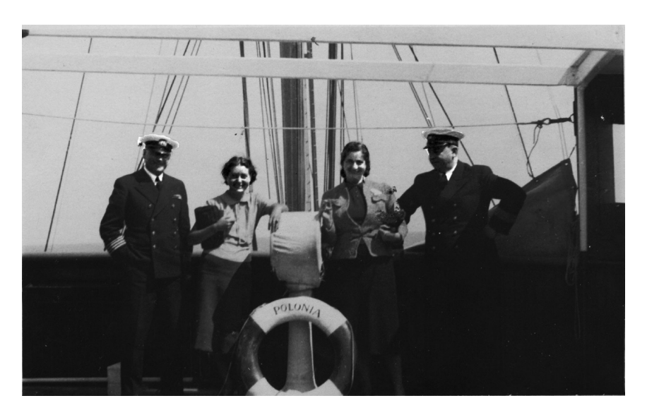
On the ship Polonia on the way to Poland, 1937