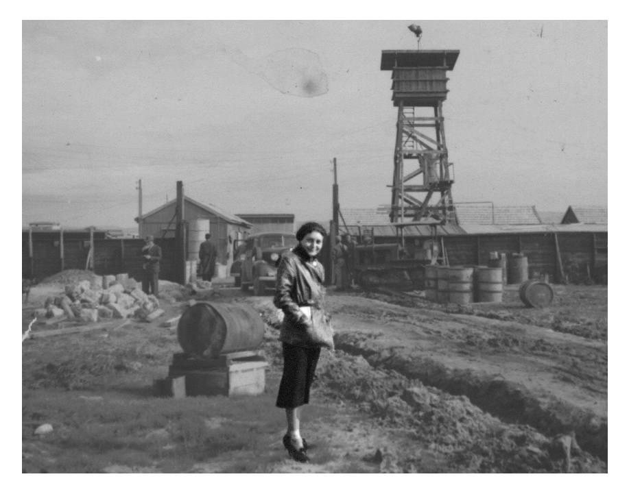
Visiting a new settlement, 1938