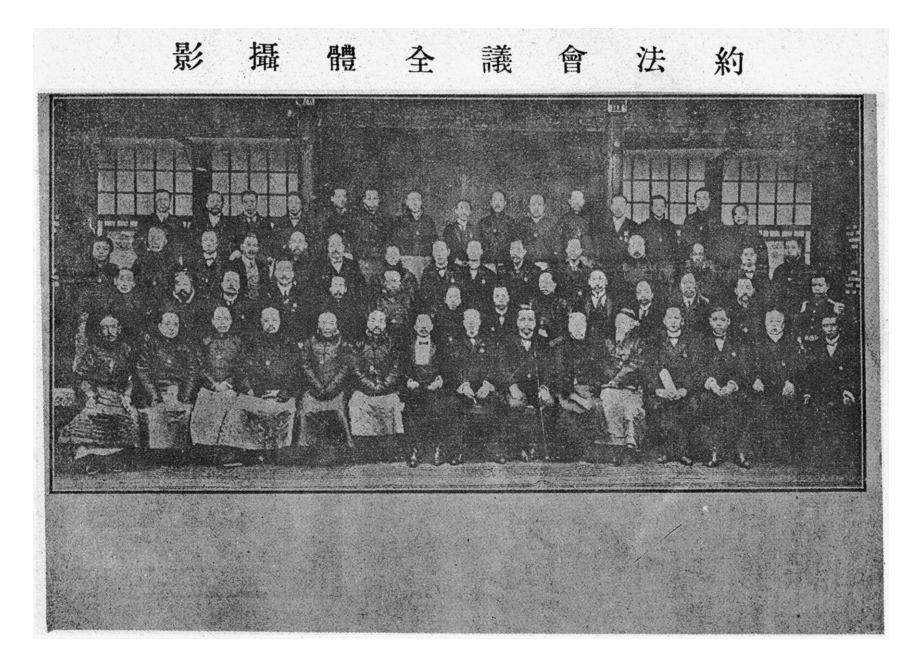
Figure 1.3 Yuefa huiyi quanti sheying [Group photo of the Constituent Assembly]. Dongfang zazhi 東方雜誌 11, no. 2 (Minguo 3 [1914]).

formed the Provisional Government during the Revolution of 1917, while a universally elected omnipotent parliament – the All-Russian Constituent Assembly – was supposed to resolve the Russian imperial crisis, which inter alia manifested in the disastrous First World War (1914–1918). At the same time, parallel to the institutions of the Provisional Government and the new zemstvo and municipal authorities, which were reformed on the basis of universal suffrage, the soviets ("councils") reemerged (after their brief appearance in the Revolution of 1905–1907) as the bodies of class self-government. Although this situation was frequently interpreted as "dual power," some socialists and liberals in fact viewed the soviets as "legislative chambers of deputies" and the Petrograd Soviet as "a surrogate people's duma ," which replaced the State Council in a two-house parliament of new Russia.<sup>107</sup>