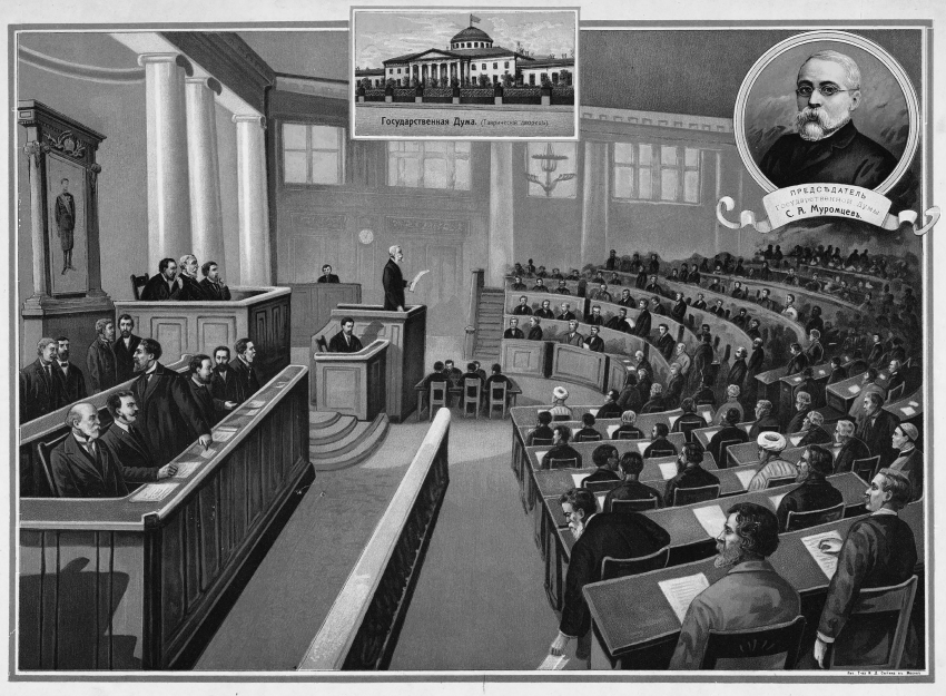
Засѣданіе первой Государственной Думы.

Figure 1.1 Zasedanie pervoi Gosudarstvennoi dumy [The session of the First State Duma]. Moscow: Lit. T-va I. D. Sytina, [1906]. The text at the top reads "State Duma. (Tauride Palace)." The text at the top right corner reads "Chairman of the State Duma S. A. Muromtsev."