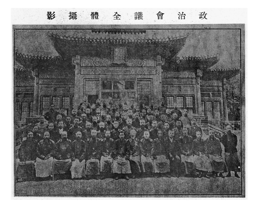
Figure 1.2 Zhengzhi huiyi quanti sheying [Group photo of the Political Assembly]. Dongfang zazhi 東方雜誌 11, no. 2 (Minguo 3 [1914]).

constitutional design conformed to the recommendations given to him by advisors such as Ariga Nagao and Frank Johnson Goodnow. Hence, these institutions also reflected a current of contemporary constitutional scholarship which accorded a powerful position to the head of the executive, regardless of whether he be an emperor or a president.<sup>102</sup>