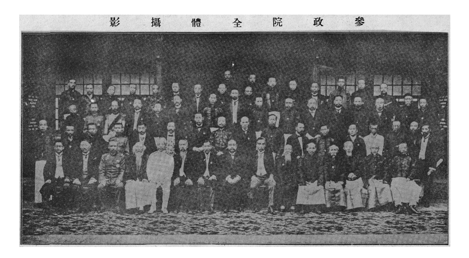
Figure 5.3 Canzhengyuan quanti sheying [Group photo of the Political Participatory Council]. Dongfang zazhi 東方雜誌 11, no. 2 (Minguo 3 [1914]).