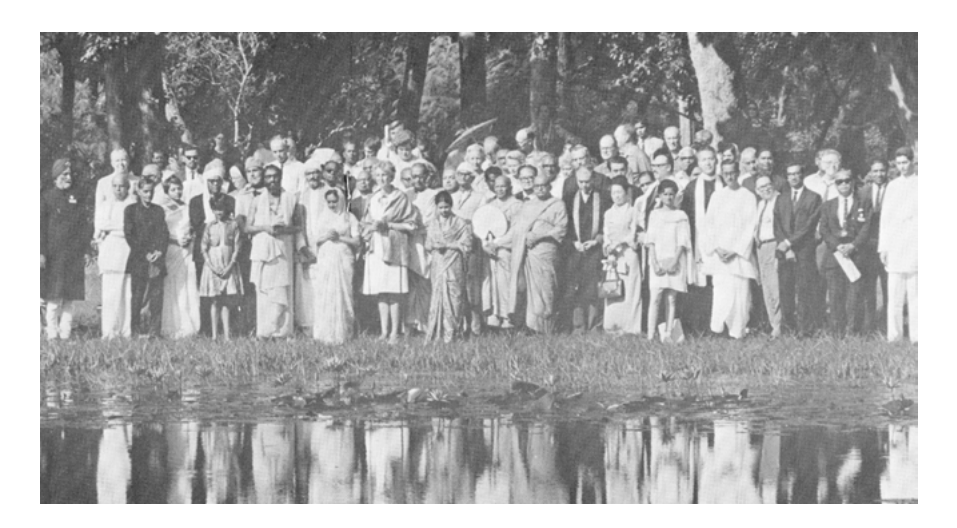
Fig. 2: Common prayer of the participants at the First Spiritual Summit Conference<sup>45</sup>

On the morning before the last day of the conference, all those attending gathered together and crossed the Ganges River by steamboat to the Calcutta Botanical Gardens. At this occasion, they offered a communal interfaith prayer on the salvation of humankind.