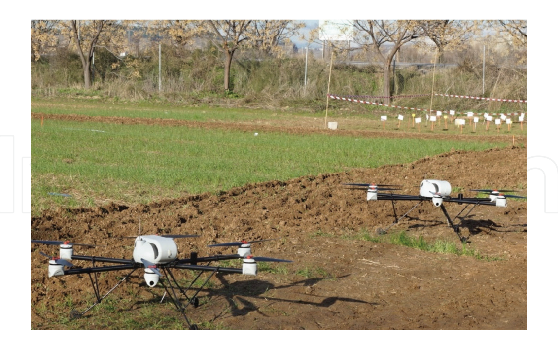
Figure 2. Aerial units of RHEA project.

The drones were equipped with two high-resolution cameras ( 4704 \times 3136 ) mounted on a gimbal system. A multi-spectral device that includes visible and near infrared (NIR) channels was selected to maximize the robustness under different light conditions. Moreover, in order to preserve the complete colour information, the solution uses a coupling of two commercial still cameras: one of them modified to provide the NIR channel. The flights were performed with an elevation of 60 m to obtain a resolution of 1 cm per pixel with each image covering approximately 40 \times 30 m and overlapping 60% with the consecutive ones.