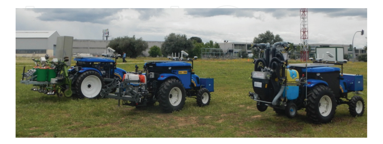
Figure 1. Ground units of RHEA project.

Usually, weeds are not uniformly spread over the fields but are located in patches. For this reason, the first step of the mission is to obtain high-precision aerial images to locate the patches in the field. The location of the patches will allow defining optimal paths for the tractors. This task requires a thorough planning of the flights, which was our main task in this project. Several area coverage planning techniques were applied taking into account spatial and temporal requirements, in order to generate optimal and safe flight plans for the drones. A complete description of the aerial mission can be found in Refs. [102, 103].