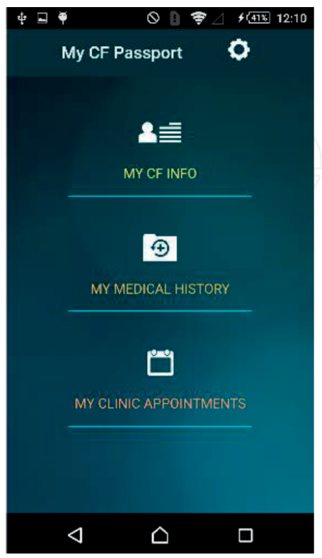
Figure 2. Login screen (left) and main menu in the passport (right).