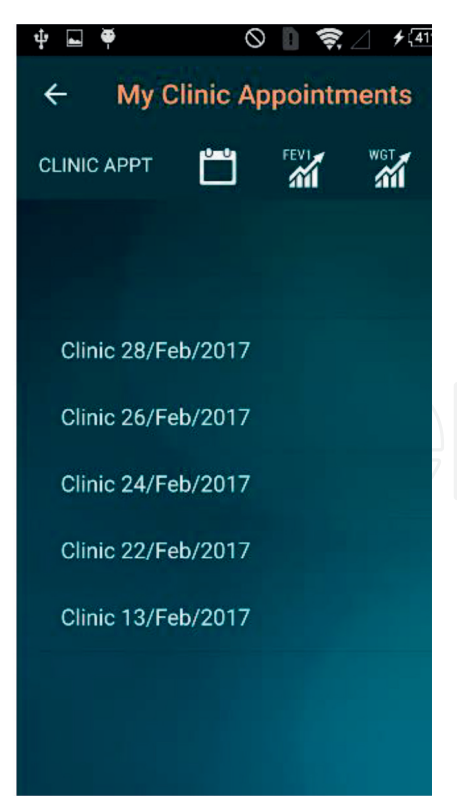
Figure 3. Menu from the "My CF Info" section (left) and list of saved clinical appointments in "My Clinic Appointments" (right).