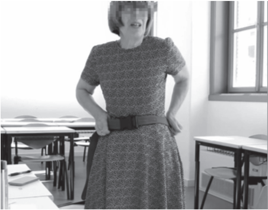
Figure 5.1 A participant tests the belt

The interaction between researchers and participants made it possible to identify different dimensions affecting the phenomenon via the design of assistive technologies: among them, aesthetic appropriateness and social sensitivity. Participants commented on the characteristics of the artefact and their implications by letting the prevailing social-material configuration of elderliness surface.