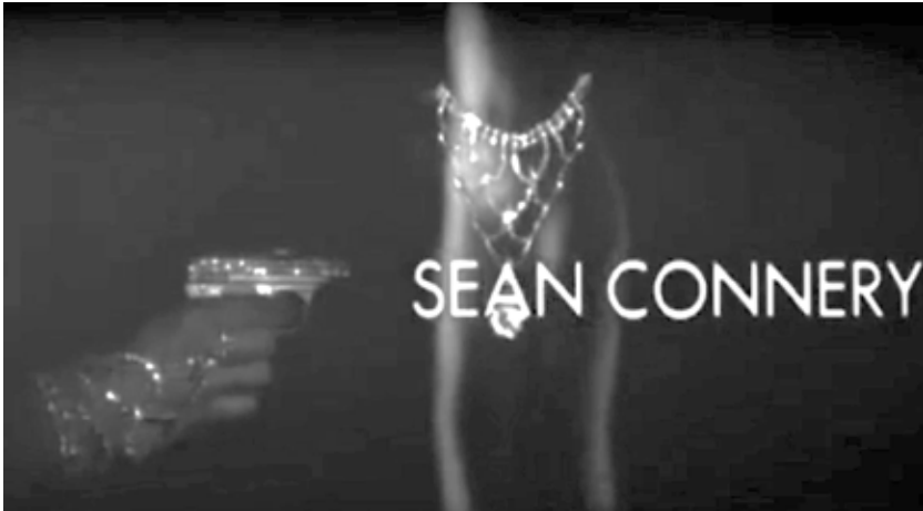
3. Title Credits from Diamonds Are Forever (UK: Guy Hamilton, 1971). Copyright of Eon Productions, United Kingdom; and Danjaq, LLC, United States of America.