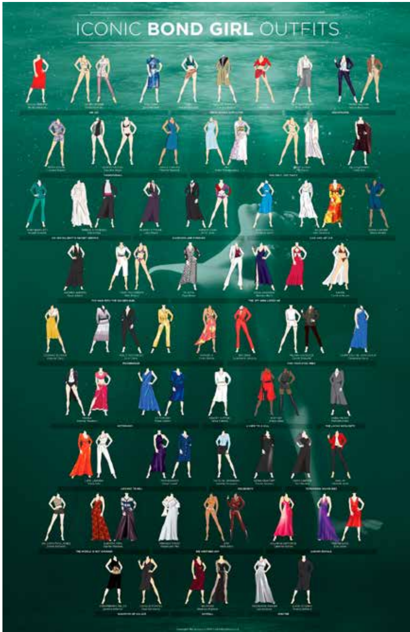
2. Promotional poster (2015) for the “most memorable” Bond Girl outfits, produced in anticipation of the release of Spectre (2015). Copyright of the London-based marketing company The Big Group Limited, United Kingdom.