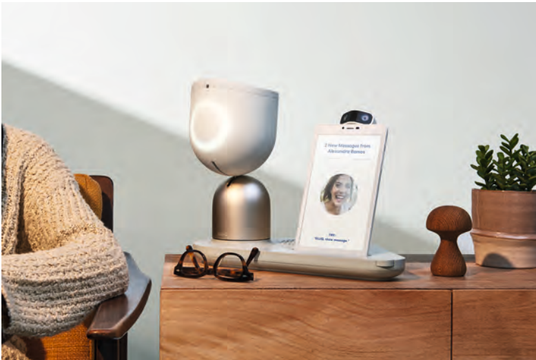
[Figure 1] Intuitively to understand, the object ElliQ, Credits: Intuition Robotics

A body of two split ellipsoids, one ellipsoid mounted on top of the half-round of the other, with smooth edges and a light circle that expands and shrinks from the middle of the upper split-ellipsoid to signal a communication with the target person, an elderly lady. This strange-formed object is a social robot who at first sight reminds us more of a designer lamp kept in the back corner of the living room than of a private companion. But its producers, the American company Intuition Robotics, gave her a name and a voice. In the eyes of the company, ElliQ is this new member of the daily lifeworld for elderly people living alone, which can be placed between a design object and a living companion, between the non-living agent and the agent elderly people would like to talk to: “She sounds like a machine. She feels like a machine—but she has that one-of-a-kind personality that will help her users develop an enchanting feeling towards her.” This intermingling of bodily passivity and social activity should form a core for users, as the company writes, “to intuitively understand the object in front of them so that they could naturally access this intelligence they perceive” (fig. 1).